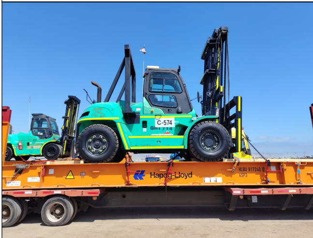
19. Another view of crane lashed over container.