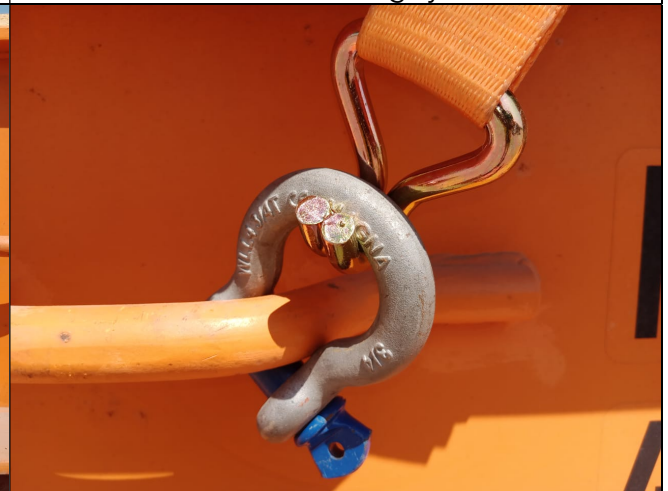
16. View of lashing system.