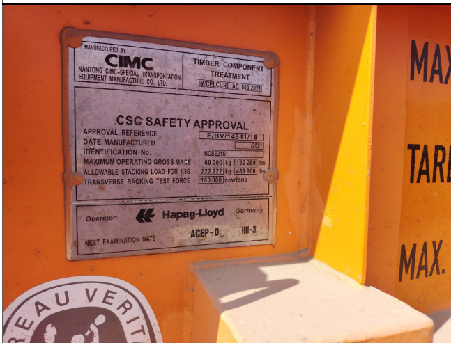
3. Container CSC Plate