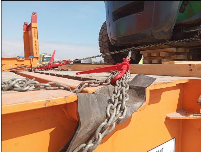
9. Another view of spanners lashed with chains and tensioners with hooks.