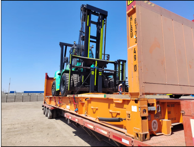
17. Final view of crane lashed over container.