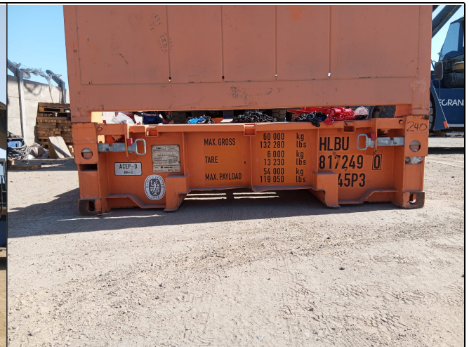
2. Identification and characteristics of HLBU 817249-0