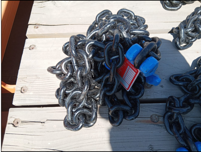
5. Steel Chain capacity of 3.200 Kgs. SWL