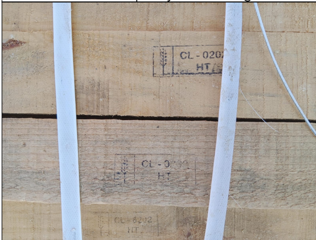
7. Square lumbers with ISPM15 stamp.