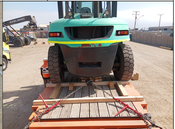
8. View of spanners lashed with chains and tensioners with hooks.