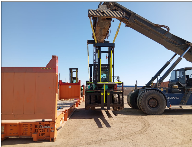
1. Flat rack container (1x40'FR) HLBU 817249-0