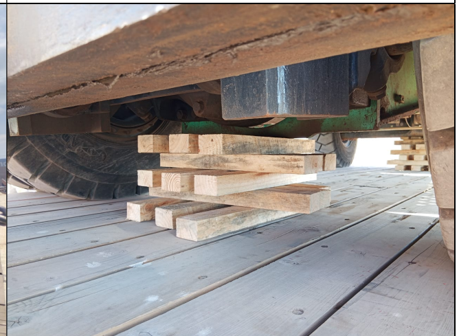
12. Square ladders used under crane.