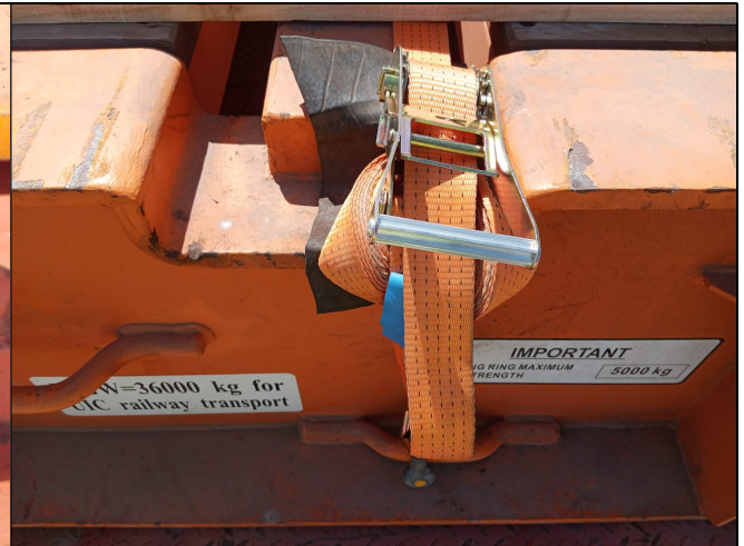
14. View of lashing system.