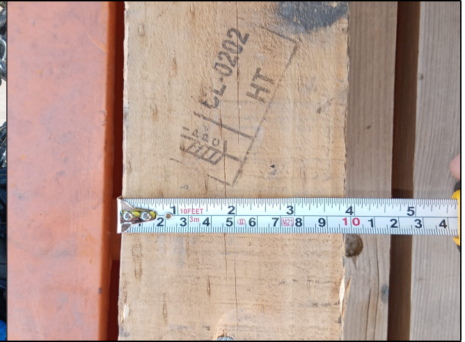
6. Square lumber of 4"x4" inches