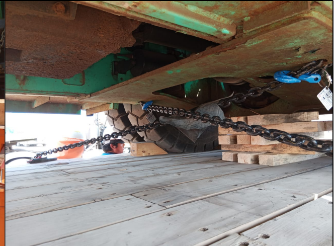
10. Rubber protection placed between chains