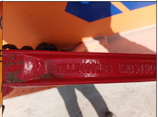
4. Steel spanner capacity of SWL of 2.500 kgs