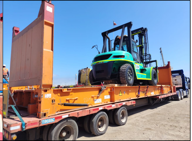
18. Another view of crane lashed over container.