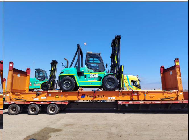
20. Another view of crane lashed over container.