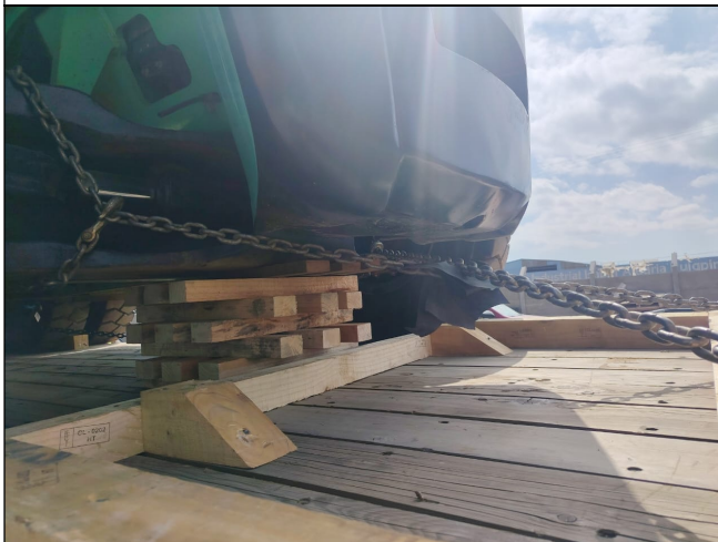
11. Forklift lashed with chains and chocked with square ladders and wedge.