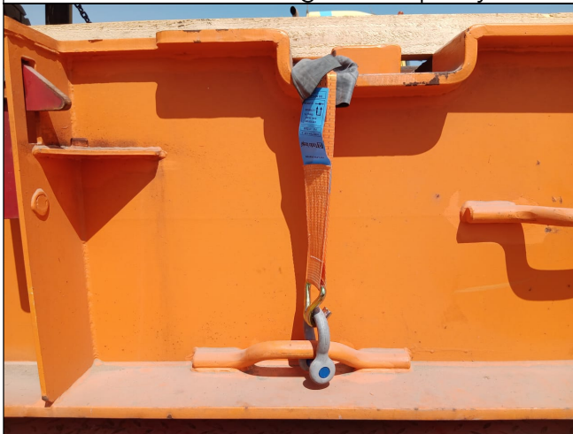
15. Another view of lashing band capacity