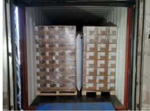
16. Stuffing finished.