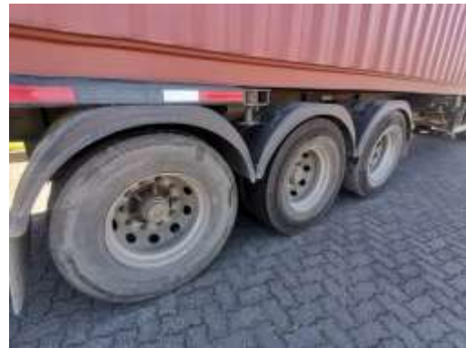
6. View of the outside/undercarriage.