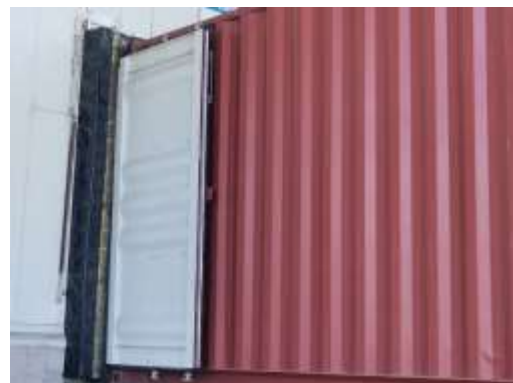
8. Inside door of the container.