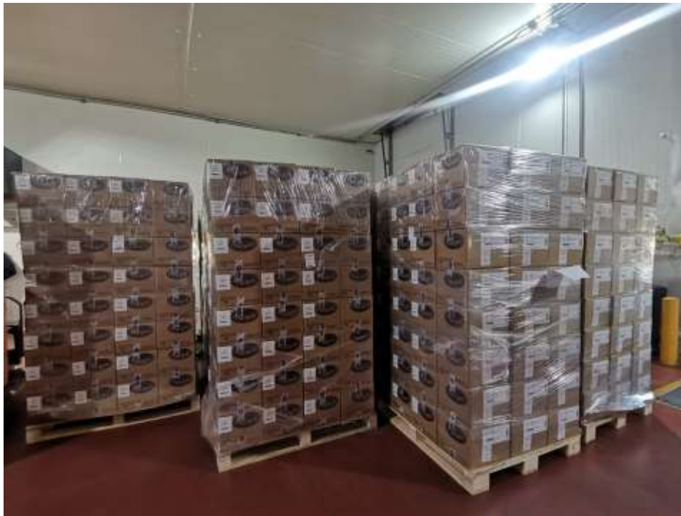
Boxes unitized in pallets, prior to the start of the stuffing operations.