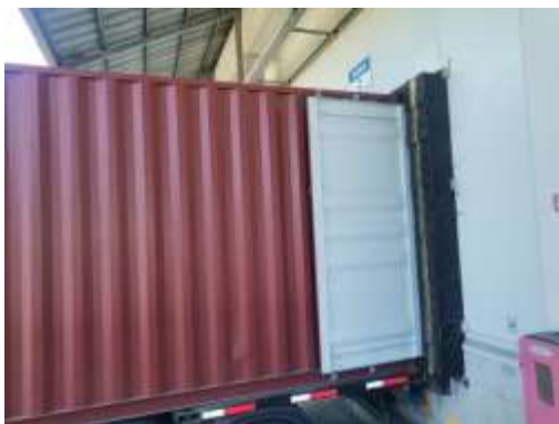
7. Inside door of the container