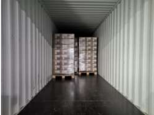
15. Stuffing in progress.