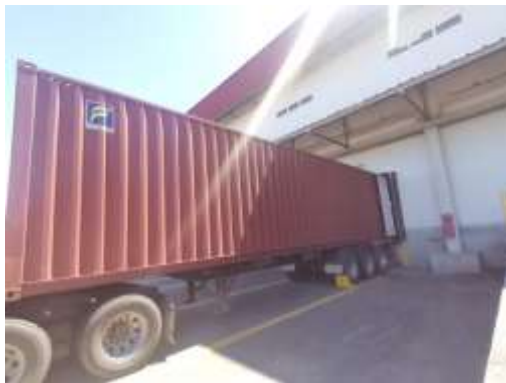
1. Container before stuffing.