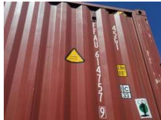
2. Container number: FFAU 614757-9.