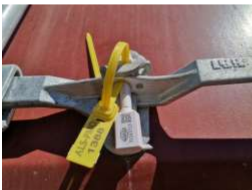
19. View of the seals: Carrier: 31163713 ALS: ALS-PMO-1388.