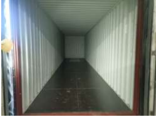
9. Container empty, dry and clean