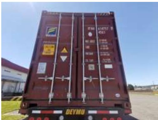
5. Outside doors of the container.