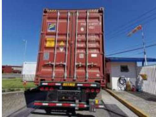
21. Final view of the container at the Time of dispatch

This survey was carried out without prejudice and in the interest of whom it may concern.