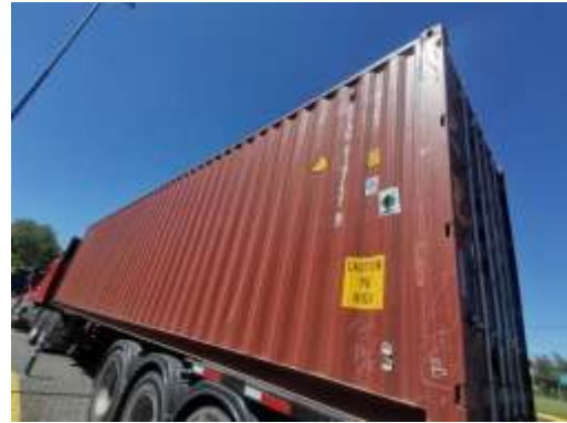
4. Left side of the container.