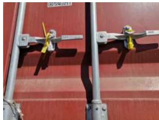
20. General view of the seals.