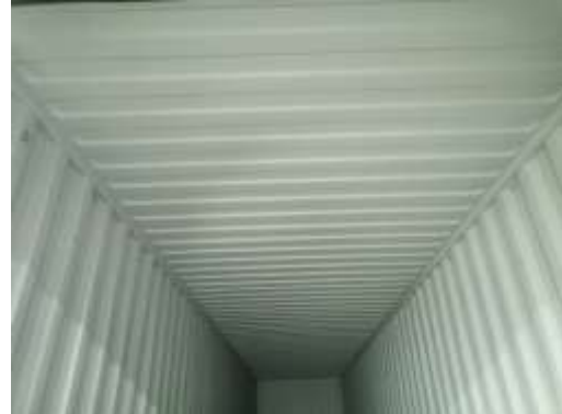
10. Container empty, dry and clean