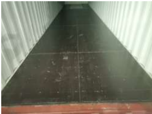
11. Empty floor of the container.