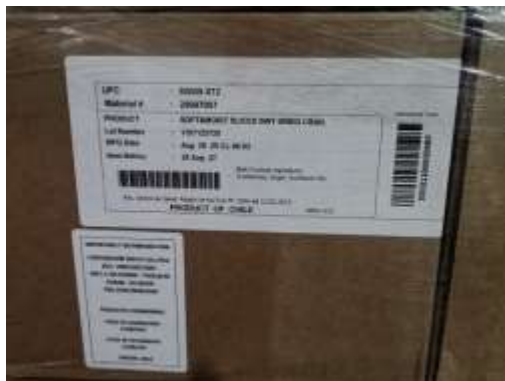
17. Boxes marks, Soft & Moist Sliced SWT Dried Cranberries. Process AUG 25 25 cl.