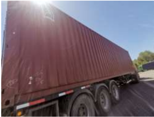
3. Right side of the container.