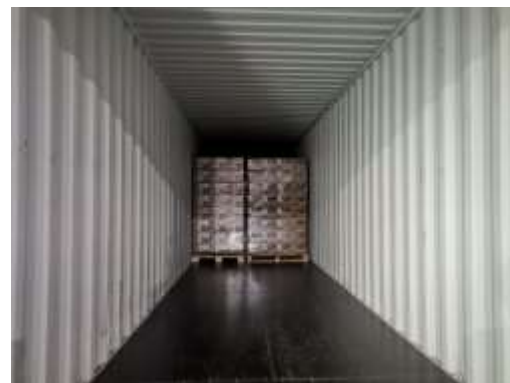
14. Stuffing Half.