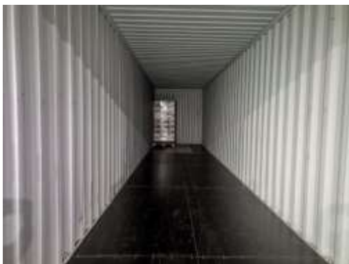
13. Stuffing commenced.