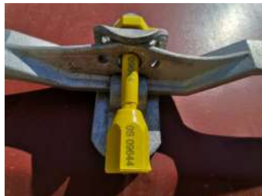
18. Ocean Spray Inc. seal: N° 09644.