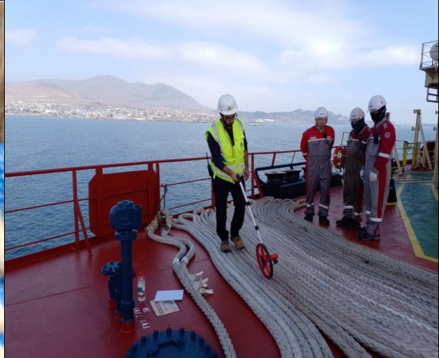
9. General view of the rope.