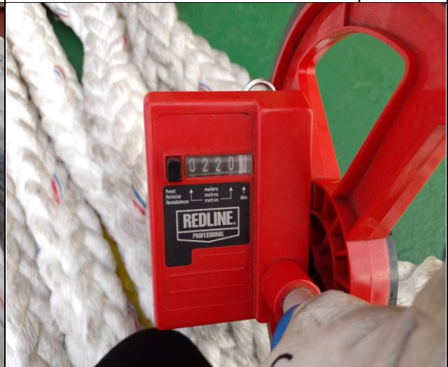
14. Length measured by surveyor.