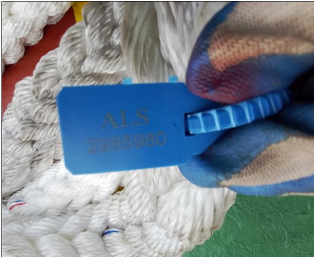
11. View of seal N° 2985980.