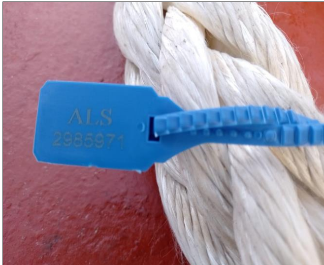
1. View of seal N° 2985971.