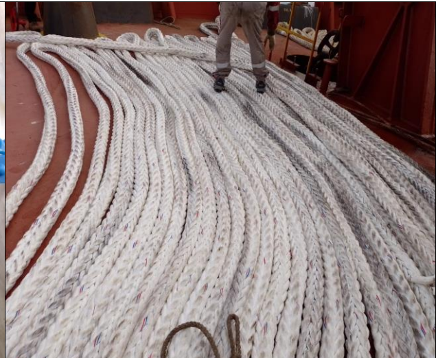
12. General view of the rope.