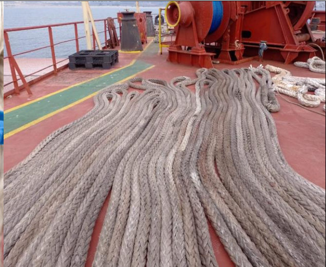
32. General view of the rope.