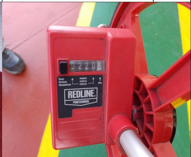
4. Length measured by surveyor.