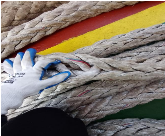
7. Internal condition of the ropes