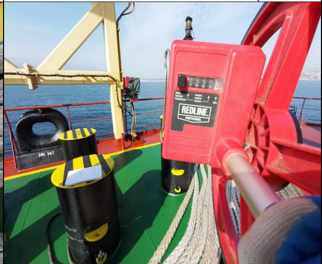
8.Length measured by surveyor.