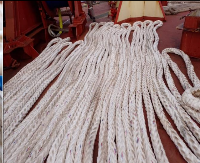
12. General view of the rope.