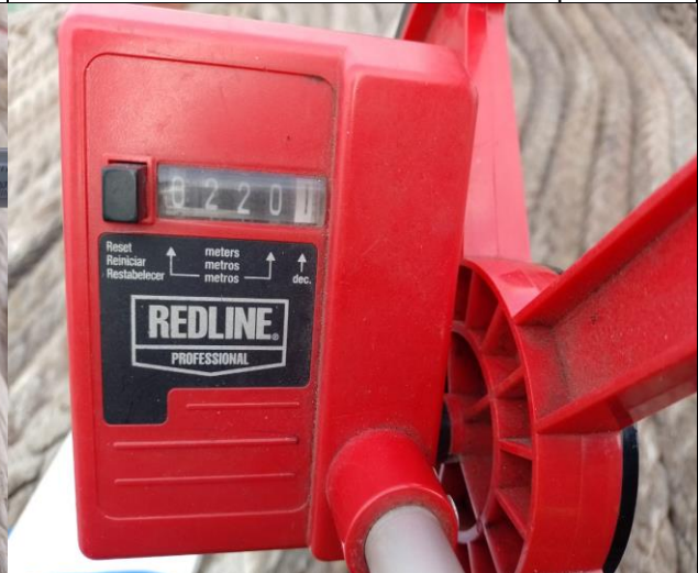
38. Length measured by surveyor.