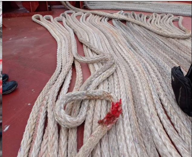
24. General view of the rope.