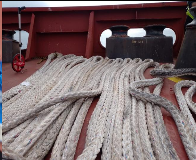
20. General view of the rope.