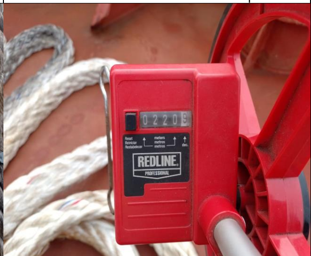
22. Length measure by surveyor.