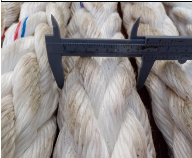
13. General diameter of the rope.