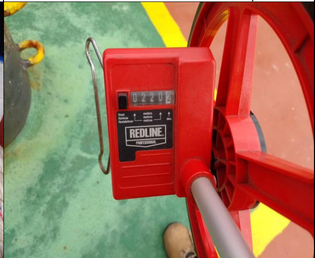
34. Length measured by surveyor.