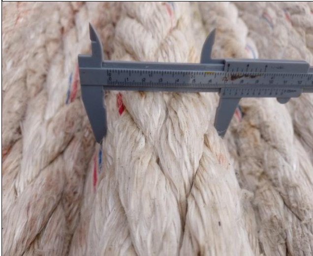
37. General diameter of the rope.