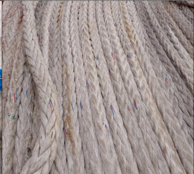
28. General view of the rope.