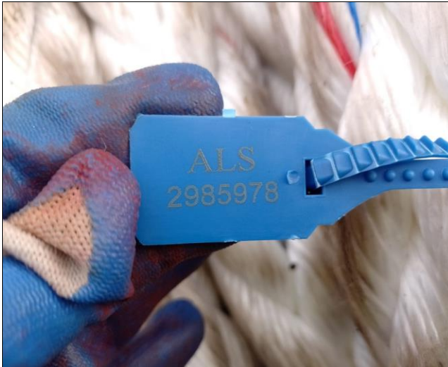
11. View of seal N° 2985978.