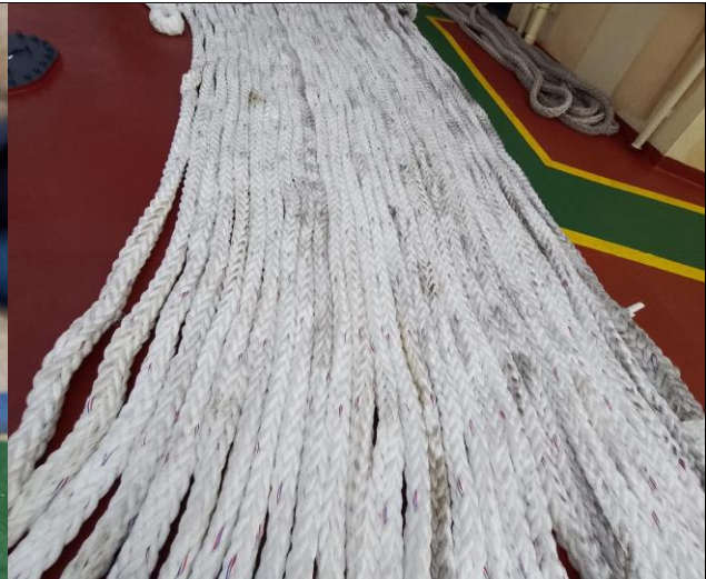
12. General view of the rope.