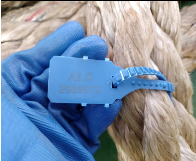
5. View of seal N° 2985972.