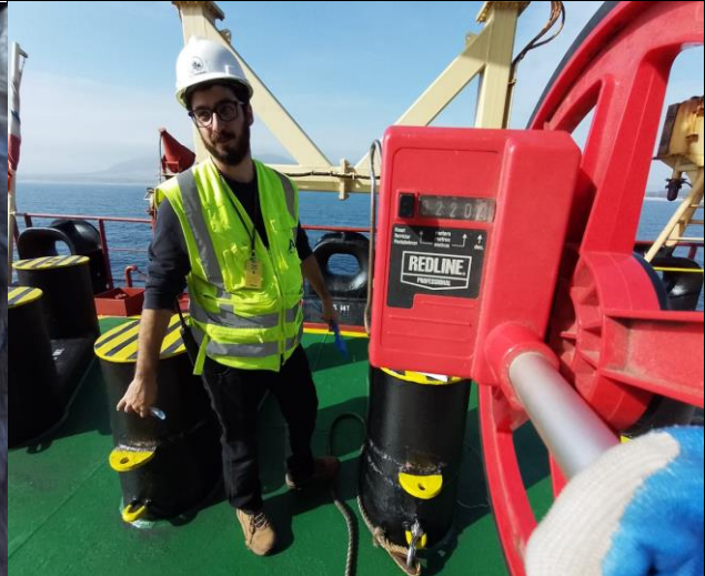
10. Length measured by surveyor.