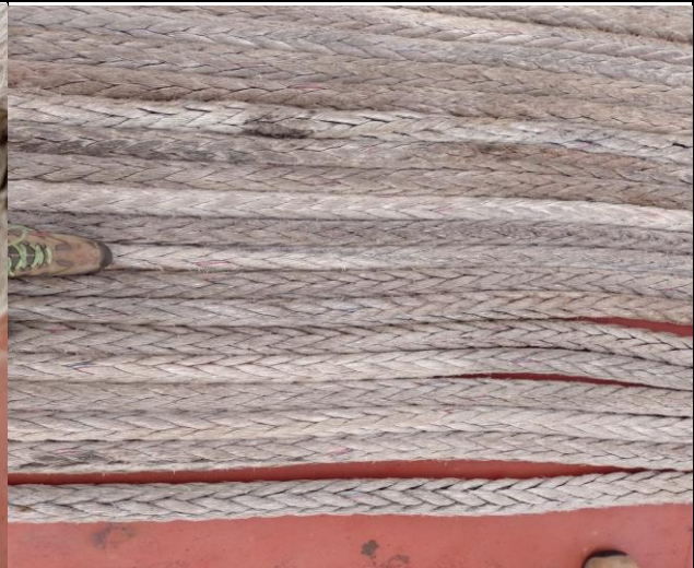
36. General view of the rope.