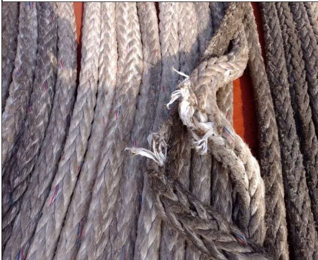
17. Internal condition of the ropes.