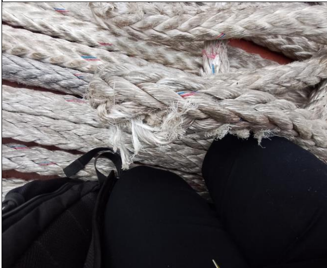
13. Internal condition of the ropes.