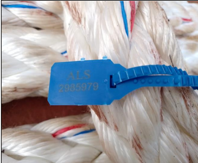
11. View of seal N° 2985979.