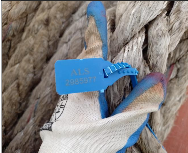
35. View of seal N° 2985977.