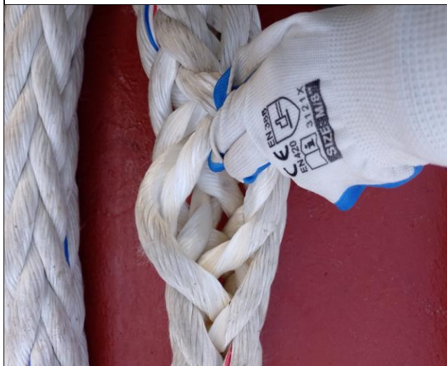
3. Internal condition of the ropes.