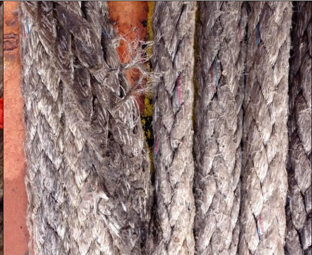
16. General view of the rope.