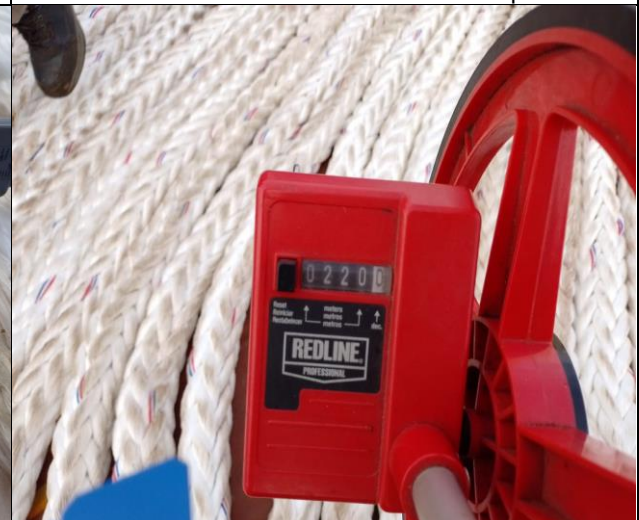
14. Length measured by surveyor.