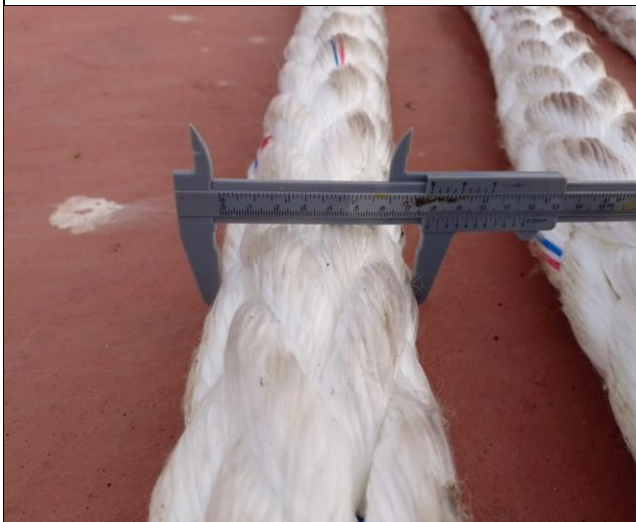
13. General diameter of the rope.