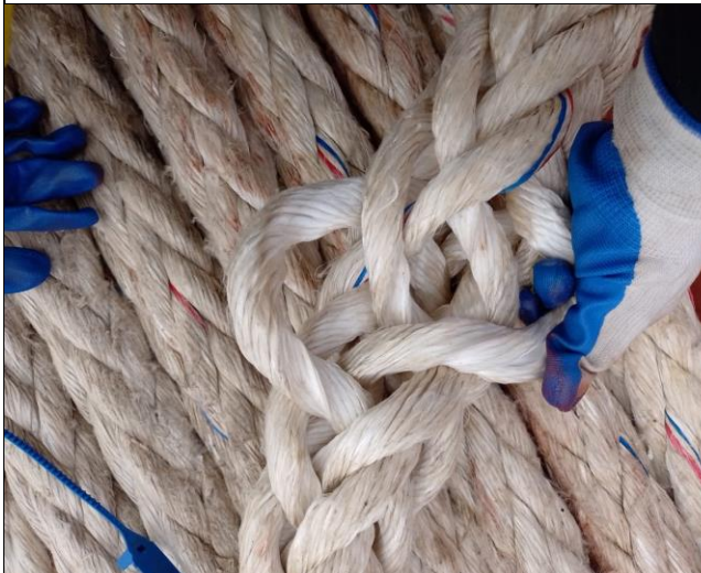
33. Internal condition of the ropes.