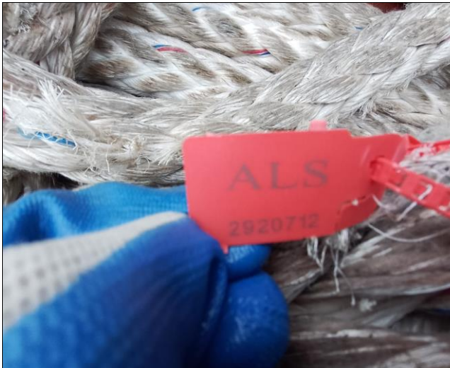
23. View of seal N° 2920712.