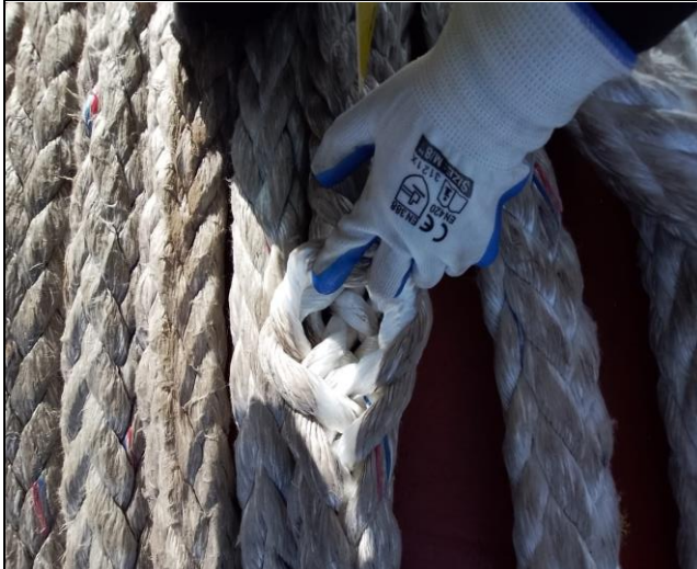
9. Internal condition of the ropes