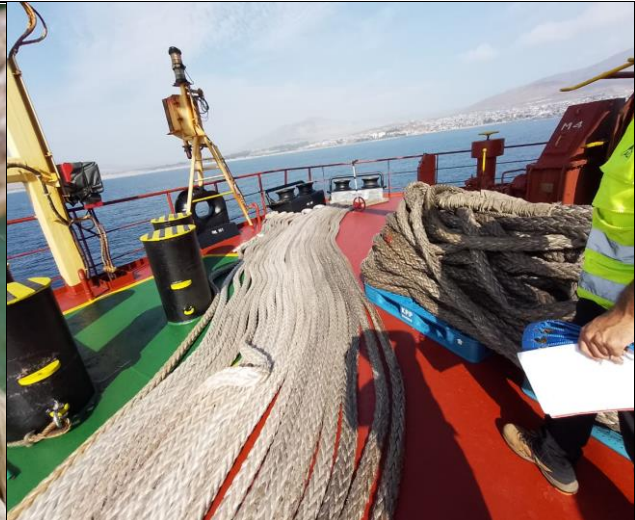
6. General view of the rope.