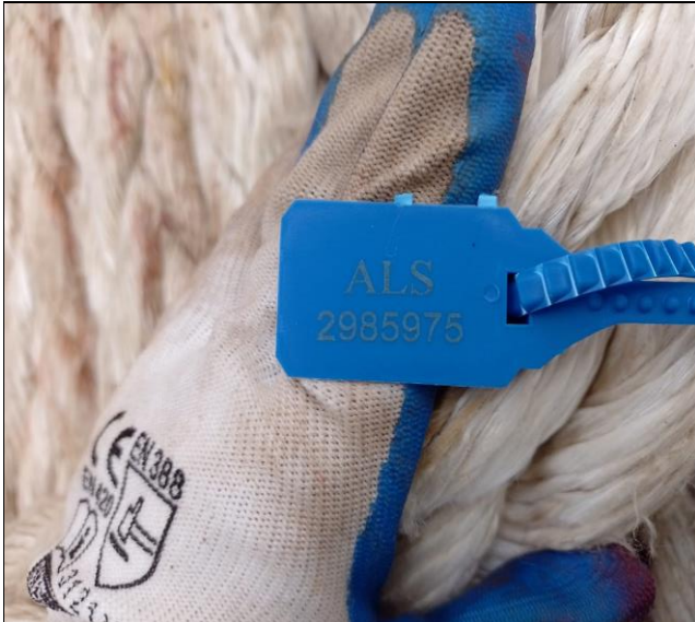
27. View of seal N° 2985975.