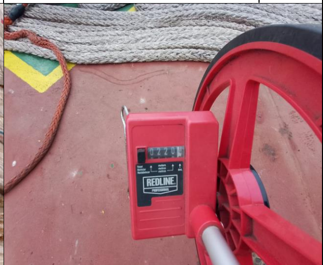
26. Length measure by surveyor.