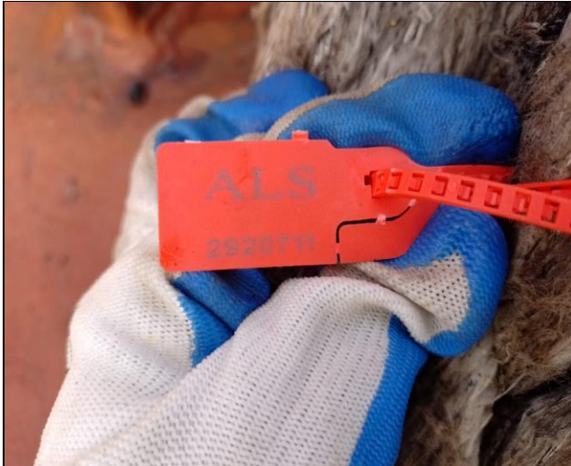
15. View of seal N° 2920711.