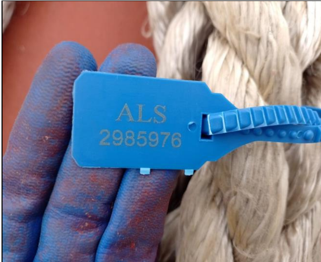
31. View of seal N° 2985976.