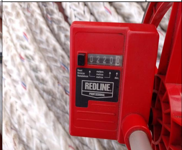
14. Length measured by surveyor.