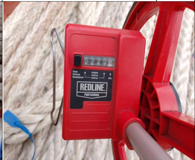
30. Length measured by surveyor.