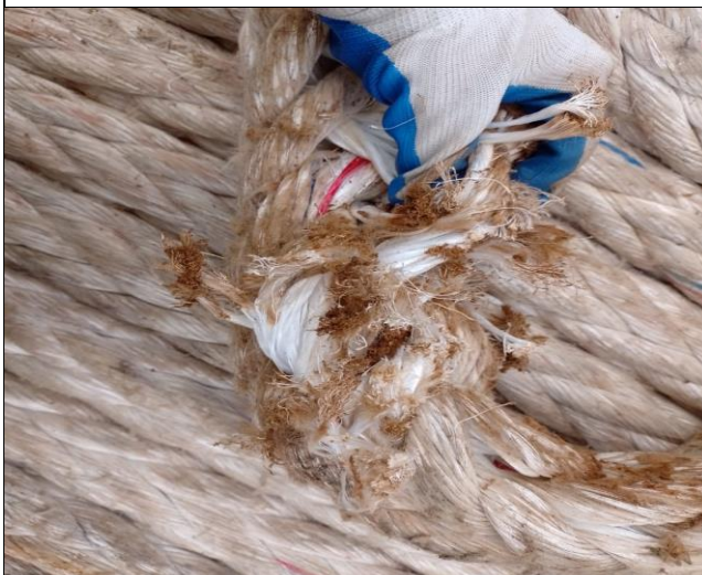
25. Internal condition of the ropes