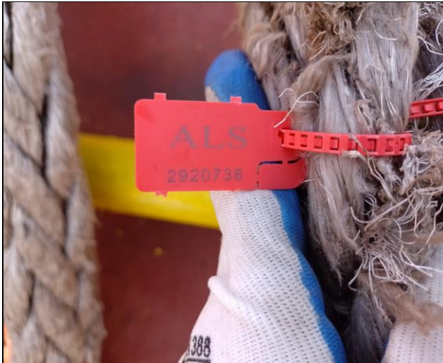
11. View of seal N° 2920738.