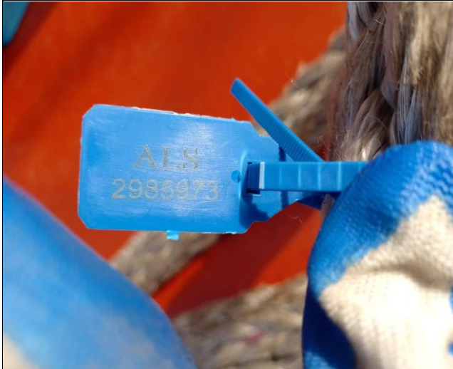
8. View of seal N°2985973.