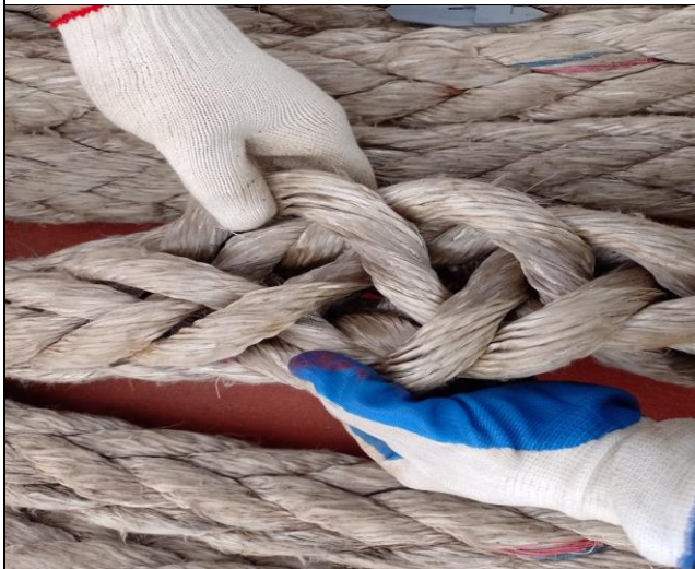
29. Internal condition of the ropes.