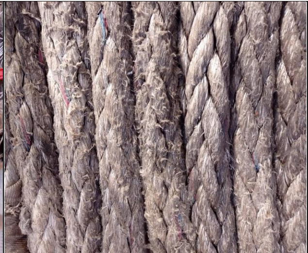
12. General view of the rope.