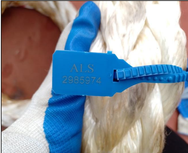
19. View of seal N a 2985974.