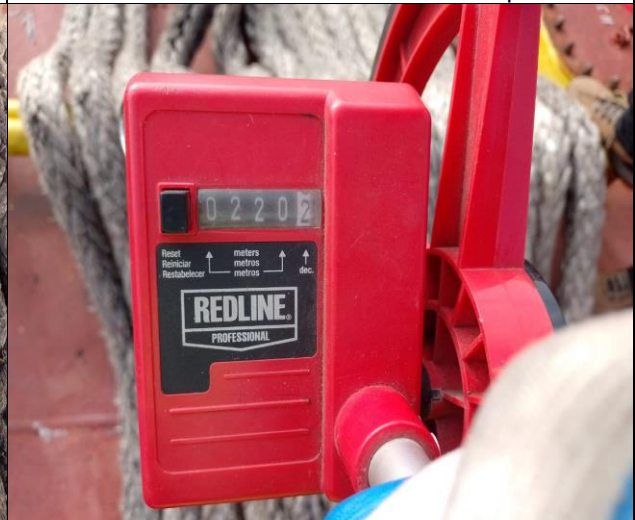
18. Length measured by surveyor