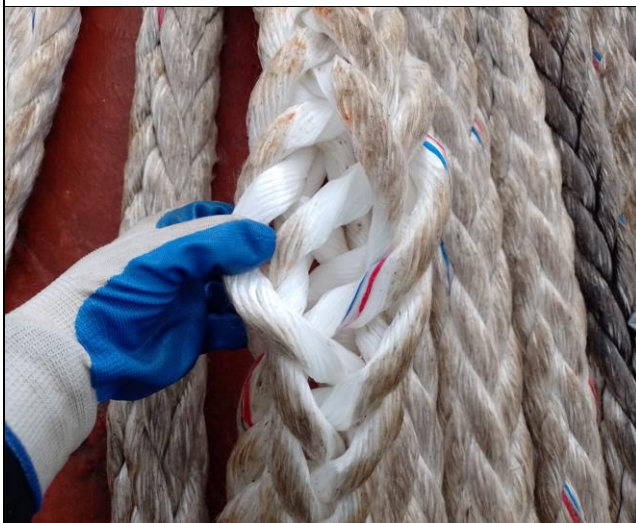
21. Internal condition of the ropes.