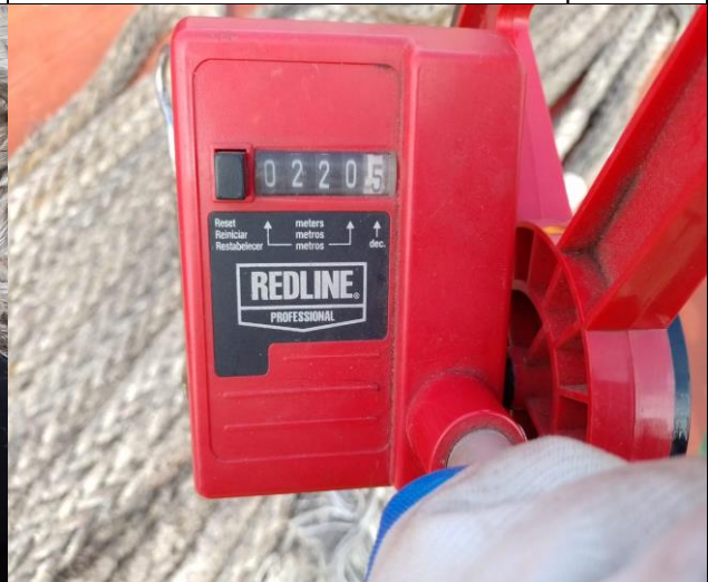
14. Length measured by surveyor.