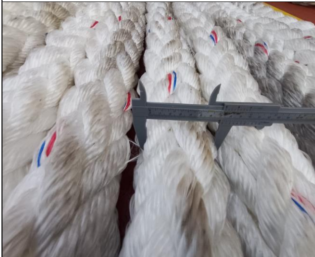
13. General diameter of the rope.