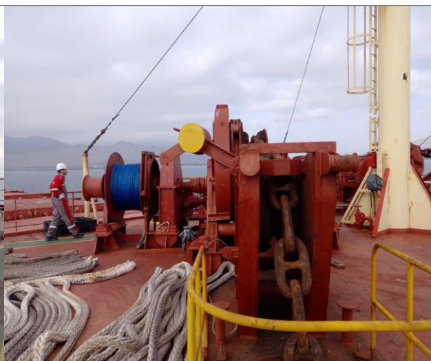
14. View of Ps. Fwd winch.