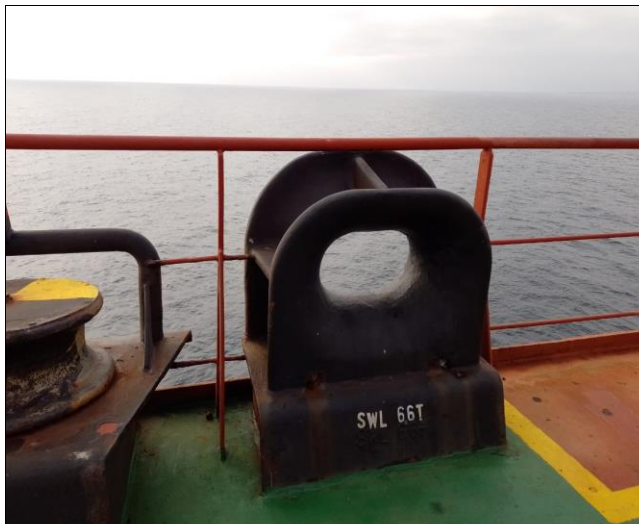
41.View of Fwd chock.