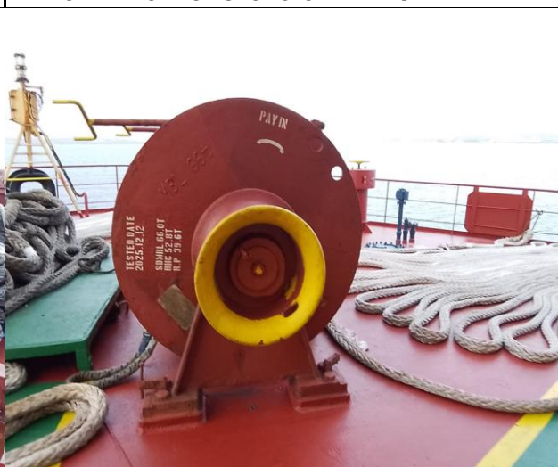
8. View of warping drum.