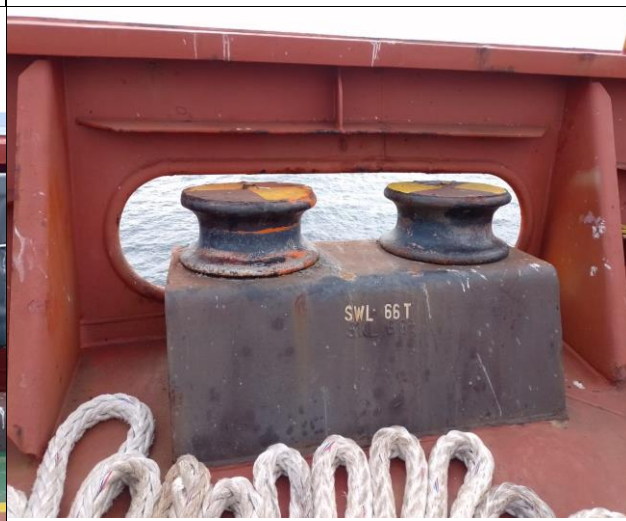
40. View of Stb center Fwd rollers.