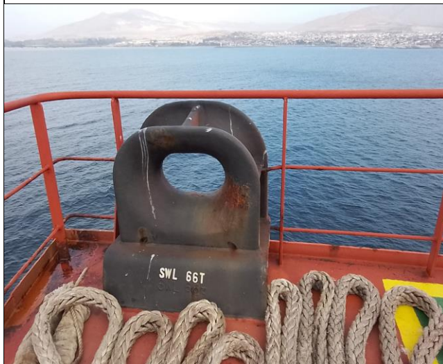
43.View of Fwd chock.