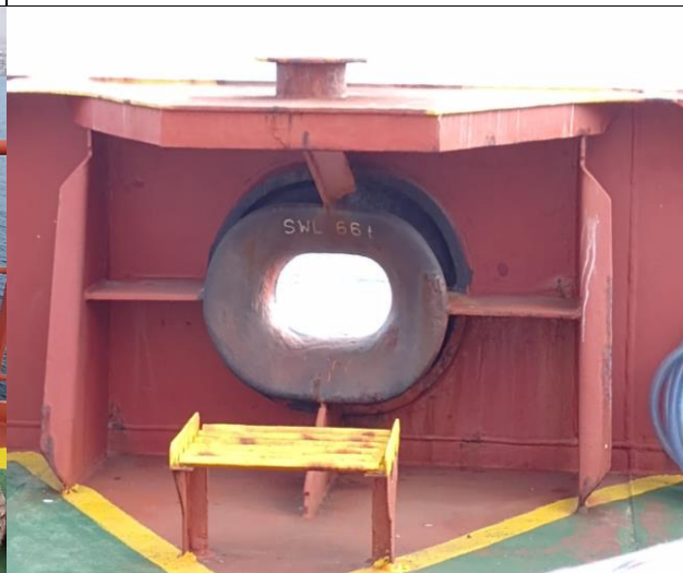
44.View of Fwd chock.