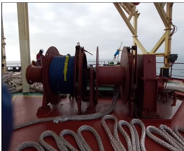
5. View of Stb. stern winch.