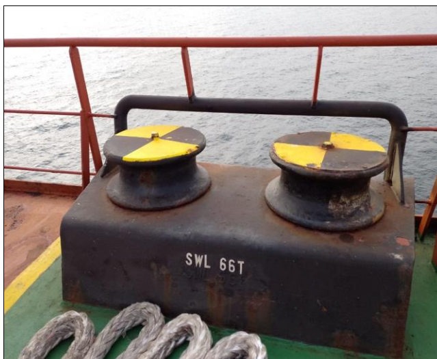
29. View of Spring Btw 1-2 rollers.