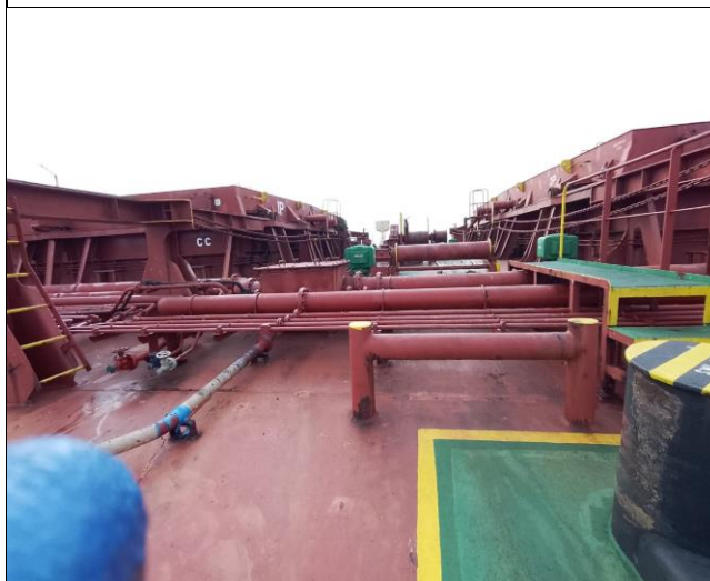
35. View of spring Btw 1-3 Pedestal Roller Guide.