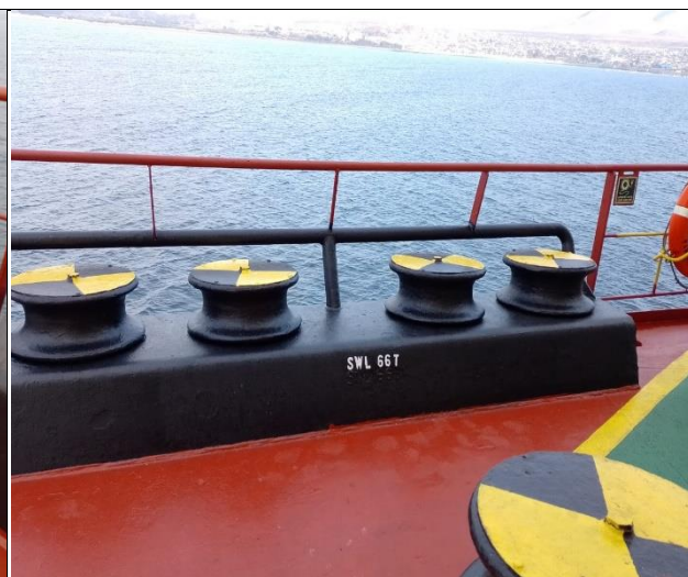
22. View of Stb. Stern rollers.