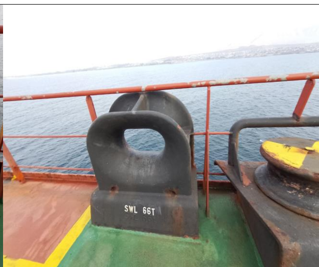
30. View of Spring Btw 1-2 rollers.