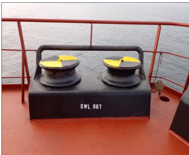
21. View of Ps. Stern rollers.