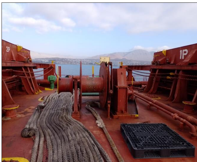
9. View of spring Aft. winch BTW H1-H2.