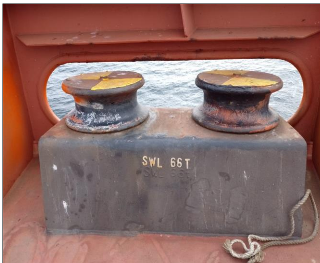
37. View of Ps. Fwd rollers.