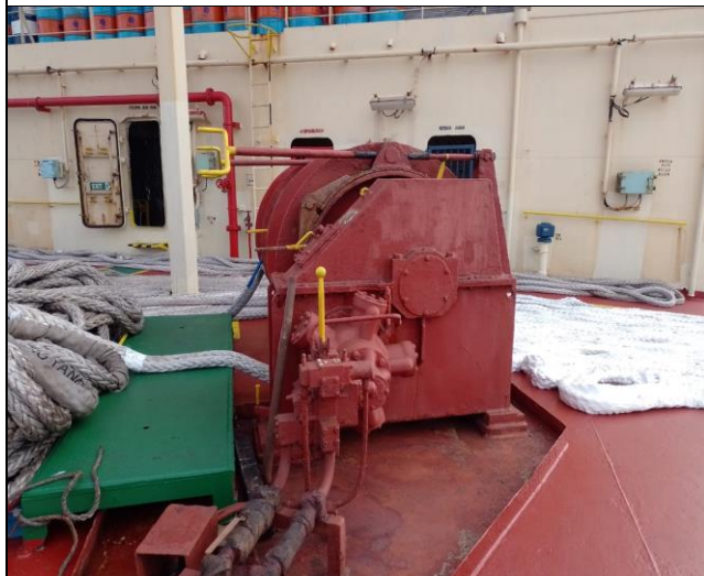
3. Additional view of Ps. stern winch.