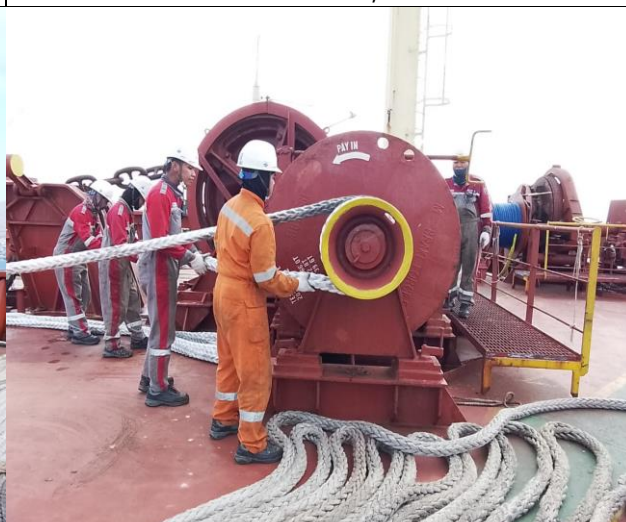
20. View of warping drum.