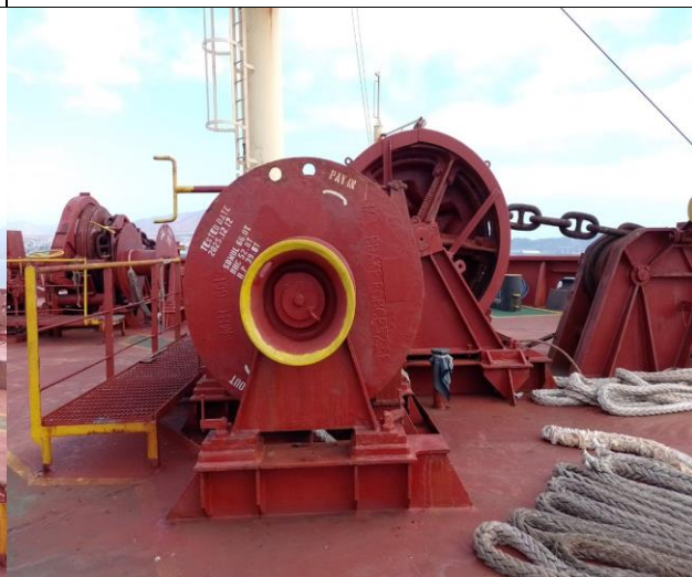
16. View of warping drum.