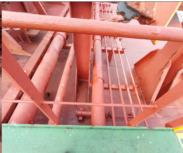
34. View of spring Btw 1-3 Pedestal Roller Guide.