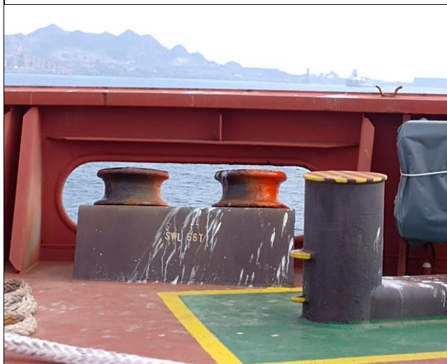
39. View of Ps center Fwd rollers