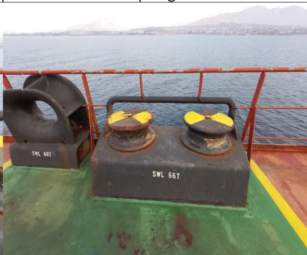
32. Additional view of Spring Btw 6-7 rollers.