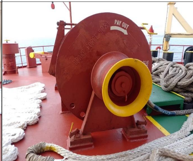
4. View of warping drum/head on Ps. stern winch