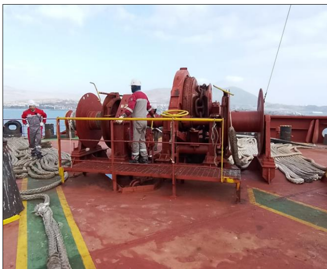
17. View of Stb. Fwd winch.