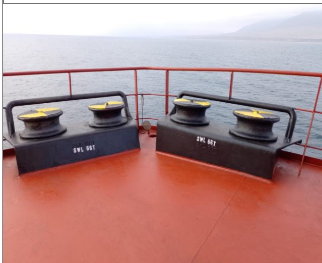
23. View of Ps center Stern rollers.