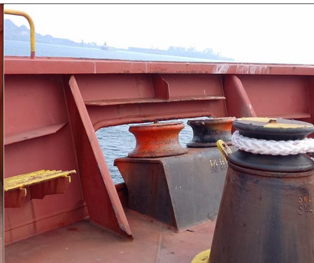
38. View of Stb. Fwd rollers.