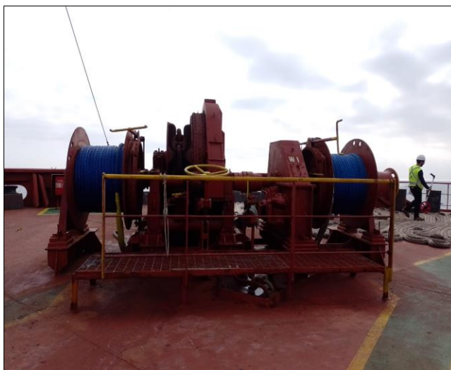
13. View of Ps. Fwd winch.