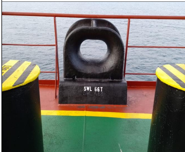
27.View of Stern chock.