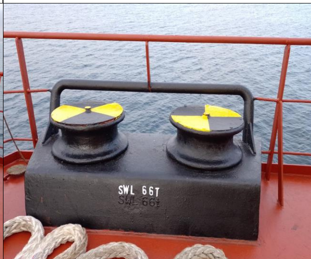
24. View of Stb center Stern rollers.