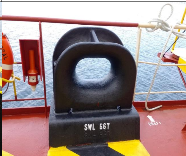
28.Additional view of Stern chock,