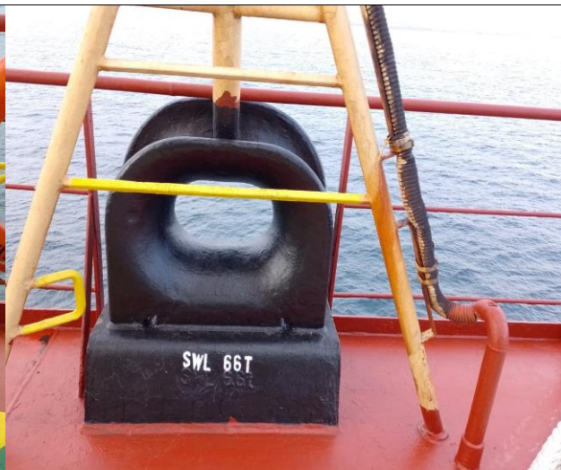
26.Additional view of Stern chock.