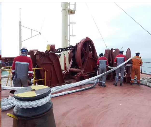
18. View of Stb, Fwd winch.