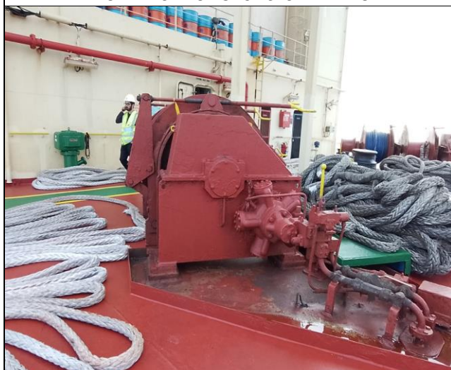
7. Additional view of Stb. stern winch.