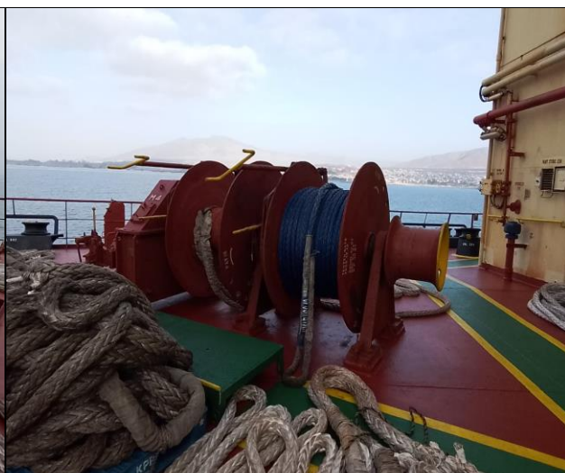
6. View of Stb. stern winch.