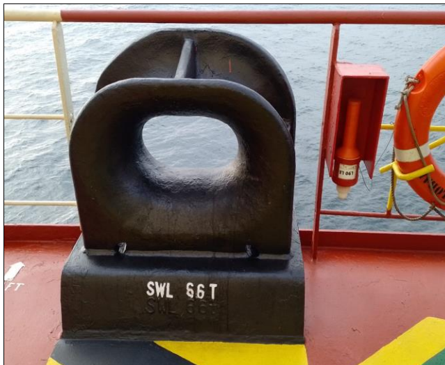
25.View of Stern chock.