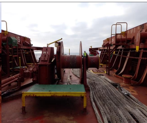
10. View of spring Aft. winch BTW H1-H2.