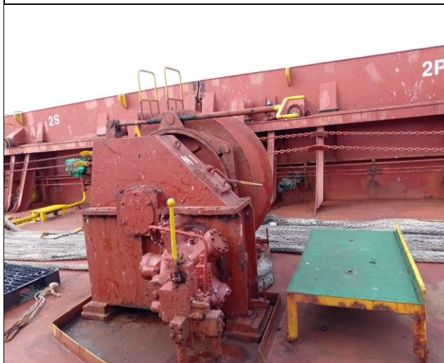
11. Additional view of spring Aft. winch BTW H1-H2.