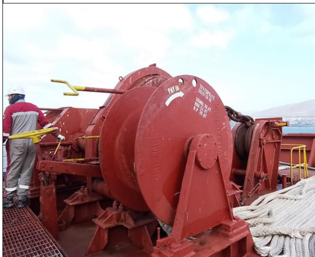
19. Additional view of Stb. Fwd winch