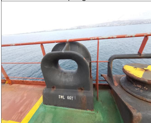
31. Additional view of Spring Btw 6-7 rollers.