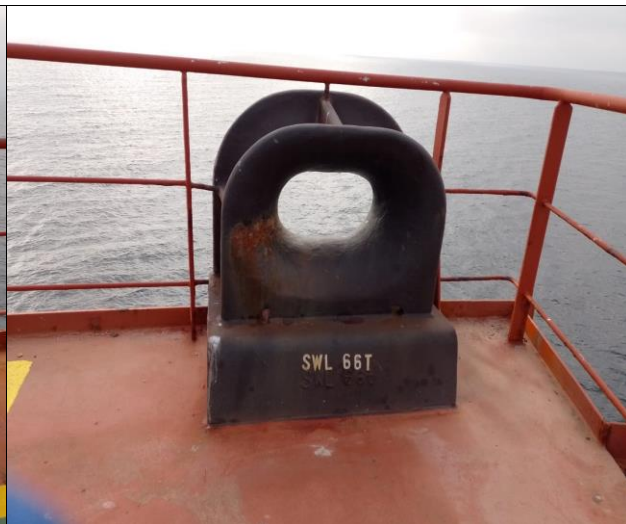
42.View of Fwd chock.