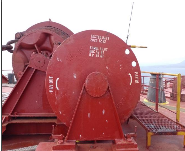
15. Additional view of Ps. Fwd winch