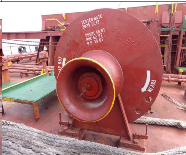
12. View of warping drum.