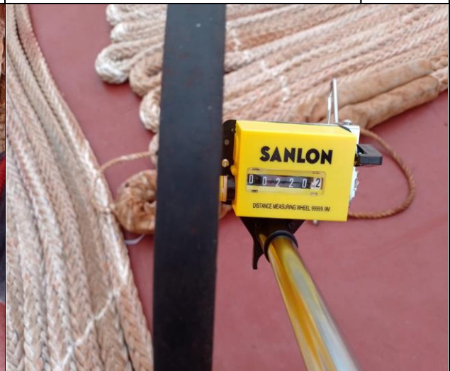
11. Length measured by surveyor.