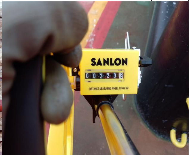
52. Length measured by surveyor.