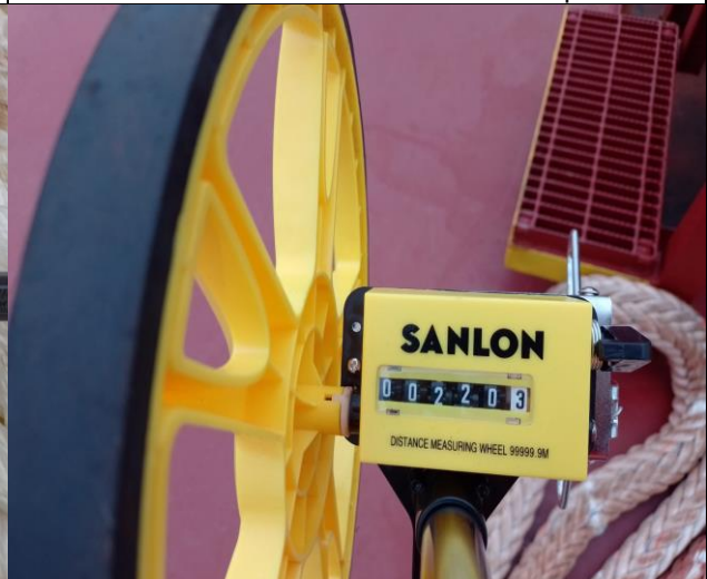
23. Length measure by surveyor.