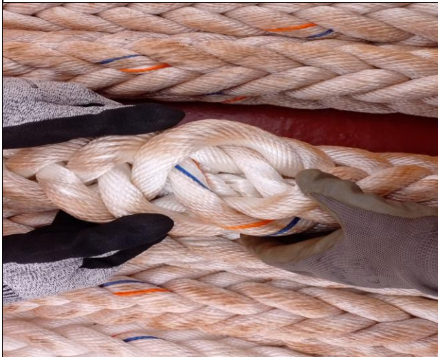
18. Internal view of ropes.