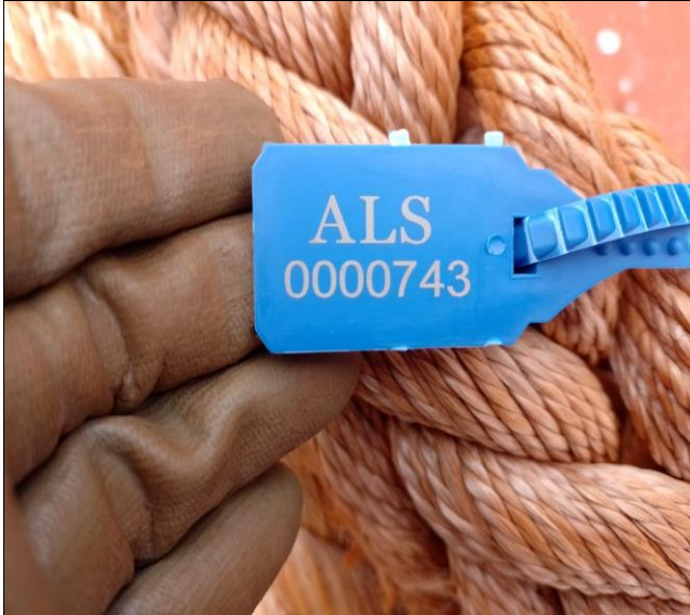
28. View of seal N° 0000743.