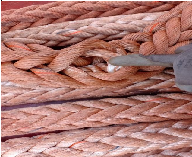
34. Internal view of ropes.