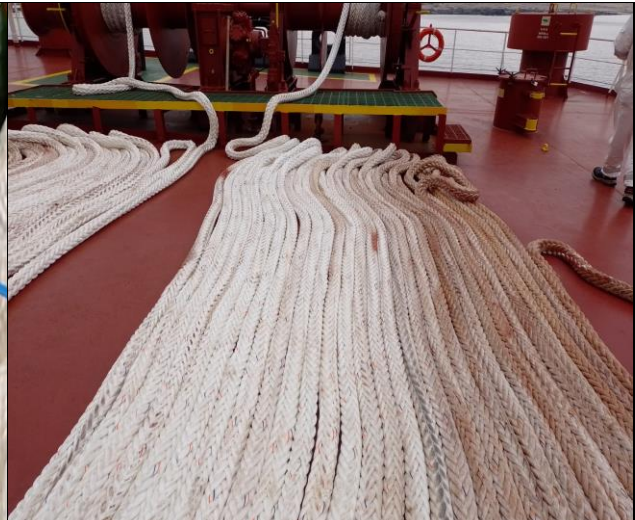
5. General view of the rope.