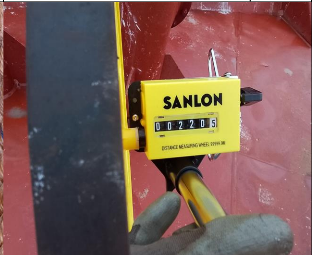
56. Length measured by surveyor.