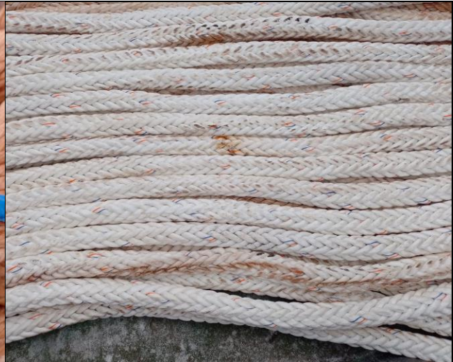
41. General view of the rope.