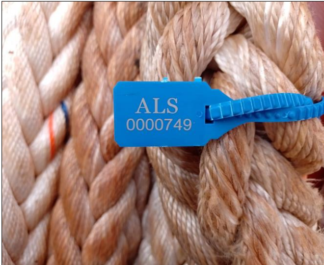
53. View of seal N° 0000749.