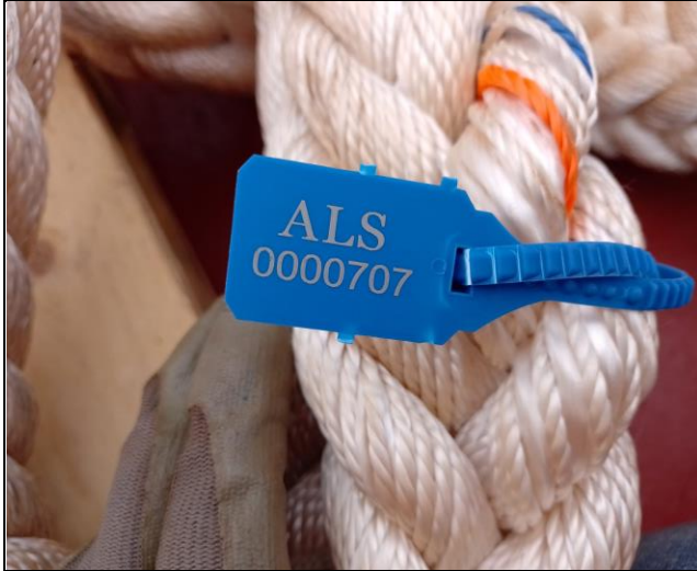
57. View of seal N° 0000707.