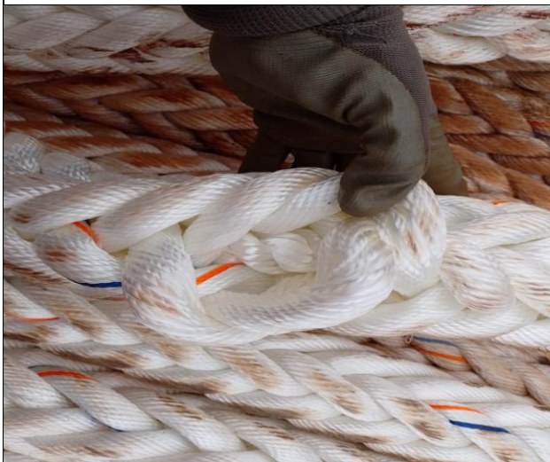
43. Internal view of ropes.