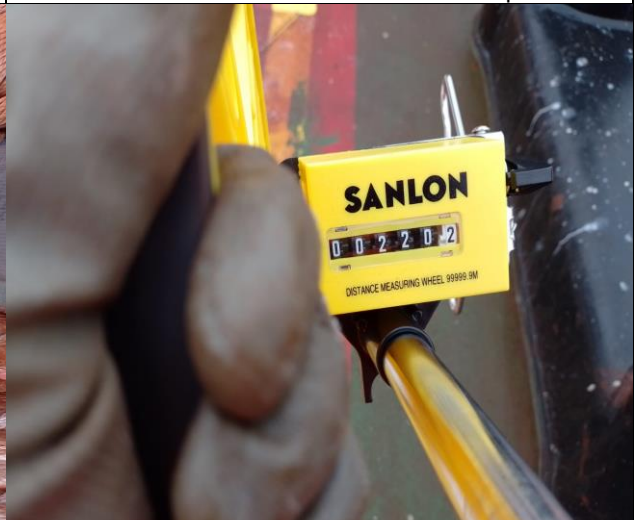
35. Length measured by surveyor.