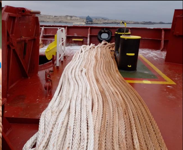
37. General view of the rope.