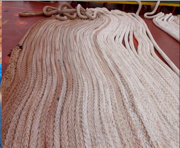
2. General view of the rope.