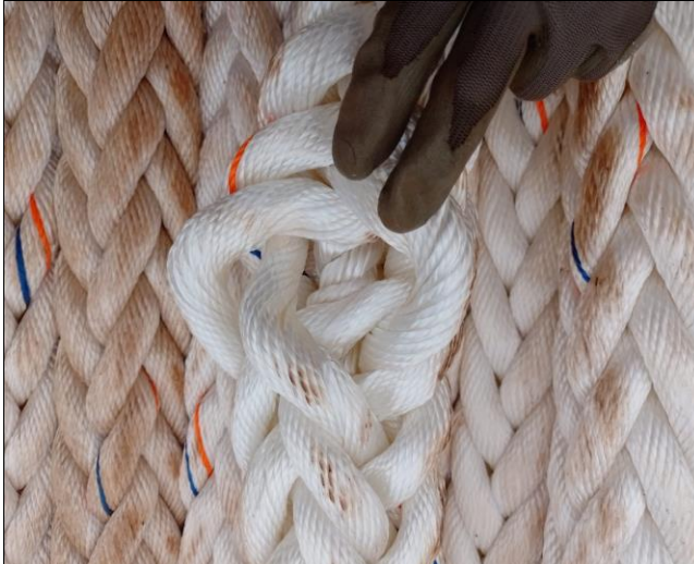
38. Internal view of ropes.