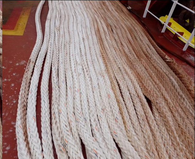
50. General view of the rope.