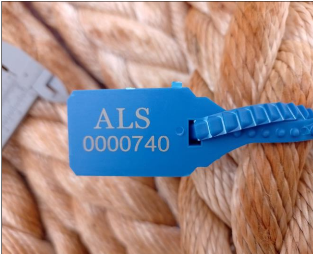
16. View of seal N° 0000740.