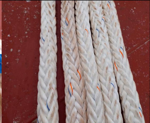
58. General view of the rope.