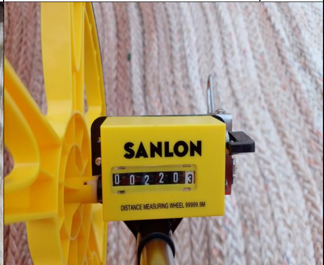
7. Length measured by surveyor.