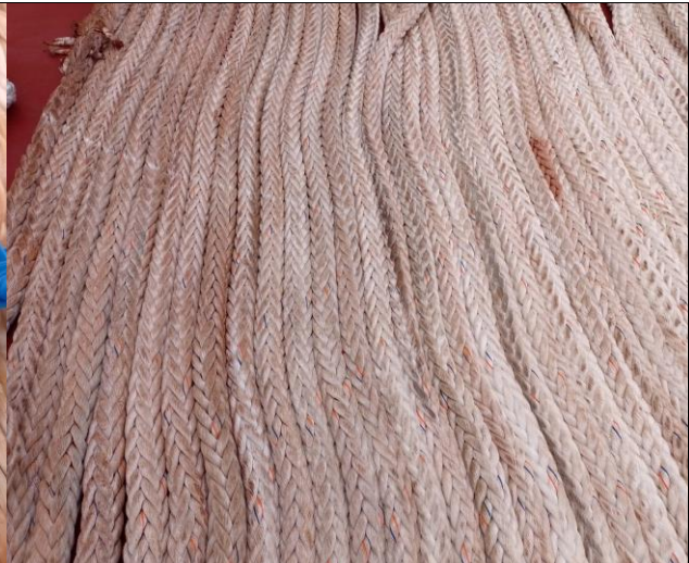
17. General view of the rope.