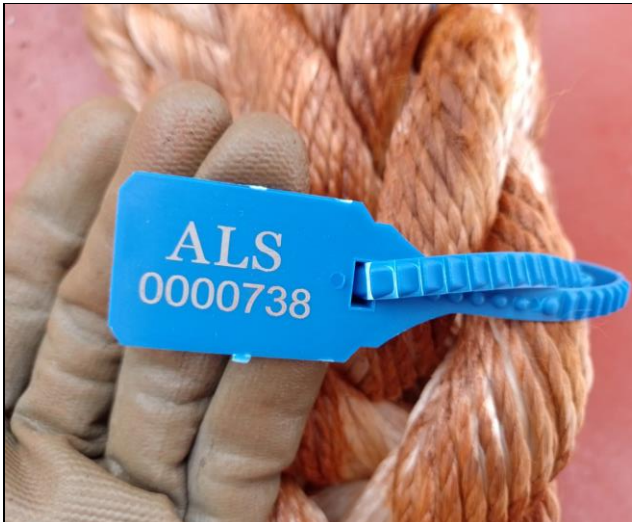
8. View of seal N° 0000738.