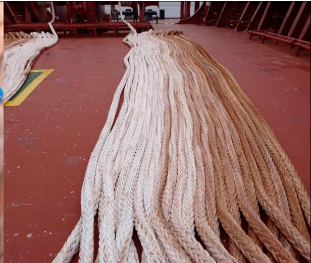
25. General view of the rope.