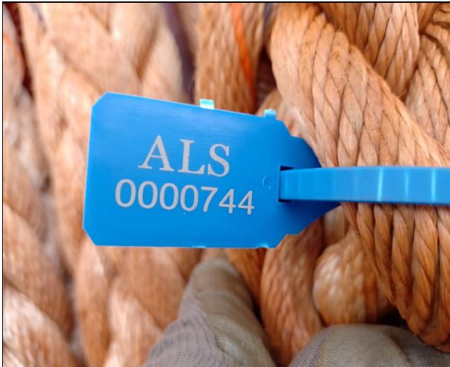
32. View of seal N° 0000744.