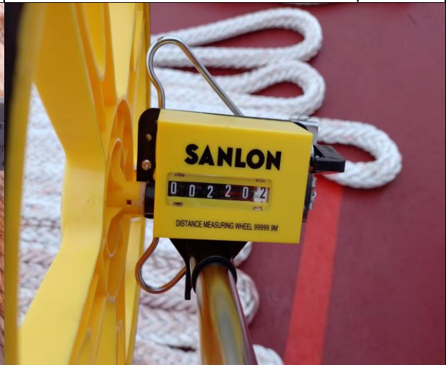
4. Length measured by surveyor.