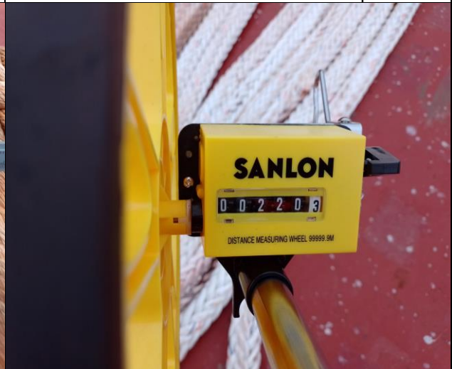
31. Length measured by surveyor.