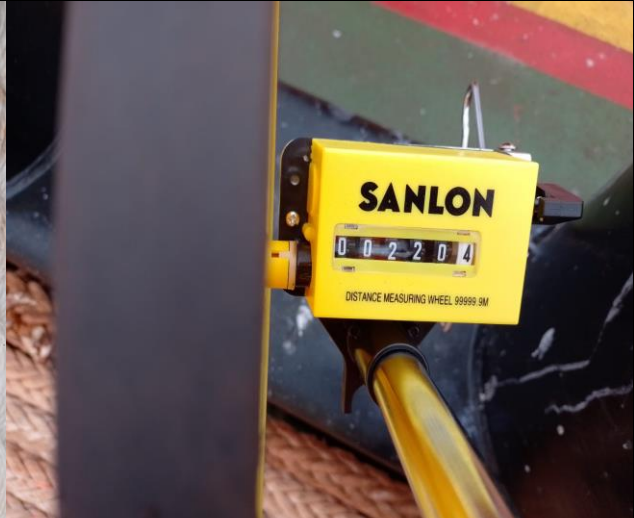
39. Length measured by surveyor.