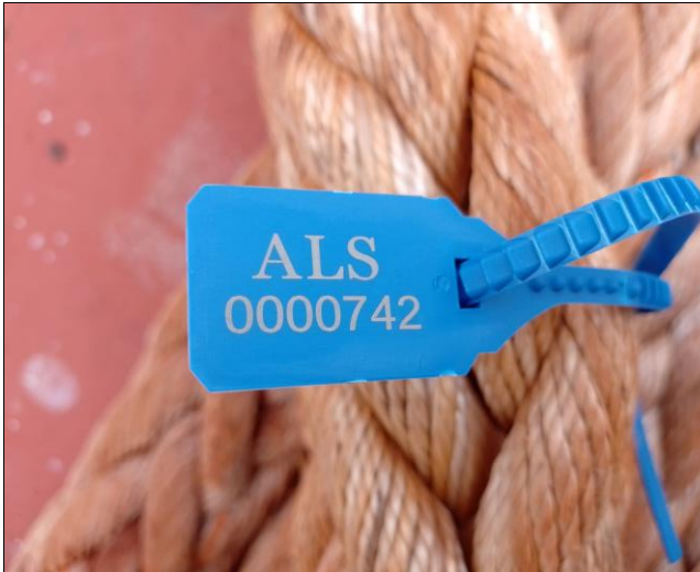
24. View of seal N° 0000742.