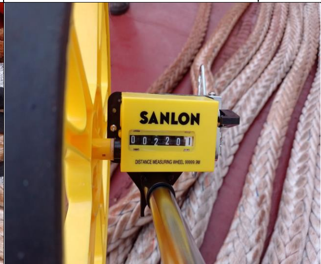
15. Length measured by surveyor.