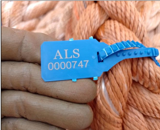
45. View of seal N° 0000747.