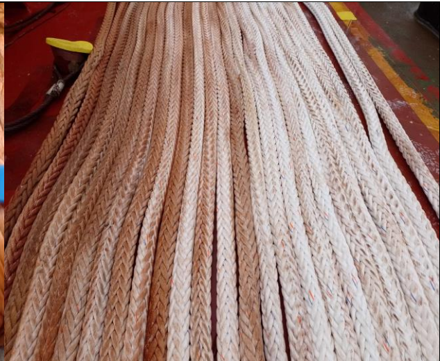
33. General view of the rope.