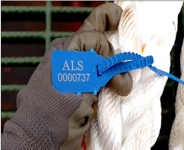
4. View of seal N° 0000737.