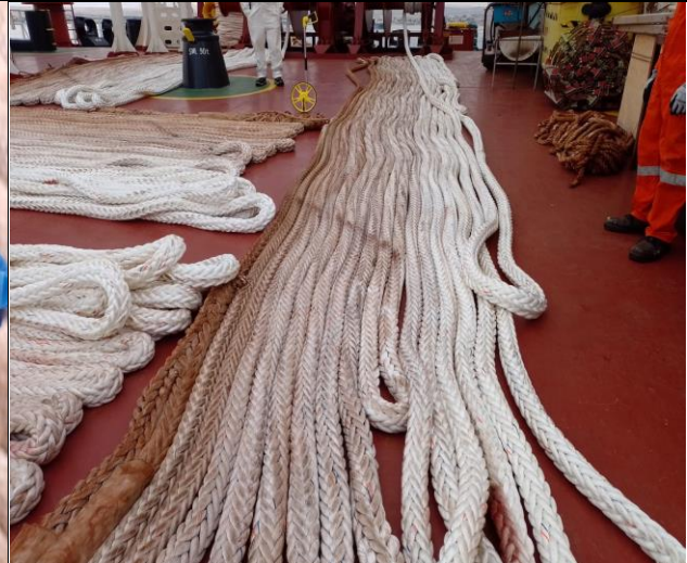
13. General view of the rope.