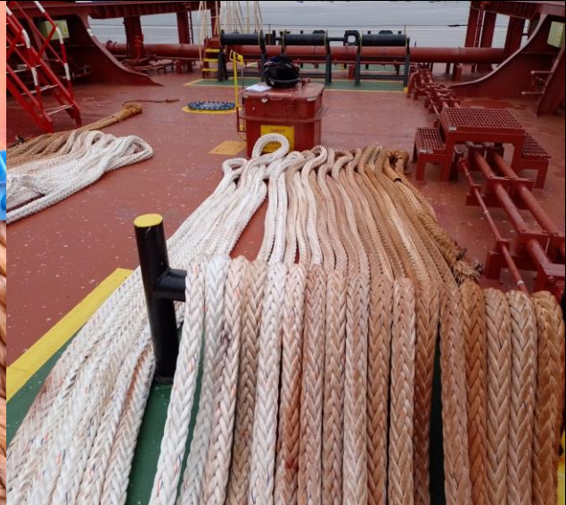
29. General view of the rope.