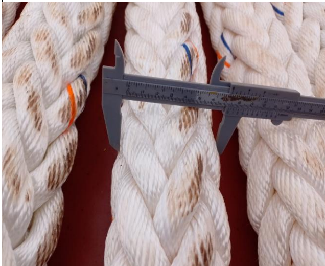
26. Diameter of the mooring line.