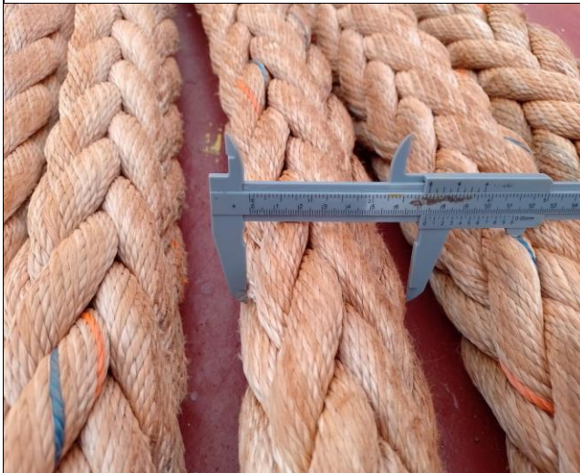
30. Diameter of the mooring line.