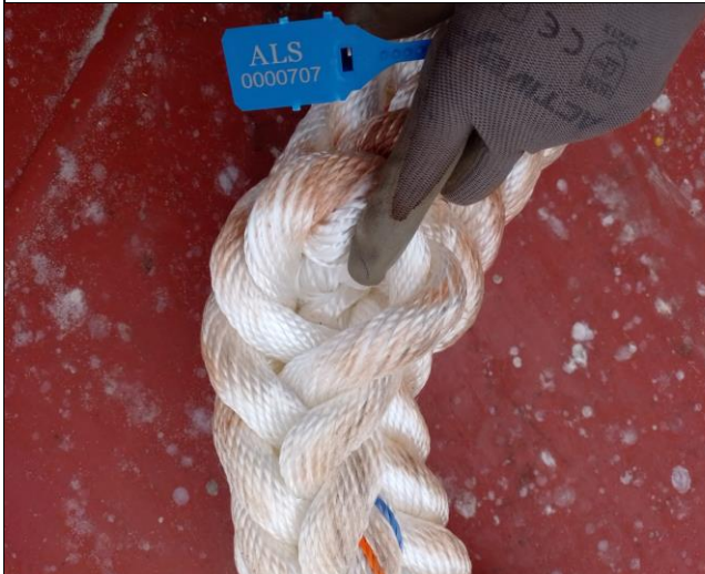
59. Internal view of ropes.