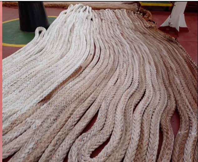
9. General view of the rope.