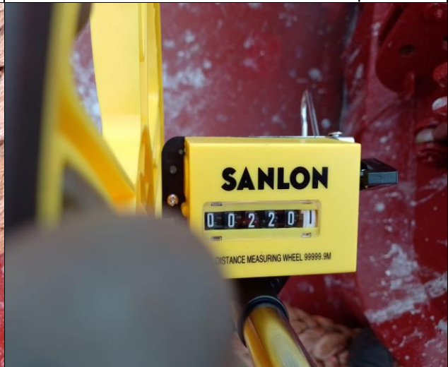
48. Length measured by surveyor.