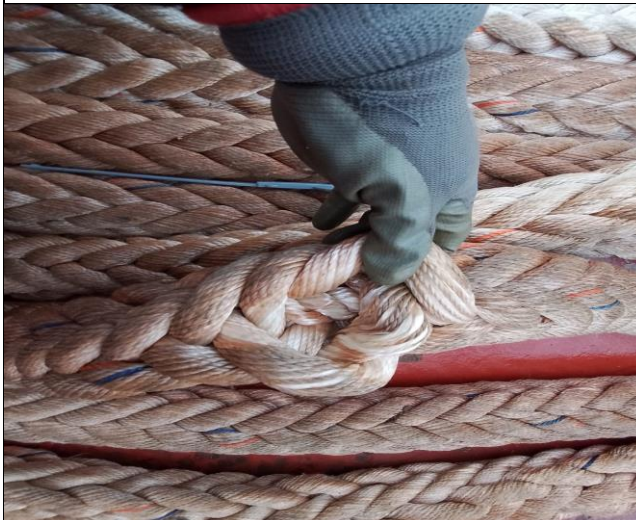
51. Internal view of ropes.