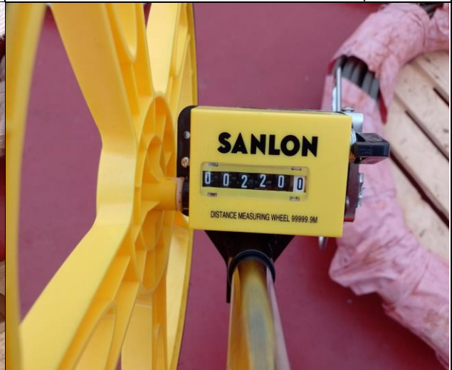
60. Length measured by surveyor.