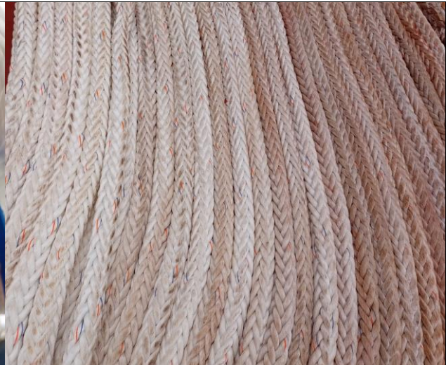
21. General view of the rope.