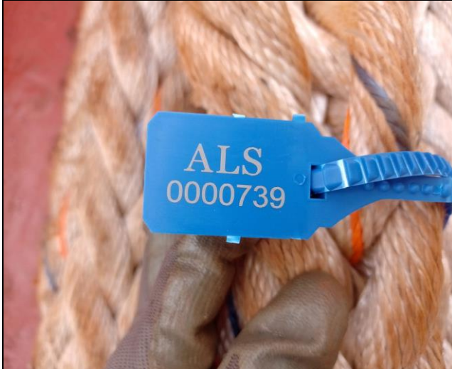
12. View of seal N° 0000739.