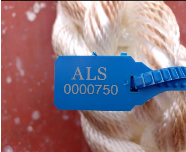
57. View of seal N° 0000750.