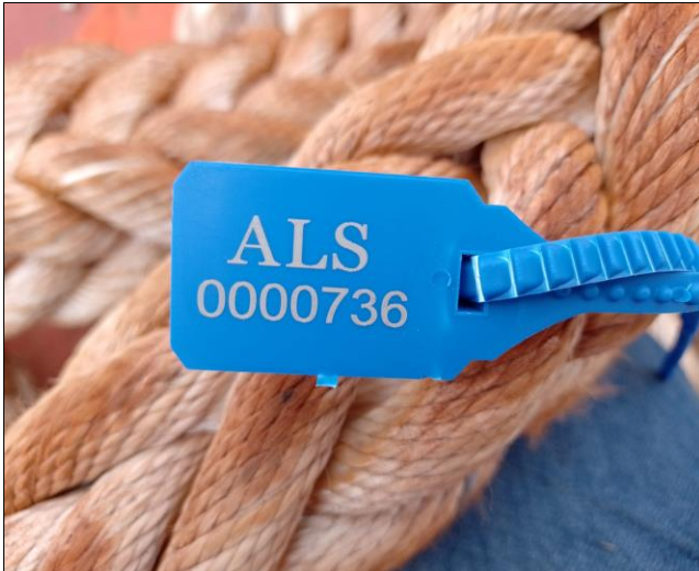
1. View of seal N° 0000736.