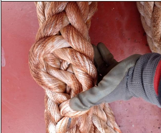
10. Internal view of ropes.