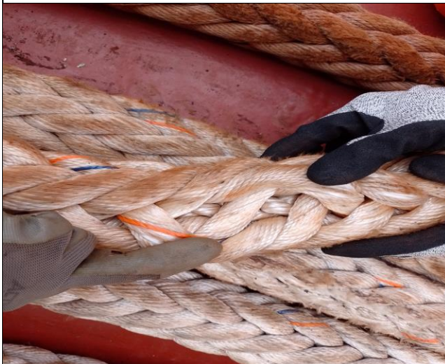
14. Internal view of ropes.