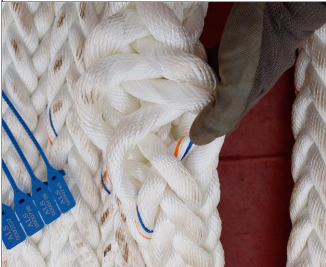
6. Internal view of ropes.