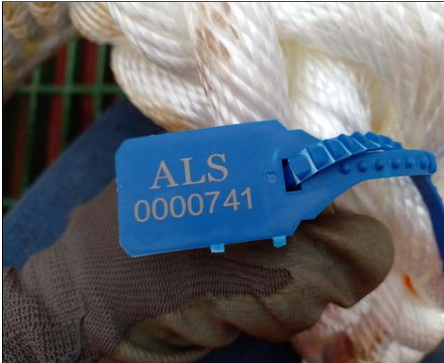
20. View of seal N a 0000741.