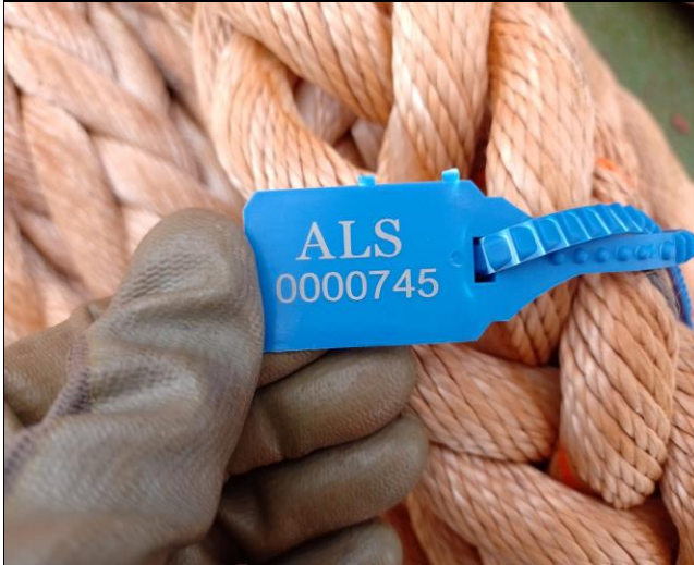
36. View of seal N° 0000745.