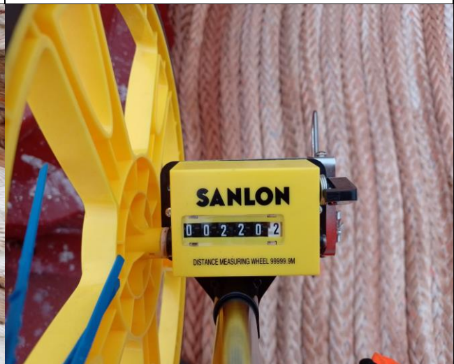
44. Length measured by surveyor.