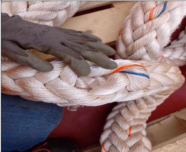
59. Internal view of ropes.