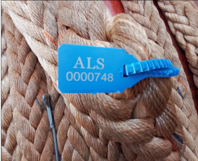
49. View of seal N° 0000748.