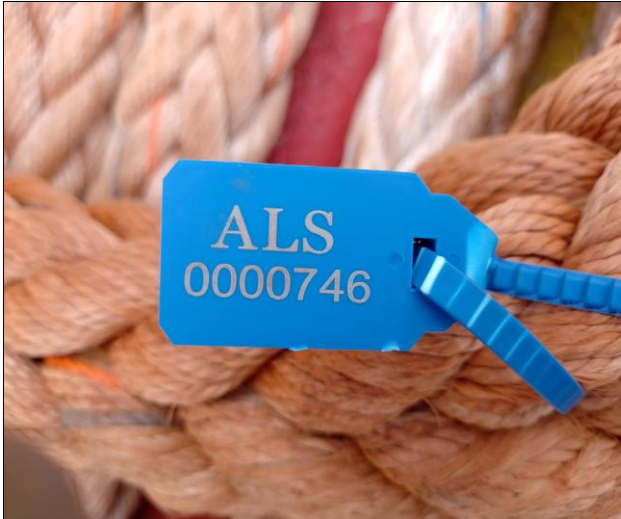
40. View of seal N° 0000746.