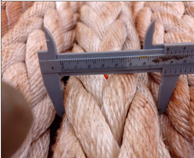
3. Diameter of the mooring rope.