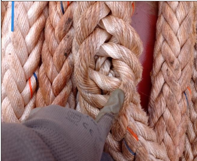
55. Internal view of ropes.