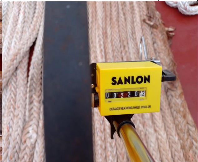
19. Length measured by surveyor