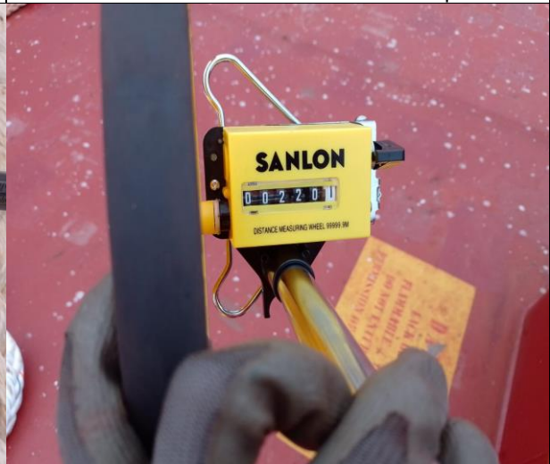
27. Length measure by surveyor.