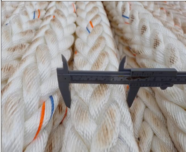
22. Diameter of the mooring rope.