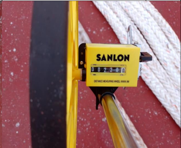
60. Length measured by surveyor.