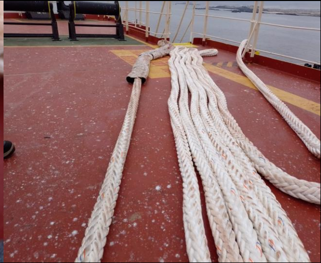
58. General view of the rope.