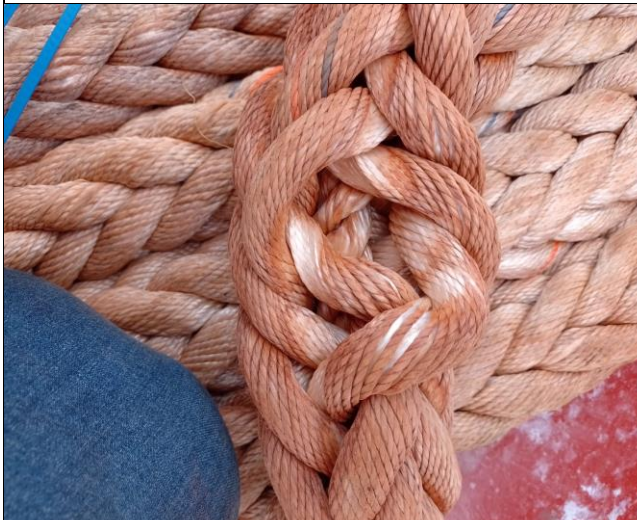
47. Internal view of ropes.