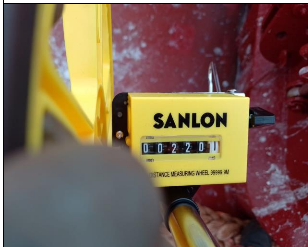
11. View of length measurement of mooring lines.