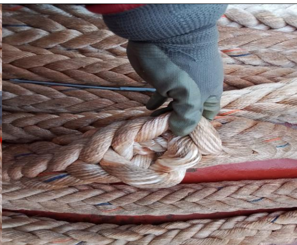
10- Internal condition.