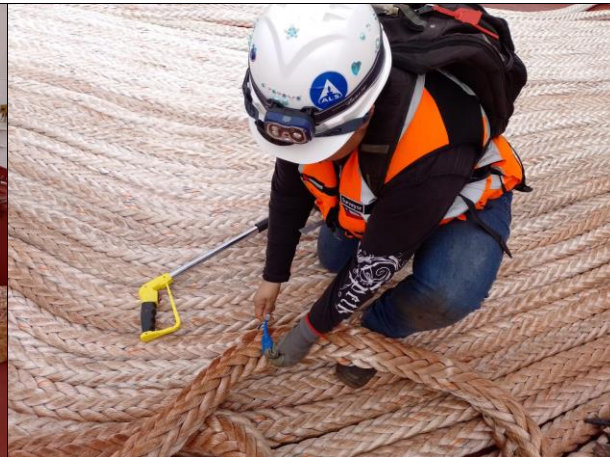
6. ALS inspector put of seal to the mooring lines.