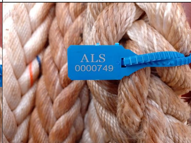
8. Another view of mooring lines with ALS SEAL. Nr- 0000749.