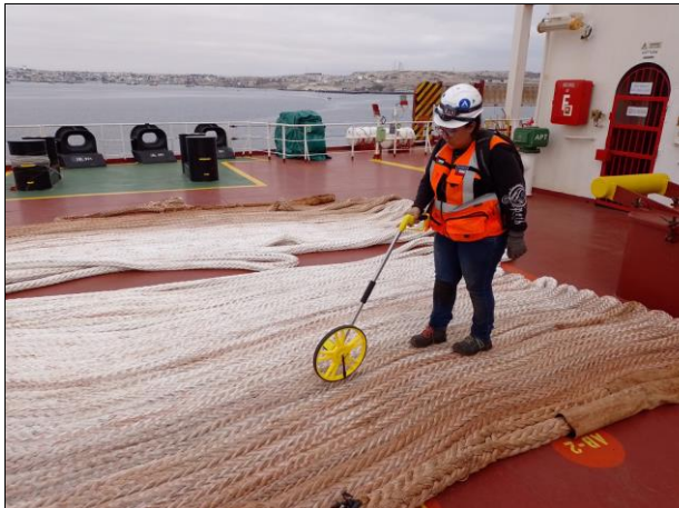
5. View of length measurement of the mooring lines.