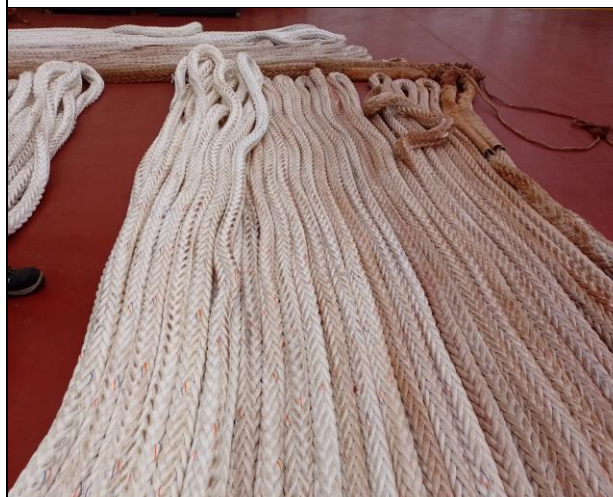
3. Another view of mooring lines arranged for its inspection.