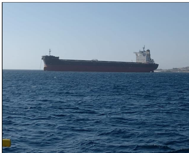
1. General view of vessel.