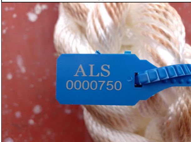
7. View of mooring lines with ALS SEAL. Nr- 0000750.