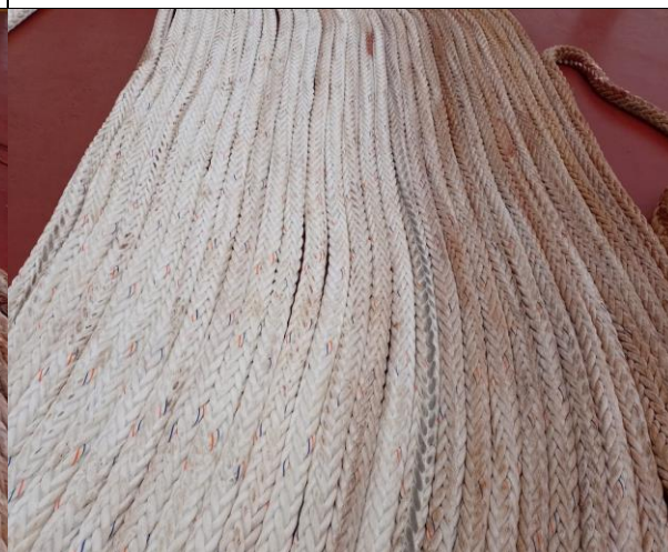
4. Another view of mooring lines arranged for its inspection.