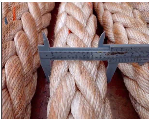
9. General view of diameter.