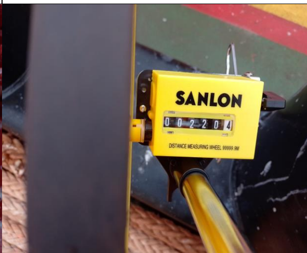
12. Another view of the mooring lines measurement.