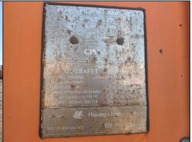
2. CSC Plate in good conditions