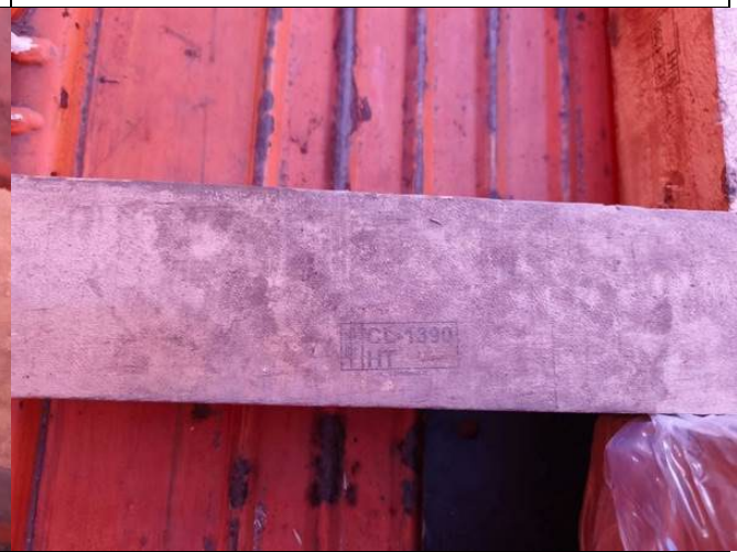
4. Wooden duly certified