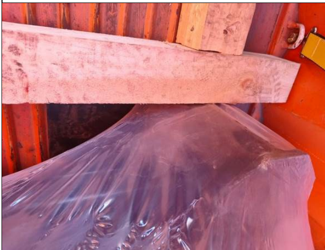
7. View of the rubber protection used to prevent cargo movement.