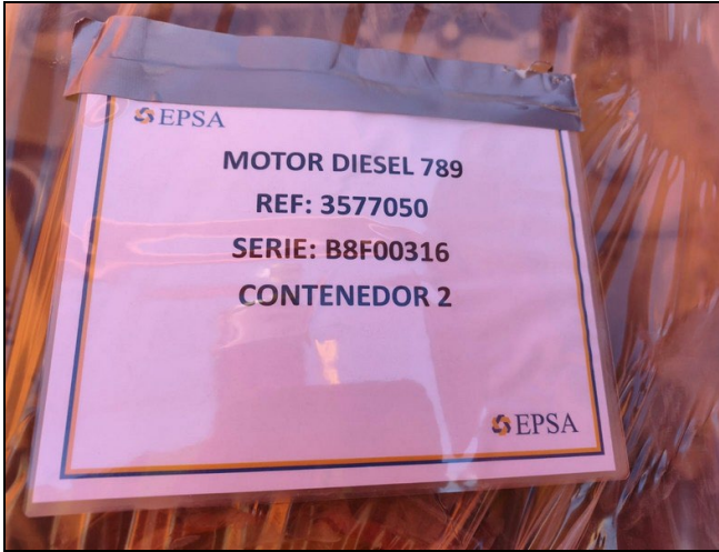
5. SERIAL B8F00316 Diesel Engine.