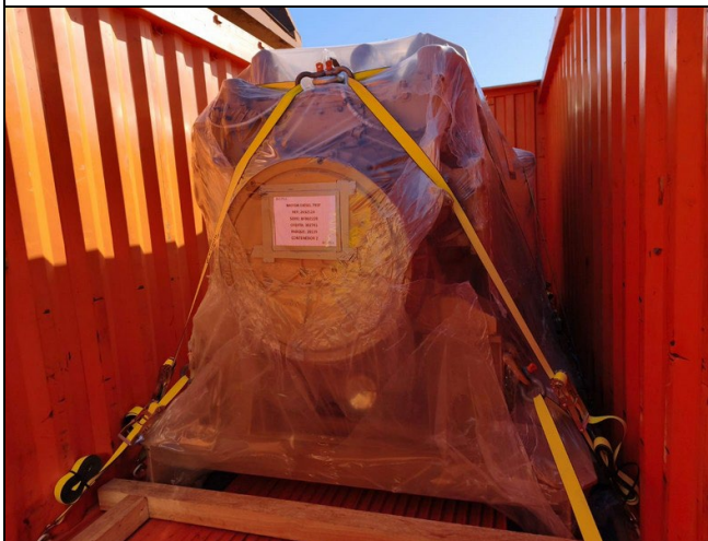
11. View of lashing conditions.