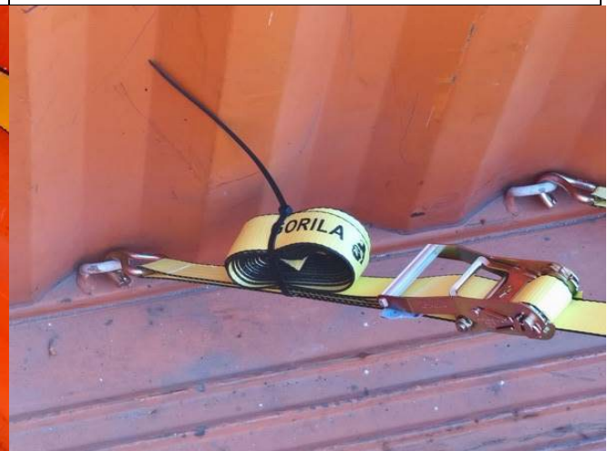
8. View of lashing conditions, hook located in container d-ring.