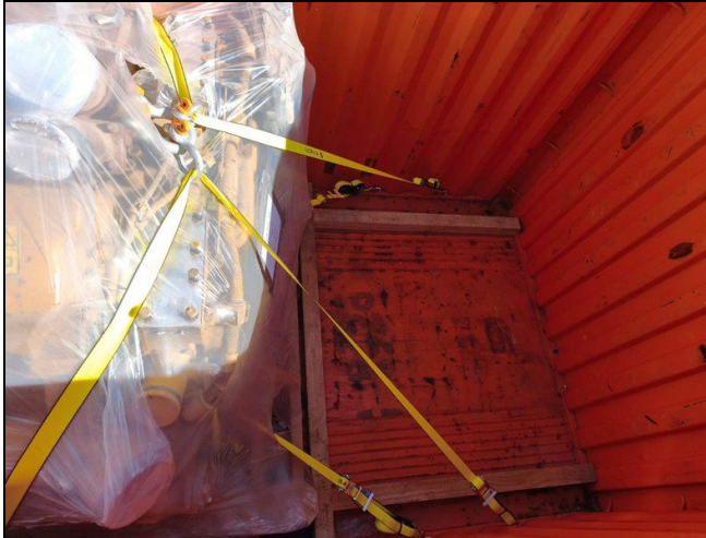
9. View of wooden located between cargo