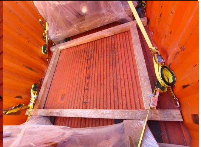
10. View of wooden located between cargo