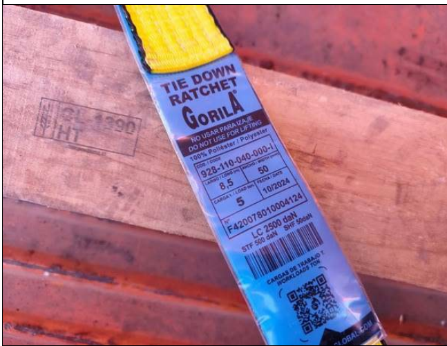
3. Lashing Band identifications