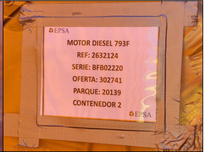
6. SERIAL BFB02220 Diesel Engine.