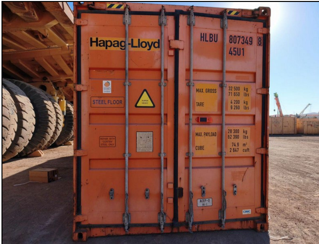
1. Identifications of container HLBU 806719-7