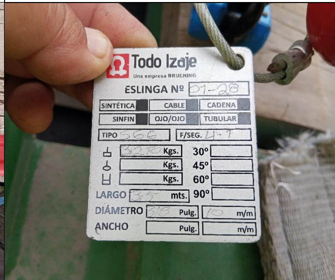
4. Chain plate identification WLL 3.200 ton.