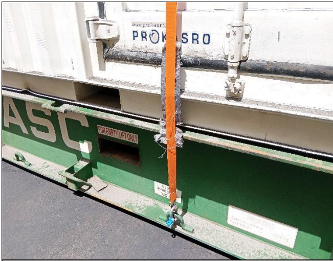
9. Synthetic sling made fast to Flat Rack container ring bolts and protection, with sling pieces.