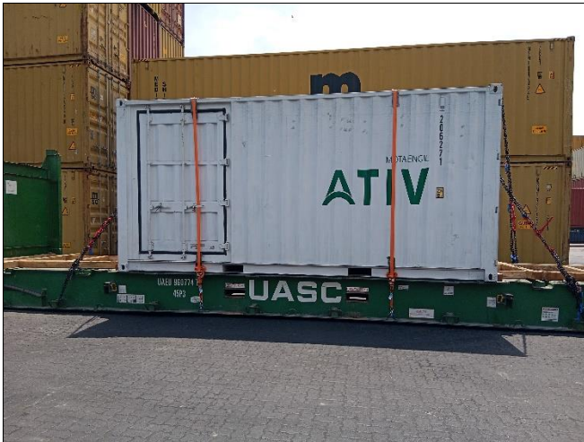
11. General view of lashed cargo.