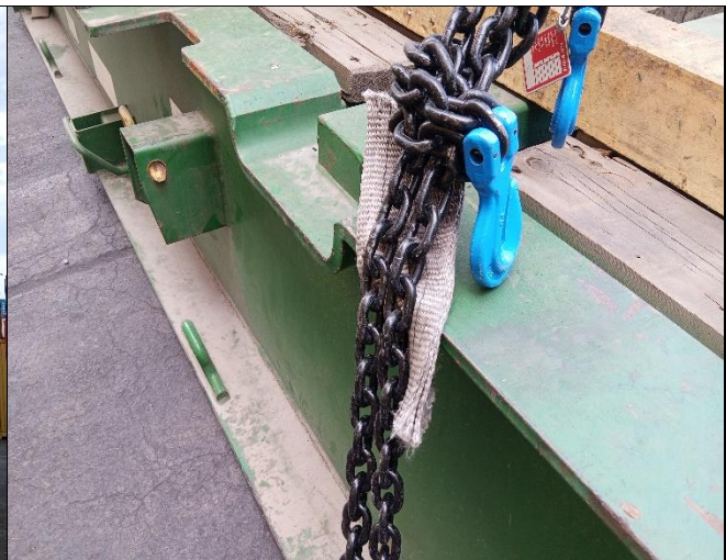
8. Chains made fast to Flat Rack container ring bolts and protection, with sling pieces.