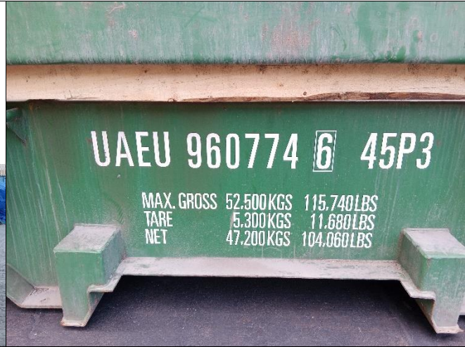
2. Identification and characteristic of UAEU 960774-6.