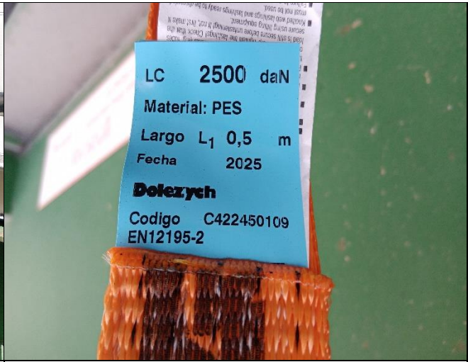
10. Sling identification capacity label.