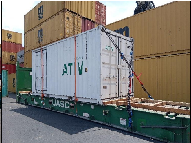
12. Another view of cargo lashed.