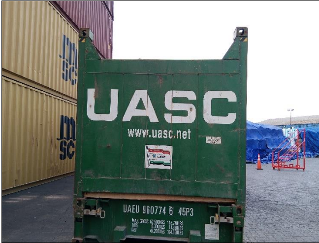
1. Identification of container UAEU 960774-6.