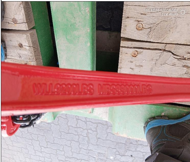
3. Turnbuckles with hook WLL 9200 lbs.