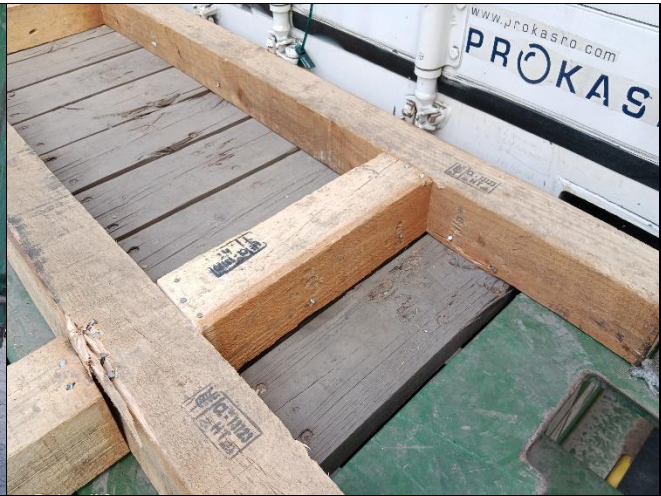
6. Duly certified stamp Wood.