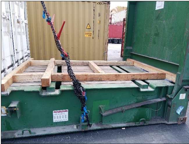
5. View of ladders 4"x 4" for chocking.