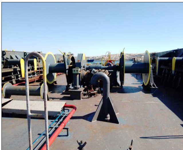
1. View of winch Between H8 & H9.