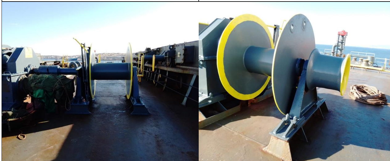
3. Another view as previous one.