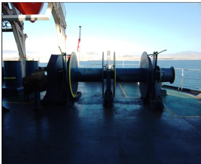
1. View of Ps, Aft, winch.