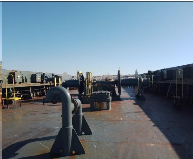
2. View of winch Between H1 & H2.