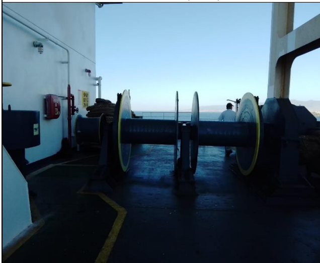
3. Another view as previous one.