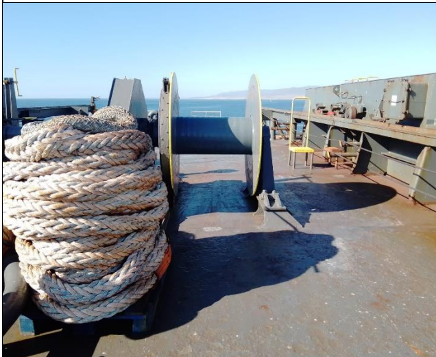
3. Another view as previous one.