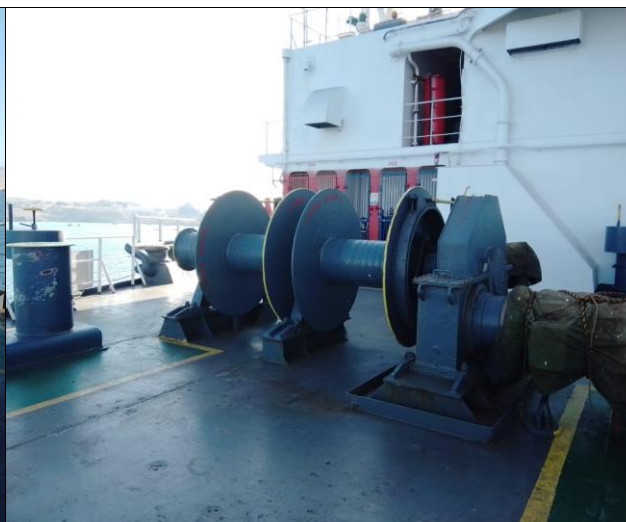
2. View of Ps, Aft, winch.