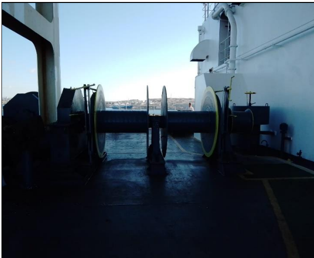
1. View of Mid, Aft, winch.