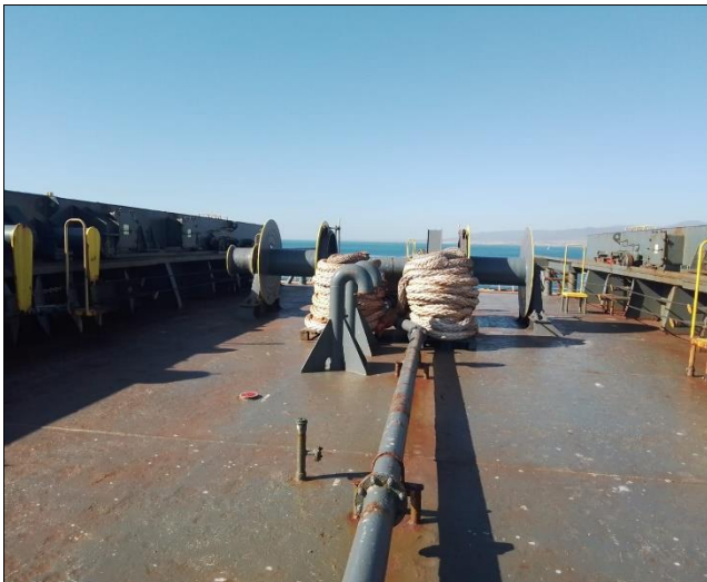
1. View of winch Between H1 & H2.