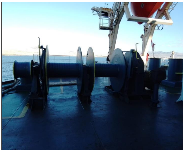
1. View of Ss, Aft, winch.