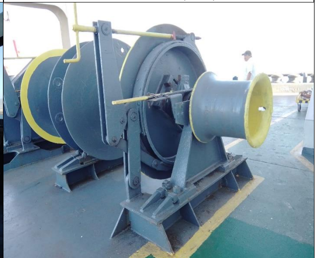
4. View of warping drum.