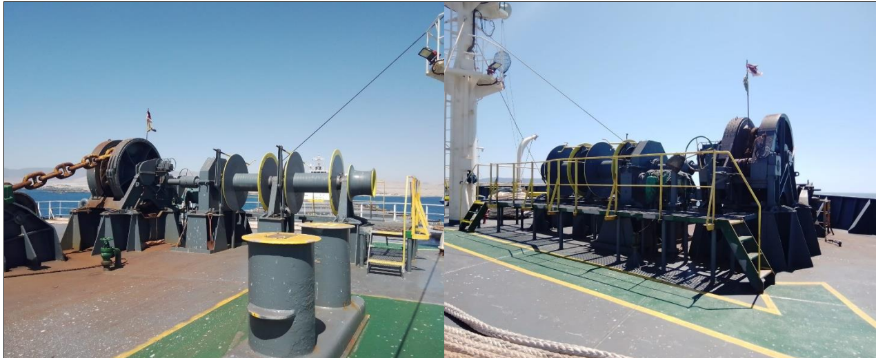
1. View of Mid, Fwd, winch.