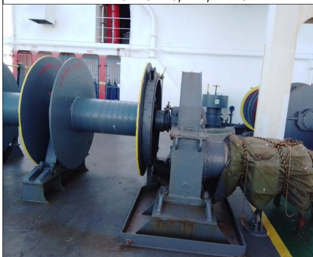
3. Another view as previous one