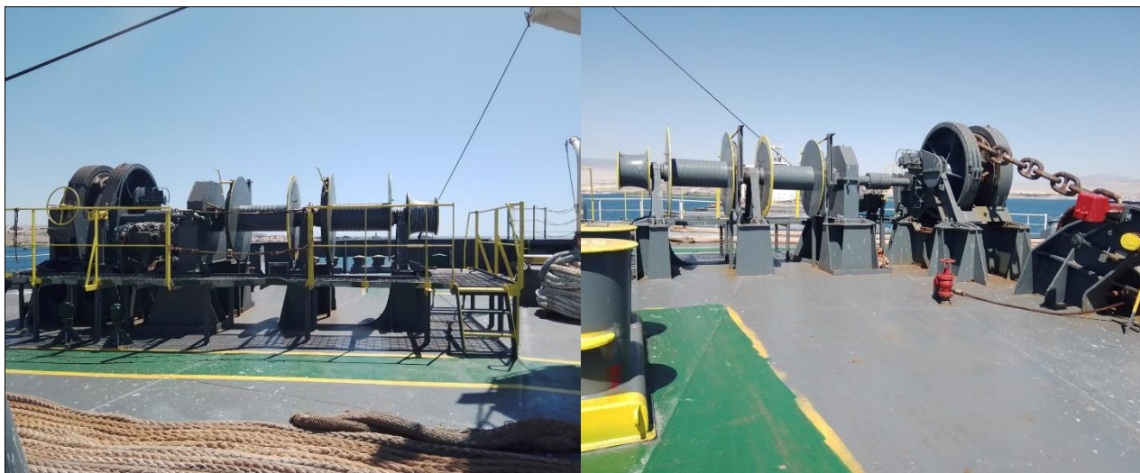
1. View of Ss, Fwd, winch.