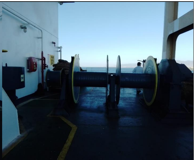
2. View of Mid, Aft, winch.