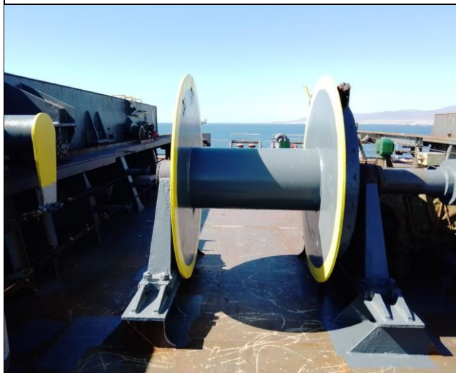
3. Another view as previous one.