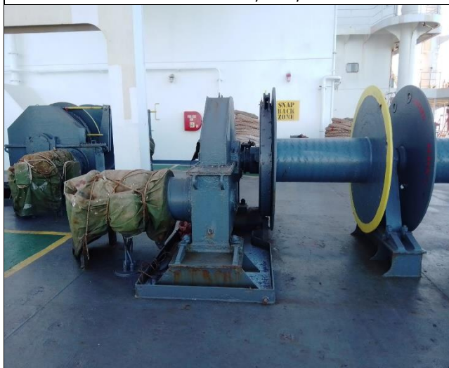
3. Another view as previous one.