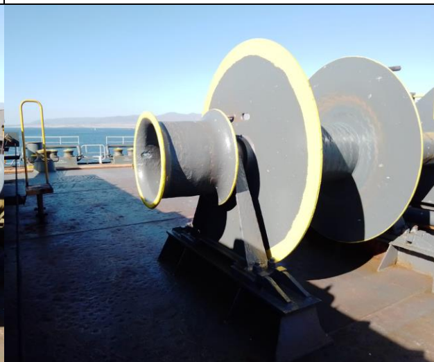
4. View of warping drum.