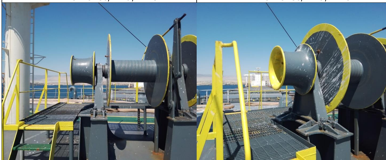
3. Another view as previous one.