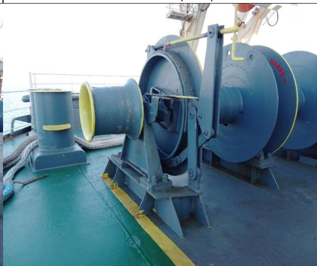
4. View of warping drum.