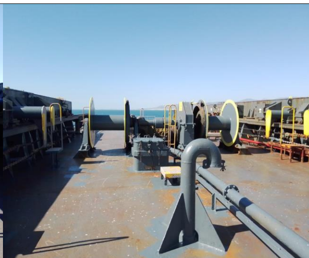
2. View of winch Between H8 & H9.