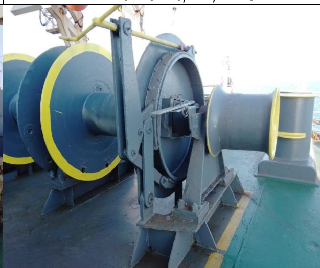
4. View of warping drum.