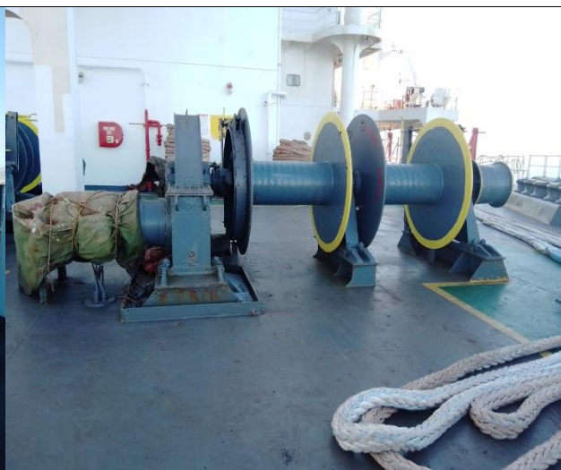
2. View of Ss, Aft, winch.