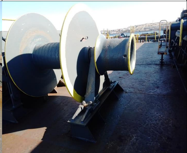
4. View of winches.