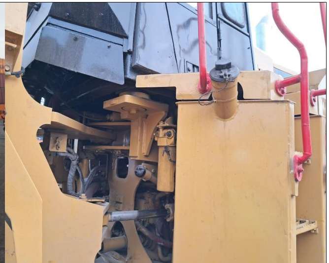
2. Fuel cap in good condition.