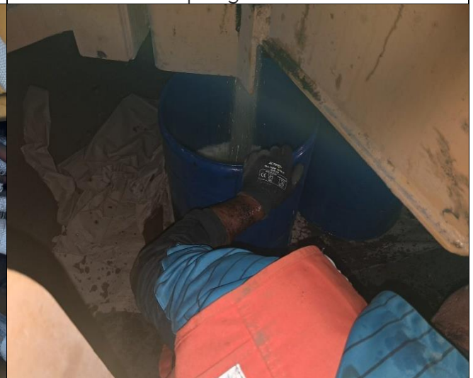
4. Fuel tank being emptied.