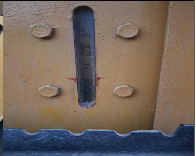
6. Hydraulic oil gauge level on 1/4%.