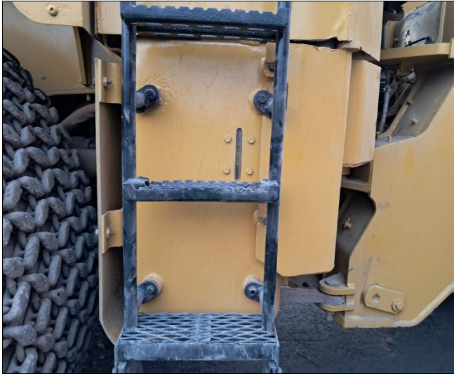
5. Hydraulic oil tank.