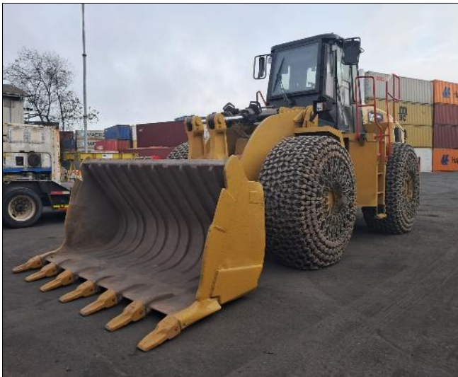
1. Caterpillar 980H.