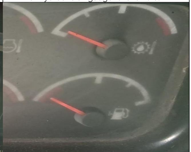
8. Other view of fuel quantity.