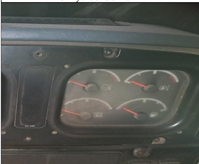
7. Internal dashboard with less than 1/4 tanks capacity.