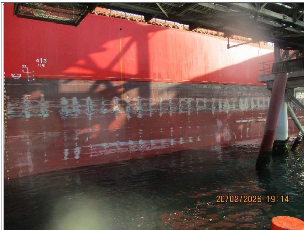
7. Mid Ship / Ss draft mark.