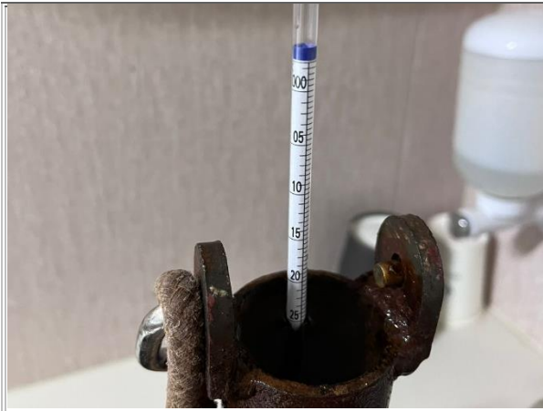
5. Checking density sea water