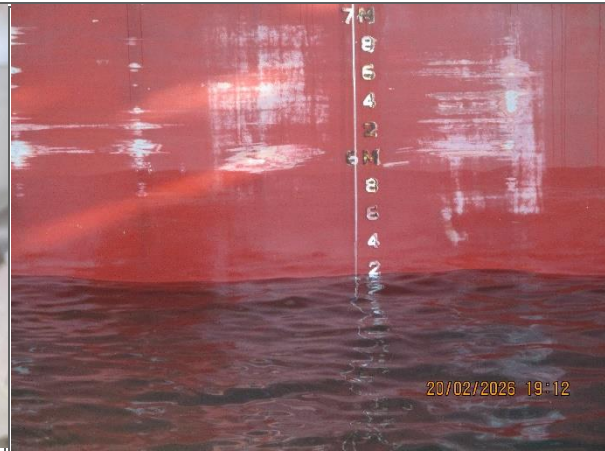
6. Mid Ship / Ss draft mark.