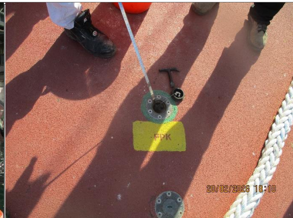
8. View of ballast check.