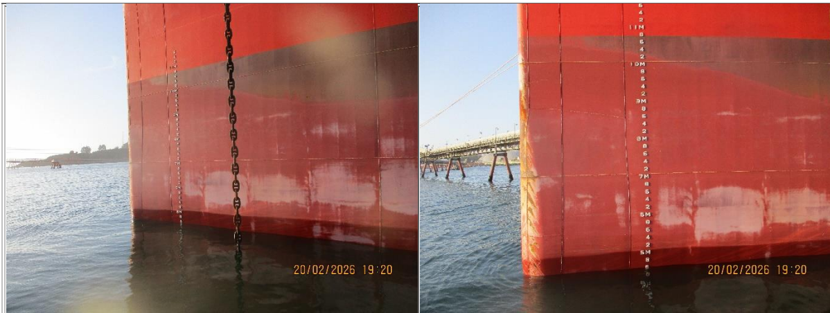
1. Fwd / Ps draft mark.