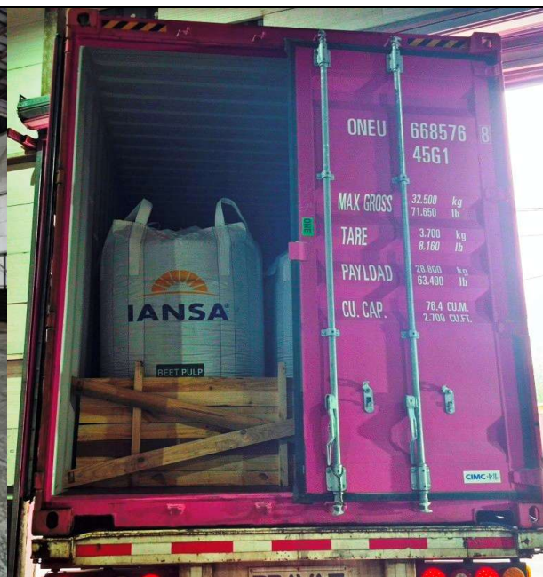
2. View of cargo stuffed into container.