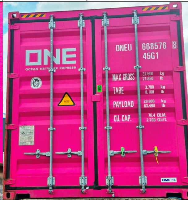
6. General view of sealed container.