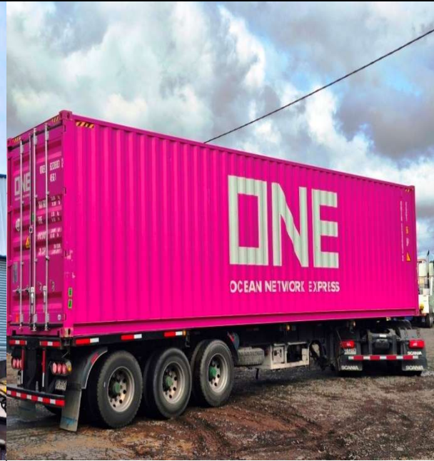
4. Another view lateral panel in inspection process.