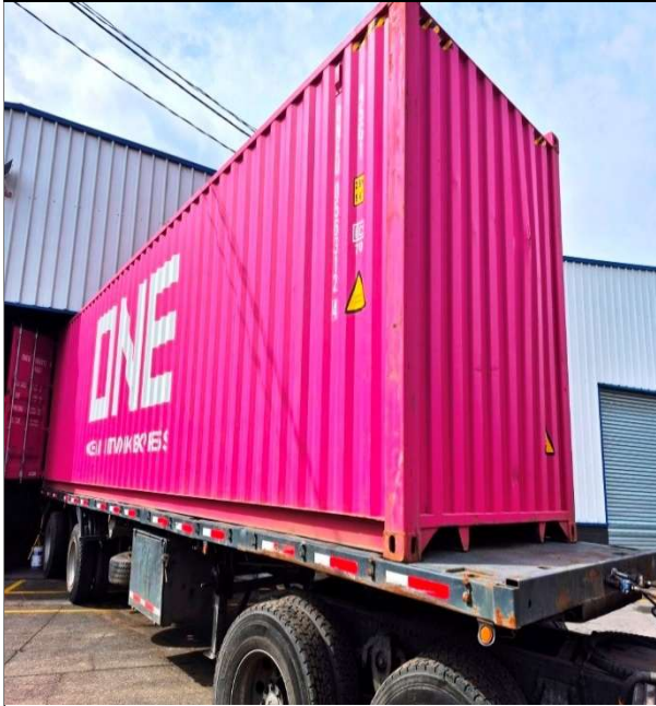
3. View container lateral side, in inspection process.