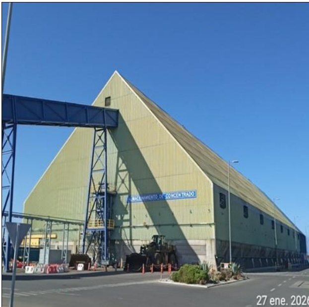
18. View of stockpile warehouse.