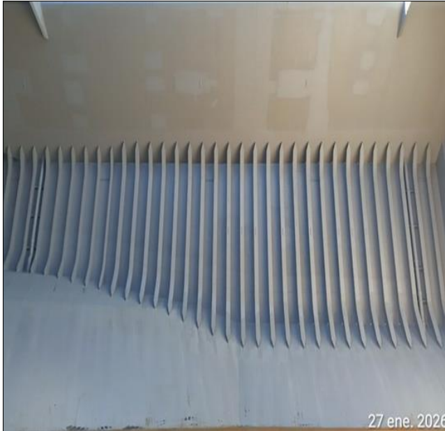
4. Hold Nr. 5/Ps, shell plating condition.