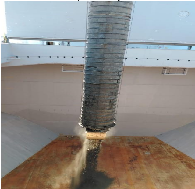
22. Loading operation of copper concentrate in hold Nr. 5 commenced.