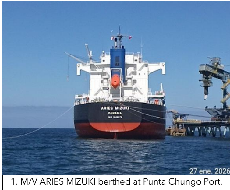
1. M/V ARIES MIZUKI berthed at Punta Chungo Port.