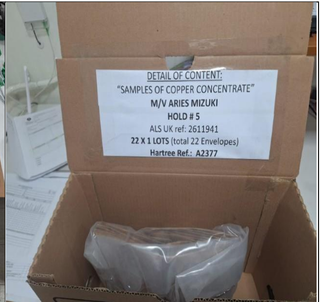
72. Sample bags packaged inside carton box to be dispatched to Zhao Jingru.