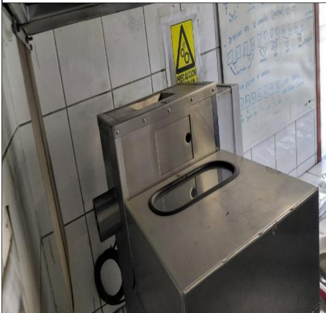
49. Dried sample being divided into automatic divider.