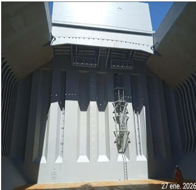
2. Hold Nr. 5, general condition of bulkhead/Fwd.