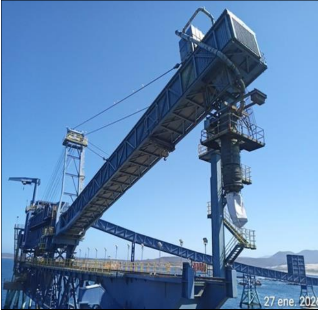
20. Ship loader system.