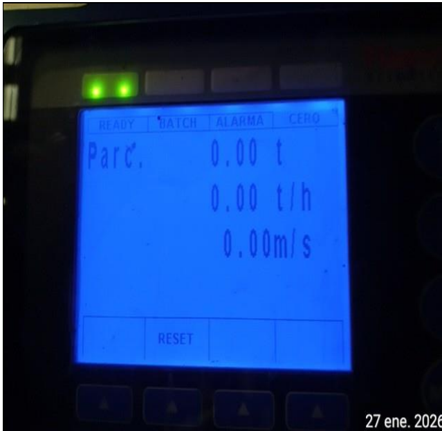
32. Shore scale in zero check (prior to start loading operation).