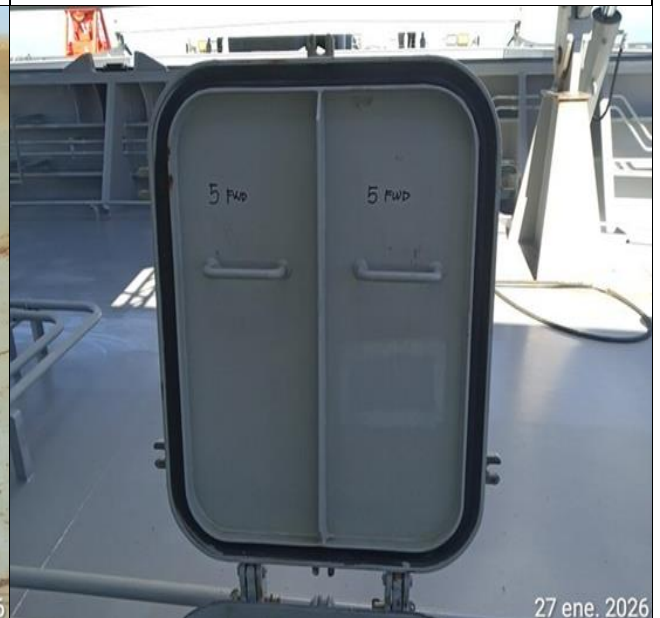
11. Hold Nr. 5, Stevedores' access with rubber packing in good conditions.