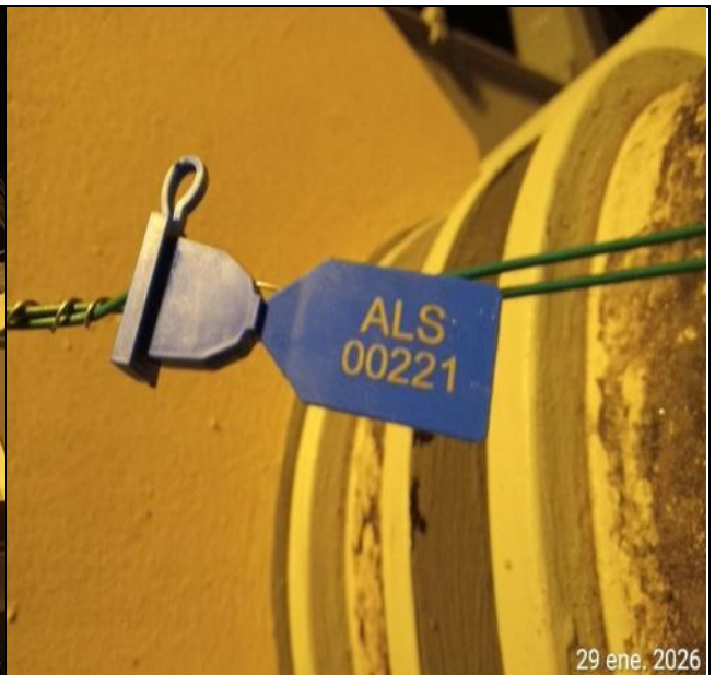
27. Hold Nr. 5, hatch cover with seal Nr. ALS 00221 .