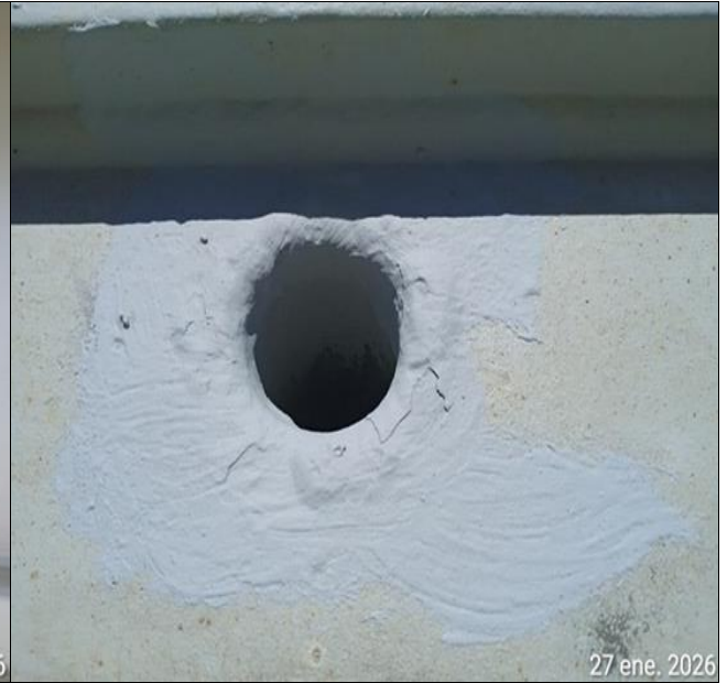
13. Hold Nr. 5, drain hole condition.