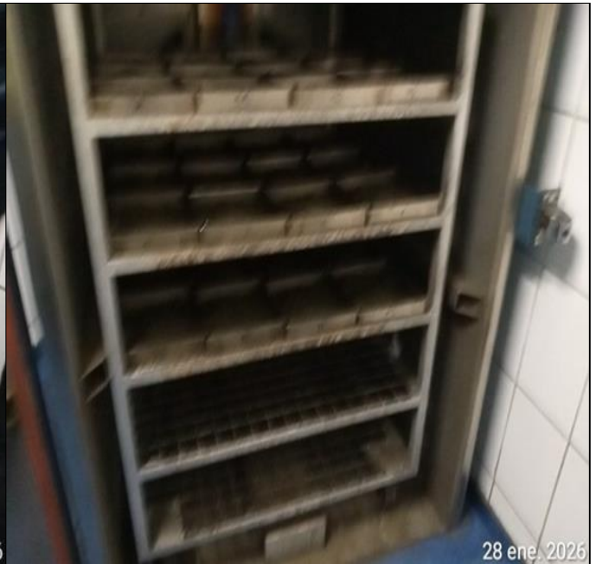
44. View of trays with samples into the oven.