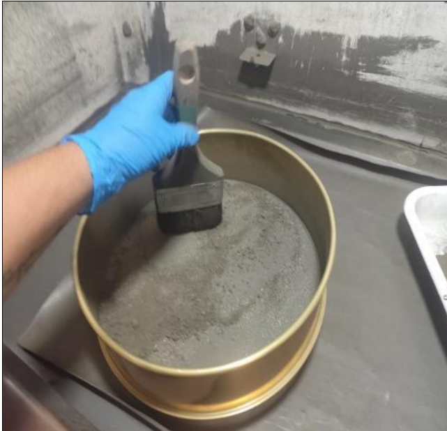
47. Sieve in process.