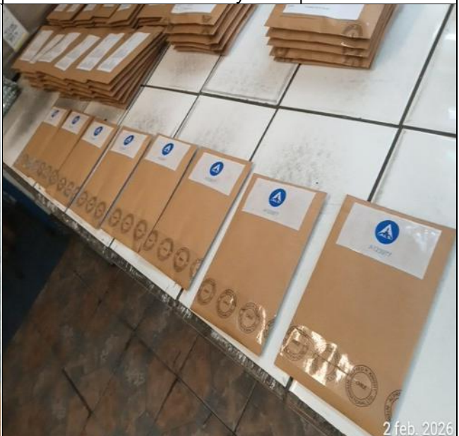
54. General view of samples with ALS tape.