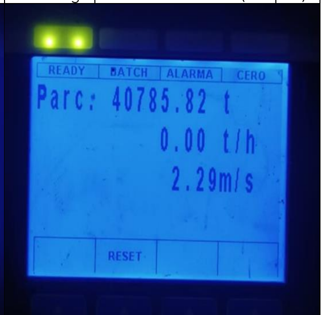
35. Weighing scale before commence loading operation in hold Nr. 5 (second part)