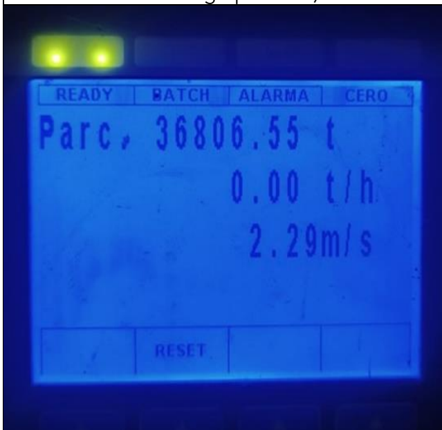
34. Weighing scale after finishing loading operation in hold Nr. 5 (first part).