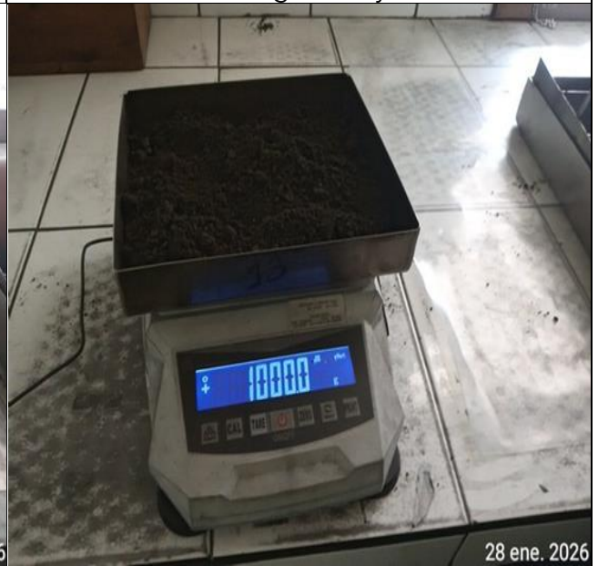
42. Weighing of tray with sample.