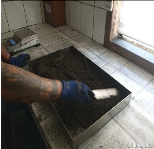
39. Sample being divided by AHK Lab personnel.