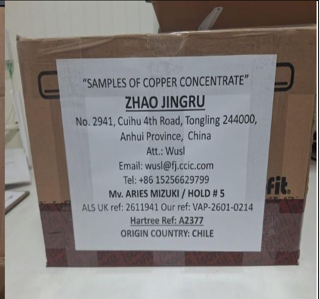
74. Carton box duly labeled & closed to be dispatched to Zhao Jingru.