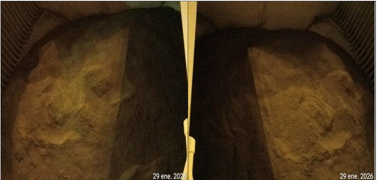
24. Loading operation completed in hold Nr. 5.