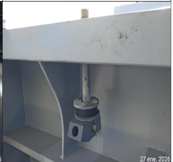
15. Hold Nr. 5, acting cleat.