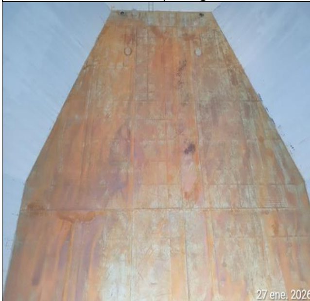
6. Hold Nr. 5, general condition of tank top plating.