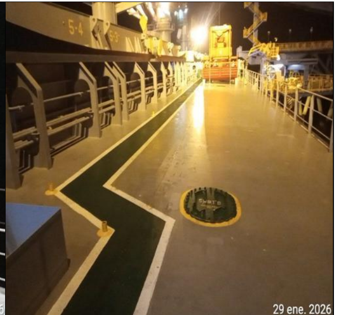
57. Shiploader without spilling of cargo.