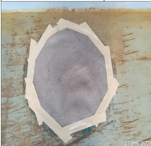
10. Hold Nr. 5, bilge/Ps covered with burlap and sealed with tape.