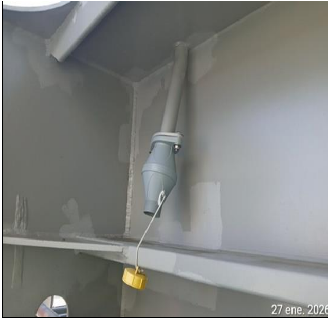
12. Hold Nr. 5, non-return valve.