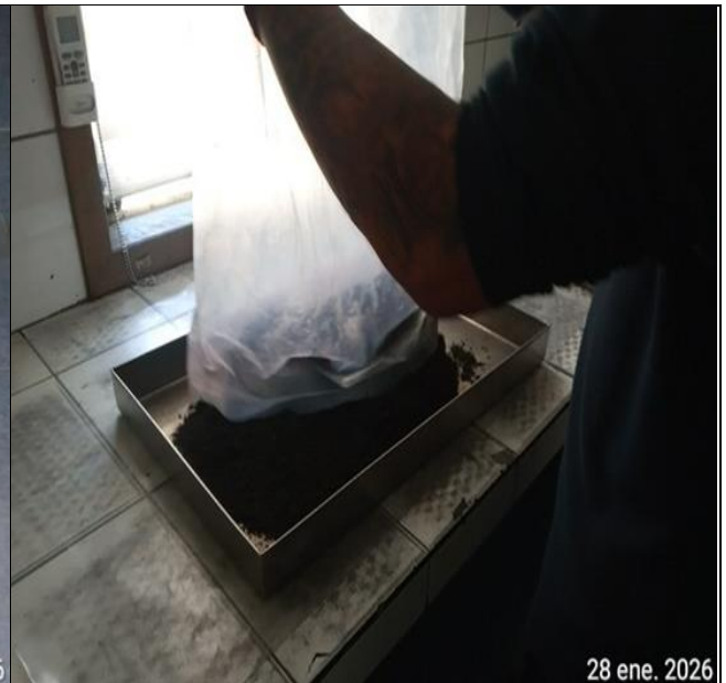
38. Sample in laboratory being poured into a tray of 52 x 60cm.