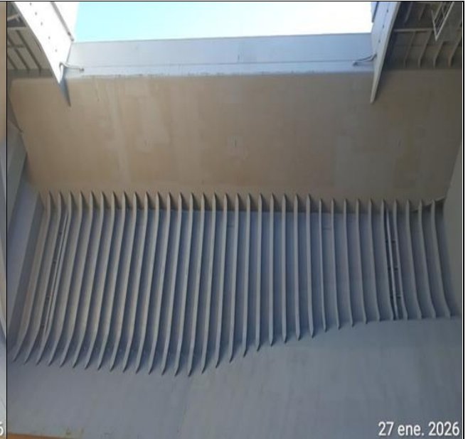
5. Hold Nr. 5/Ss, shell plating condition.