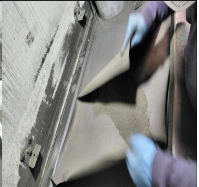
48. Sample being homogenized onto a carpet by AHK lab personnel.