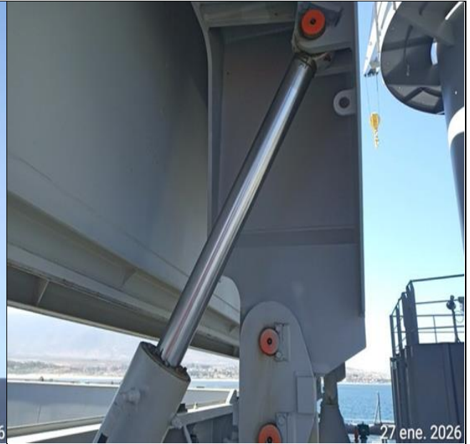
17. Hold Nr. 5, hydraulic system without leaking.