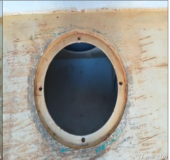
9. Hold Nr. 5, bilge/Ps clean and dry.