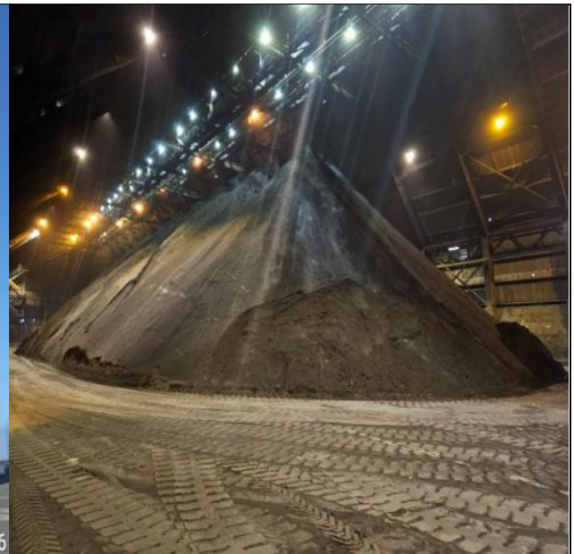
19. Copper concentrate inside stockpile prior commencement of loading operation.