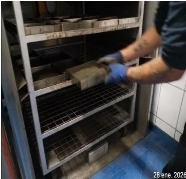
43. Trays being placed into the oven for 5 hours plus 1 hour.