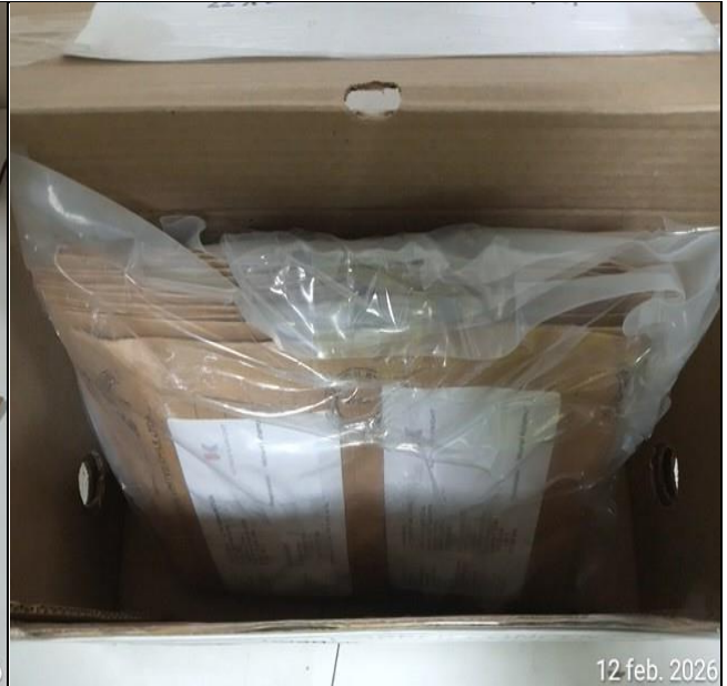
68. Sample bags packaged inside carton box to be dispatched to ALS UK.