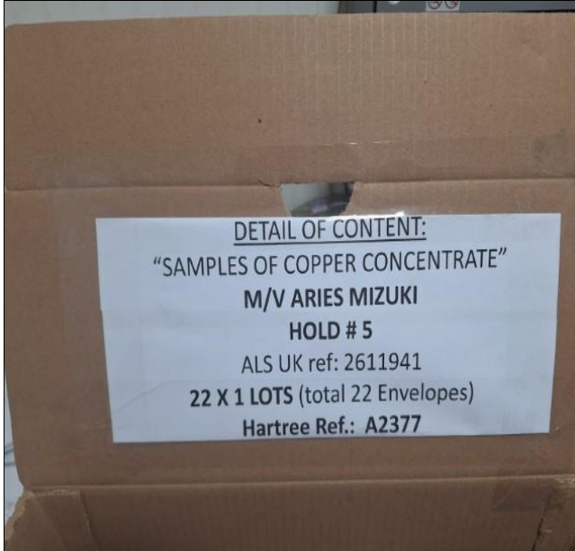
73. Label with detail inside box to be dispatched to Zhao Jingru.