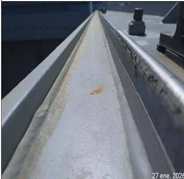
14. Hold Nr. 5, compression bar in good condition.