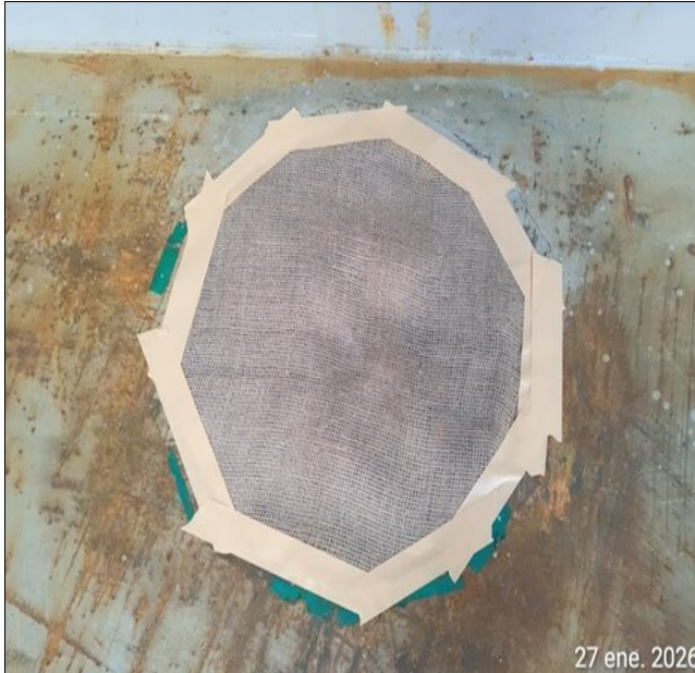
8. Hold Nr. 5, bilge/Ss covered with burlap and sealed with tape.