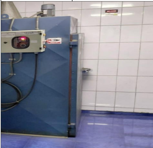
45. Oven closed by AHK lab personnel.