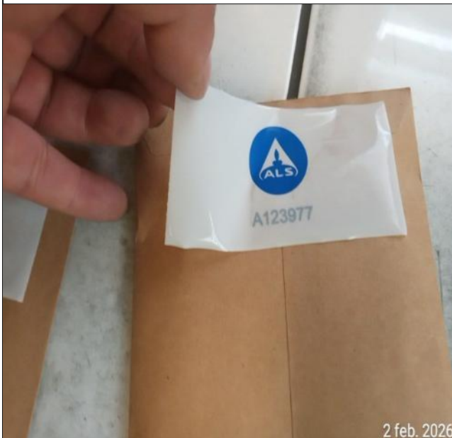
53. Sample bags being sealed with ALS tape by ALS Surveyor.