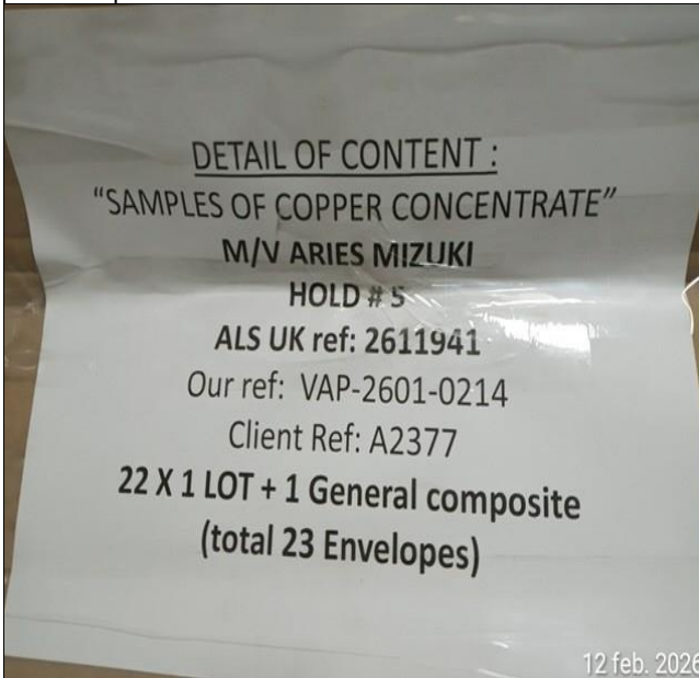
69. Label with detail inside box to be dispatched to ALS UK.