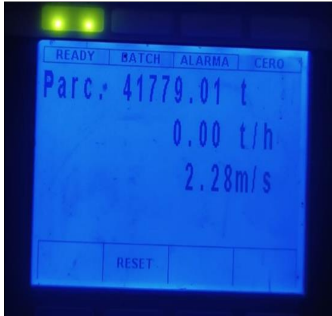
36. Weighing scale after finishing loading operation in hold Nr. 5 (second part).