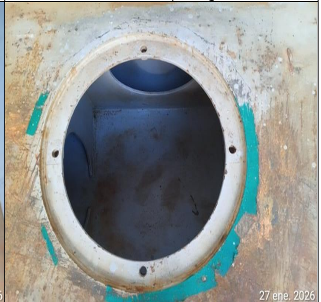
7. Hold Nr. 5, bilge/Ss clean and dry.