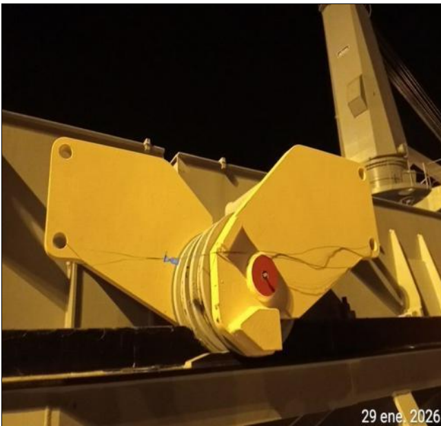
26. General view of hatch covers sealed.