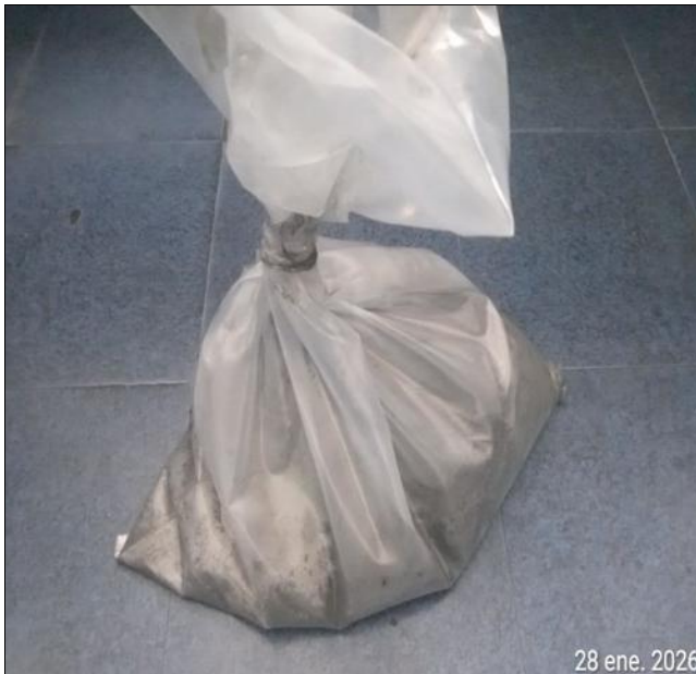
37. Sample in plastic bags duly sealed by AHK personnel.