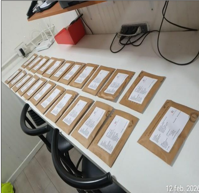
67. Sample bags being prepared to be placed inside carton box for ALS UK.