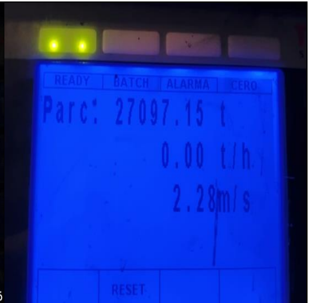
33. Weighing scale before commence loading operation in hold Nr. 5 (first part).