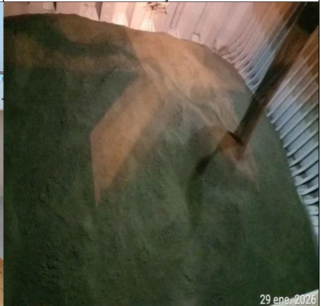
23. Loading operation in process in hold Nr. 5.