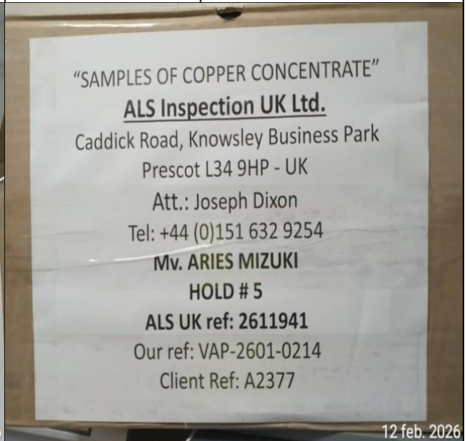
70. Carton box duly labeled & closed to be dispatched to ALS UK.