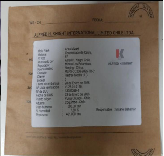
52. Close up view of bag duly sealed/ labeled by AHK personnel.