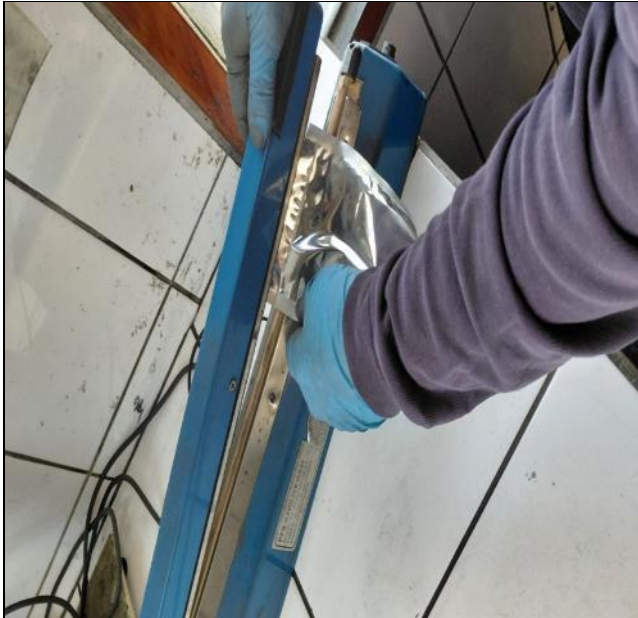
51. Sample being sealed by AHK personnel.