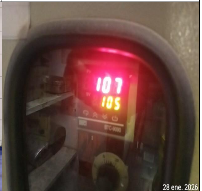
46. Oven temperature of 107.0 °C.