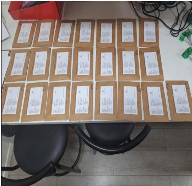
71. Sample bags being prepared to be placed inside carton box for Zhao Jingru.