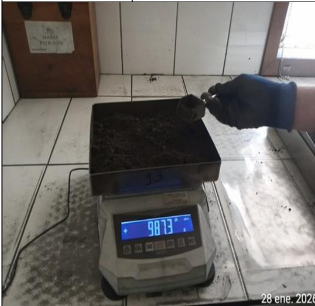
41. Sample being put into tray.