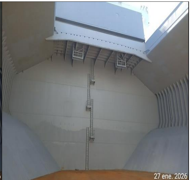
3. Hold Nr. 5, general condition of bulkhead/Aft.