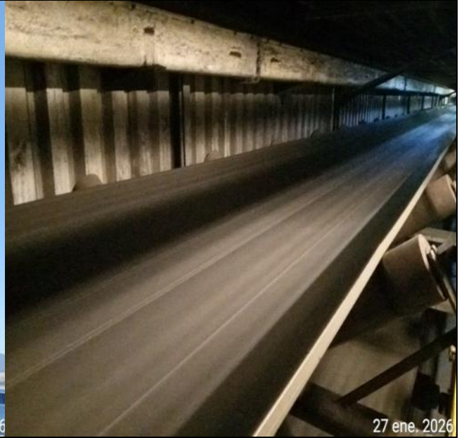
21. Conveyor belt.