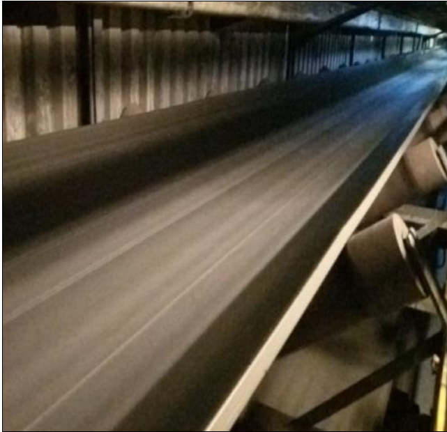
59. Conveyor belt clean and without spilling of cargo.