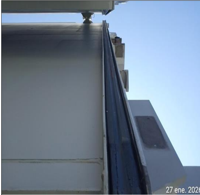
16. Hatch cover hold Nr. 5, rubber packing condition.