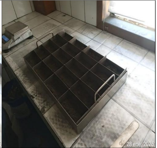
40. Sample divided in 20 square portions for filling the tray.