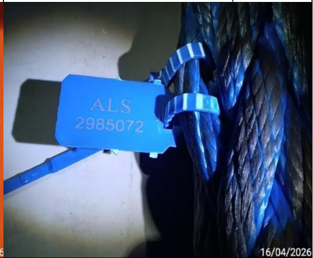
40. Seal N° 2985072.