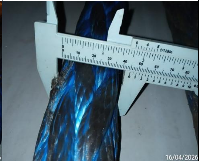
38. Diameter of the rope.