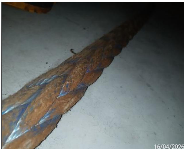
29. General view of the rope.