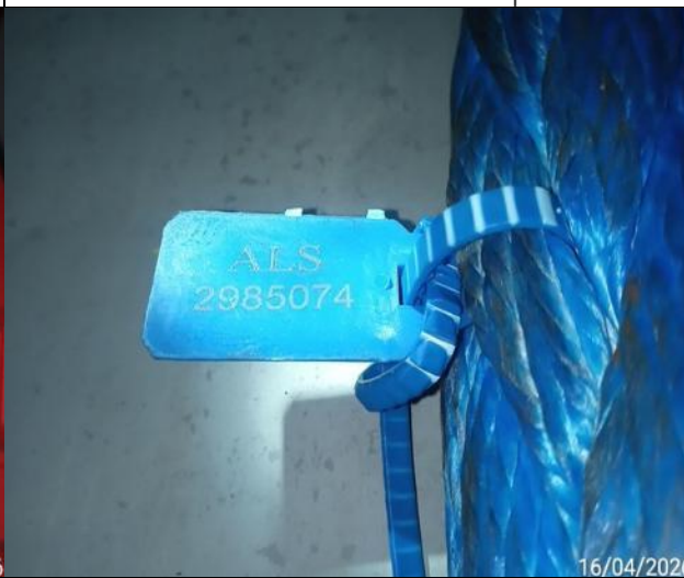
48. Seal N° 2985074.