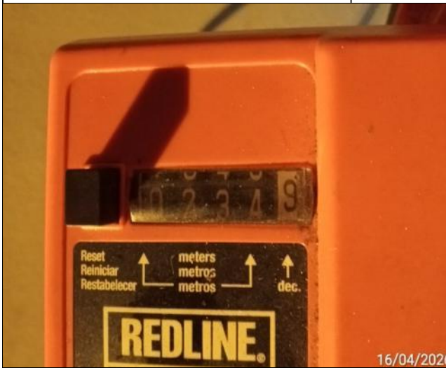
39. Measurement of the rope, 234.9 meters.