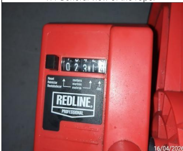
19. Measurement of the rope, 231.4 meters.