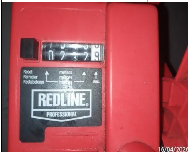
23. Measurement of the rope, 232.9 meters.