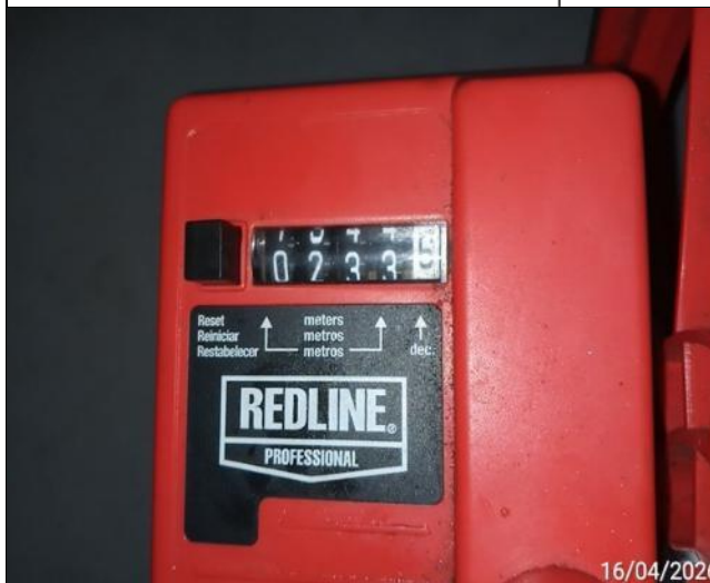
27. Measurement of the rope, 233.6 meters.