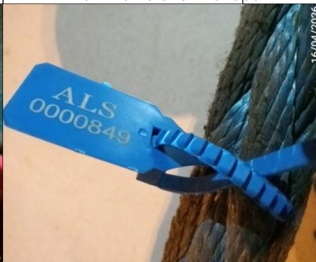
8. Seal N° 0000849.