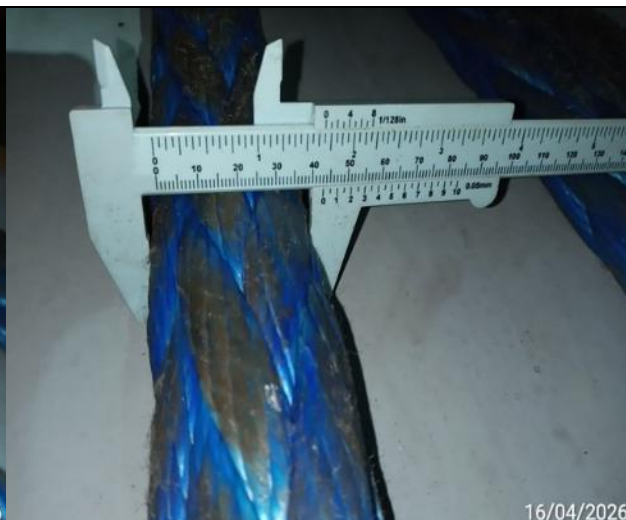
62. Diameter of the rope.