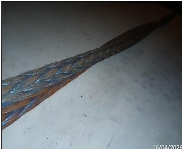
25. General view of the rope.