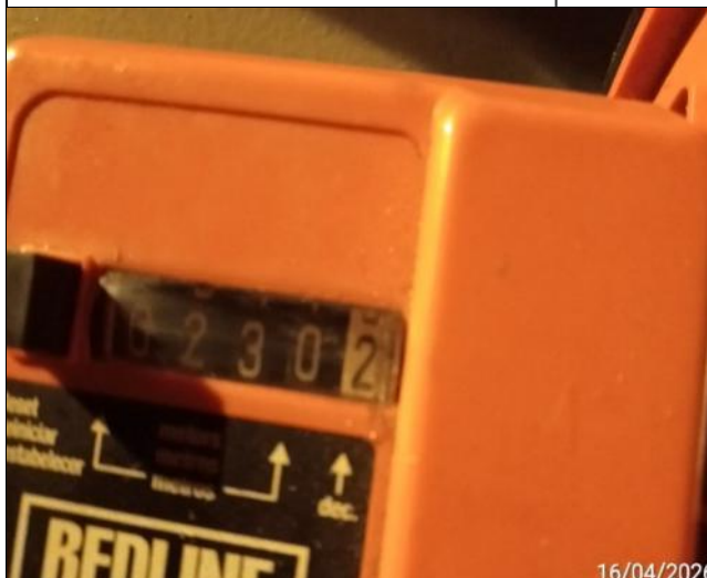
63. Measurement of the rope, 230.2 meters.