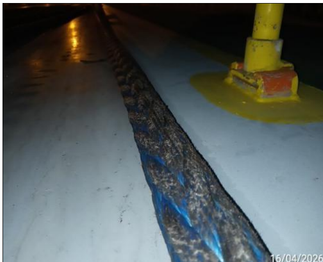
69. General view of the rope.