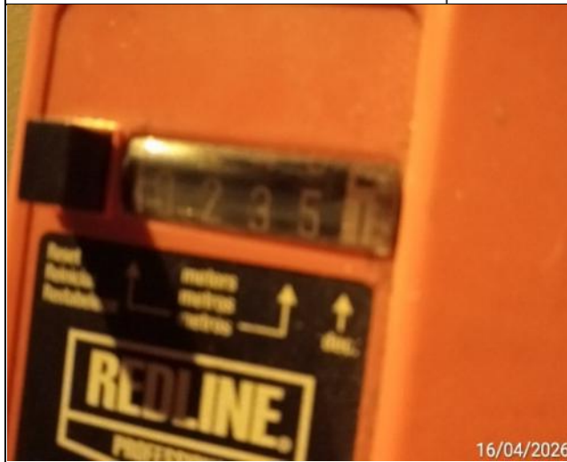
59. Measurement of the rope, 235.1 meters.