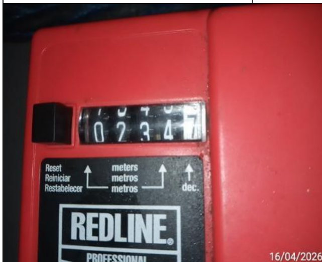
15. Measurement of the rope, 234.7 meters.