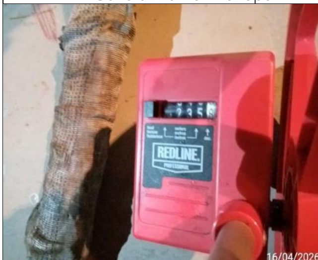
3. Measurement of the rope, 235.8 meters.