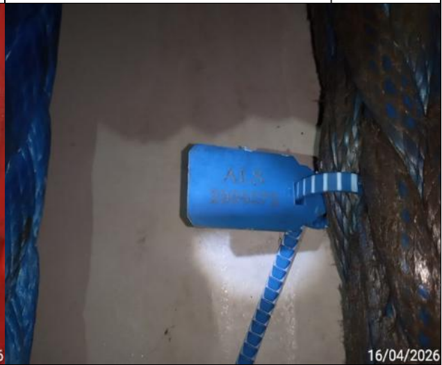
44. Seal N° 2985073.