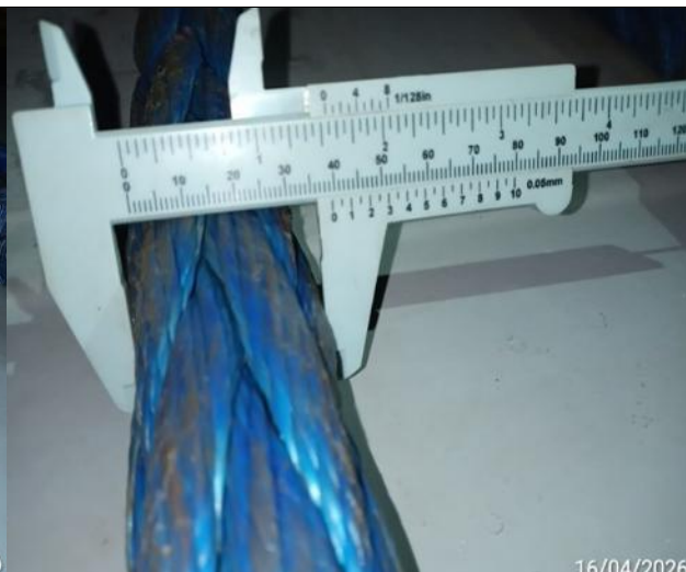
34. Diameter of the rope.