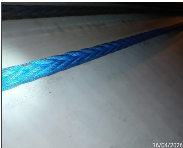
45. General view of the rope.