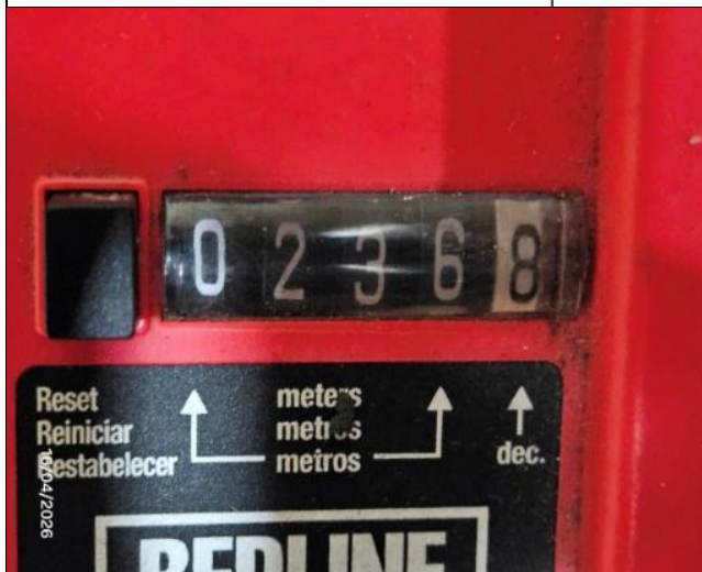
71. Measurement of the rope, 236.8 meters.