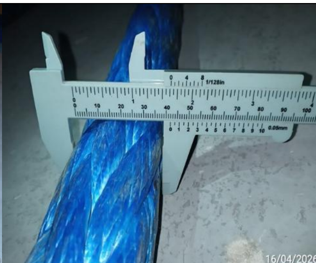
10. Diameter of the rope.