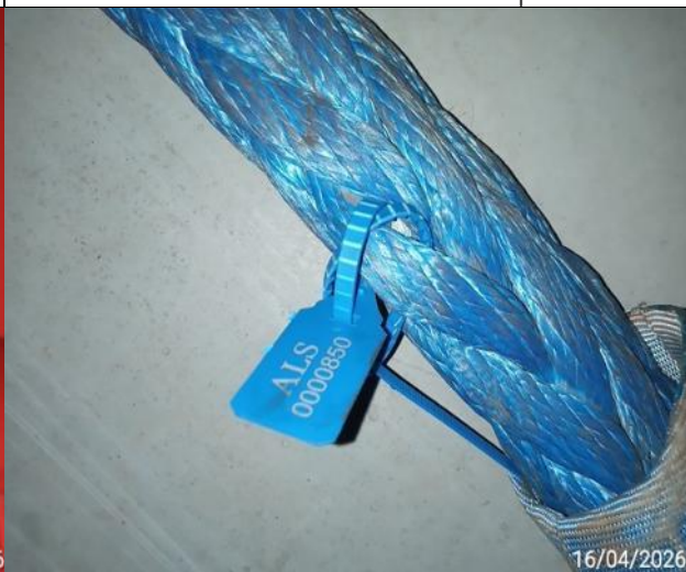
12. Seal N° 0000850.