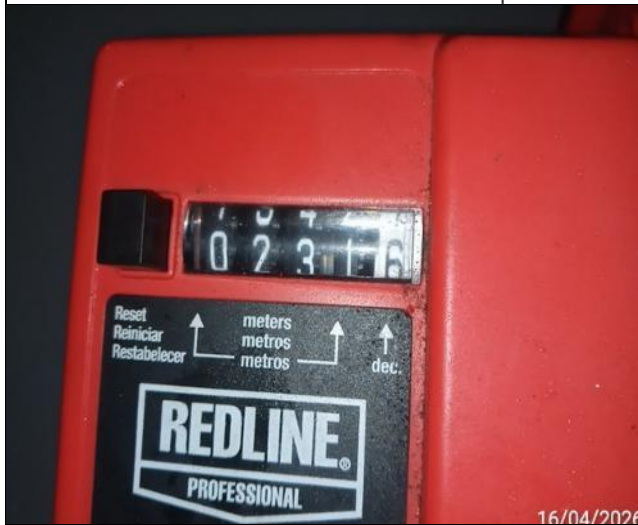
51. Measurement of the rope, 231.6 meters.