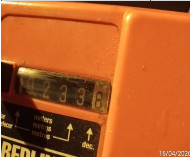
67. Measurement of the rope, 233.8 meters.