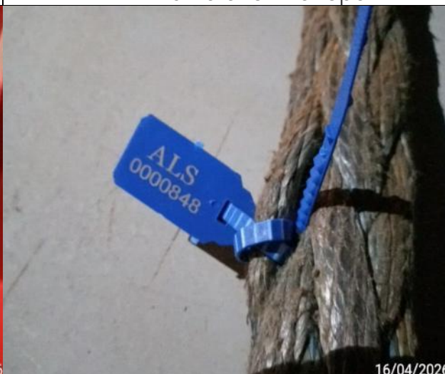
4. Seal Nr. 0000848.