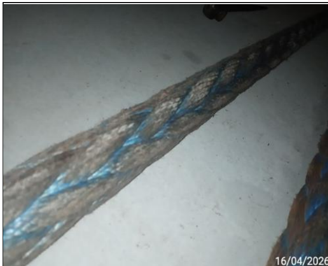
21. General view of the rope.