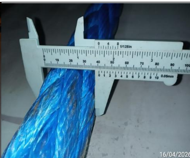
46. Diameter of the rope.