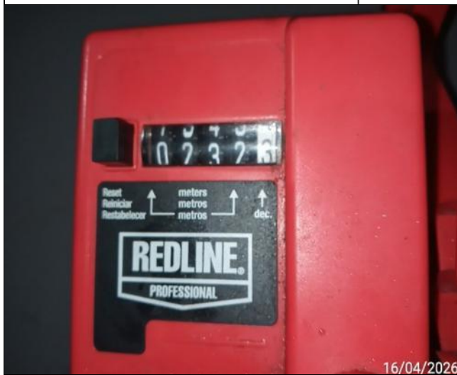
47. Measurement of the rope, 232.3 meters.