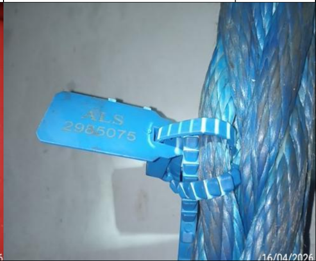
52. Seal N° 2985075.