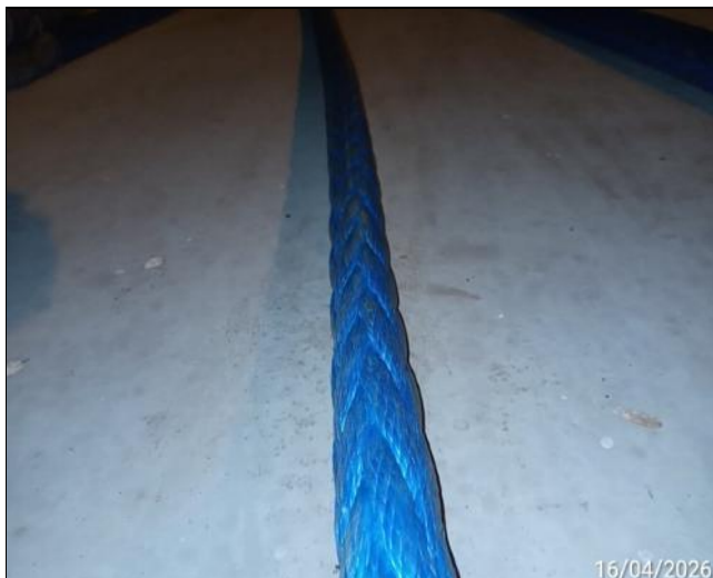
9. General view of the rope.