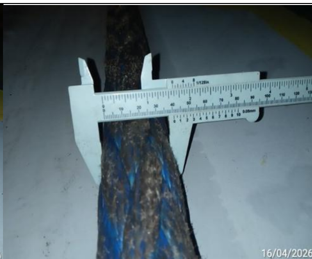
70. Diameter of the rope.