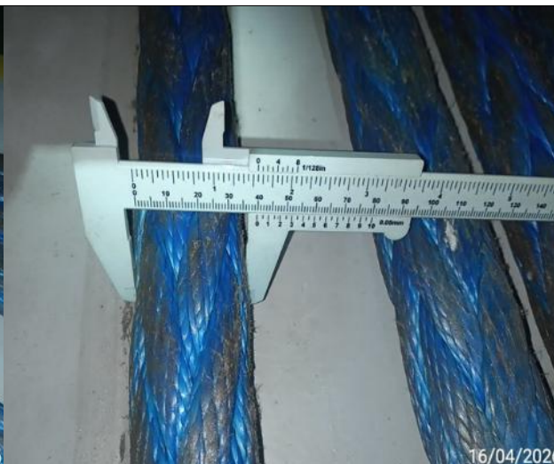
54. Diameter of the rope.