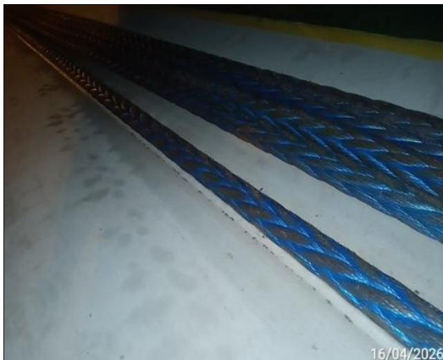
53. General view of the rope.