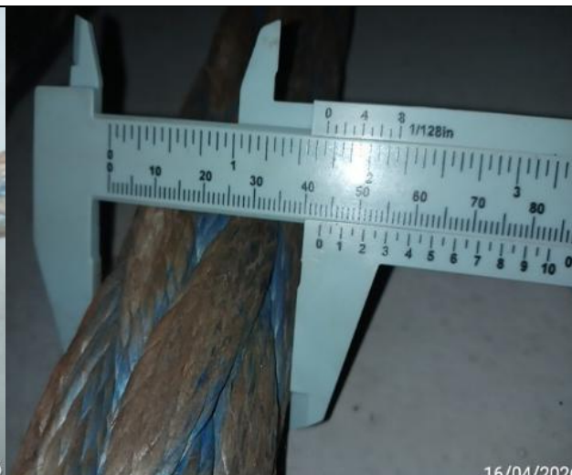
18. Diameter of the rope.