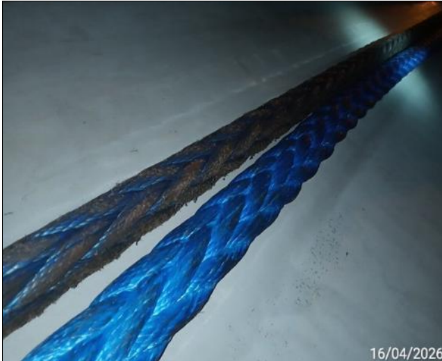
41. General view of the rope.