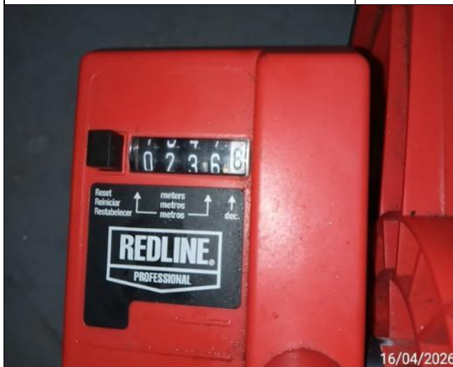
11. Measurement of the rope, 236.6 meters.