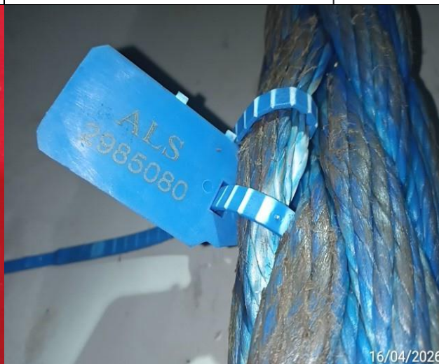
72. Seal N° 2985080