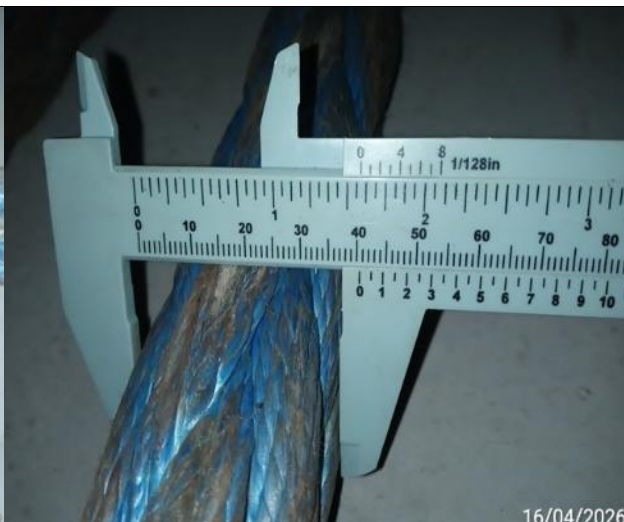
14. Diameter of the rope.