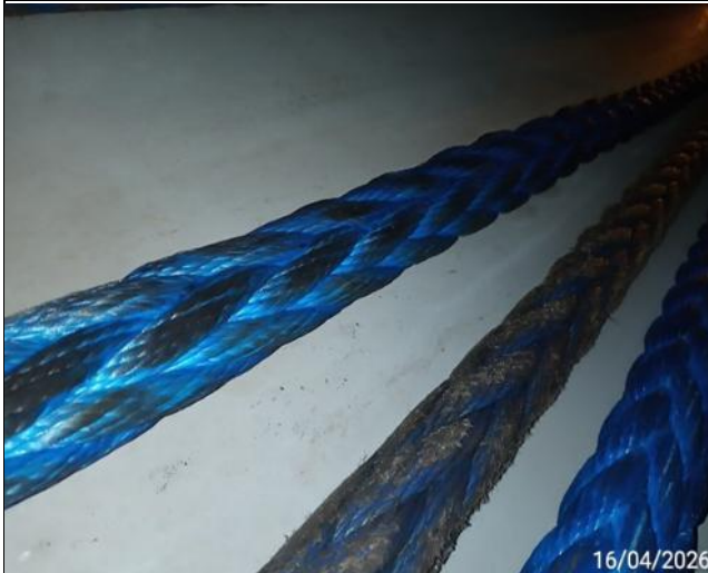
37. General view of the rope.