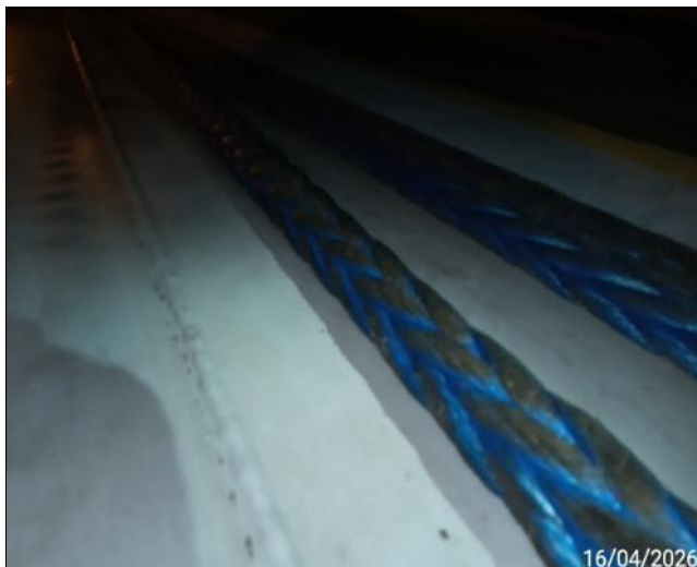
61. General view of the rope.