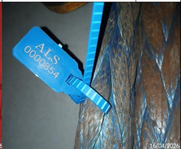
28. Seal N° 0000854.