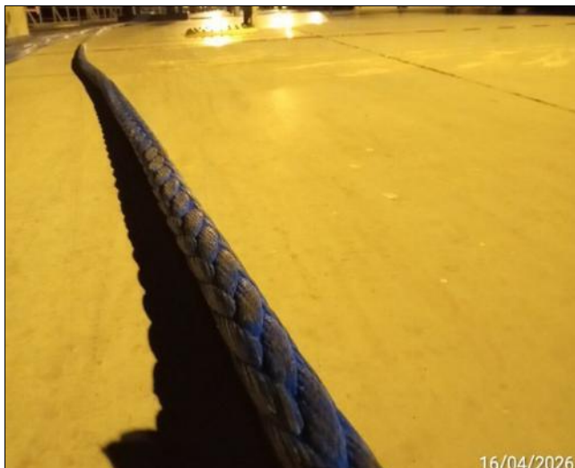
1. General view of the rope.