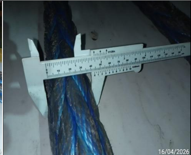
66. Diameter of the rope.