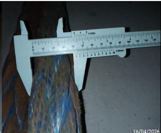
26. Diameter of the rope.