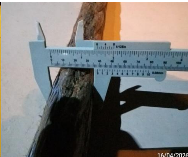
2. Diameter of the rope.