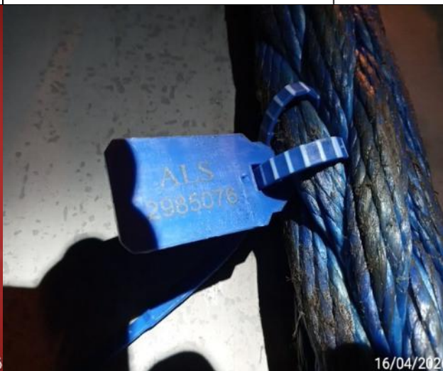
56. Seal N° 2985076.