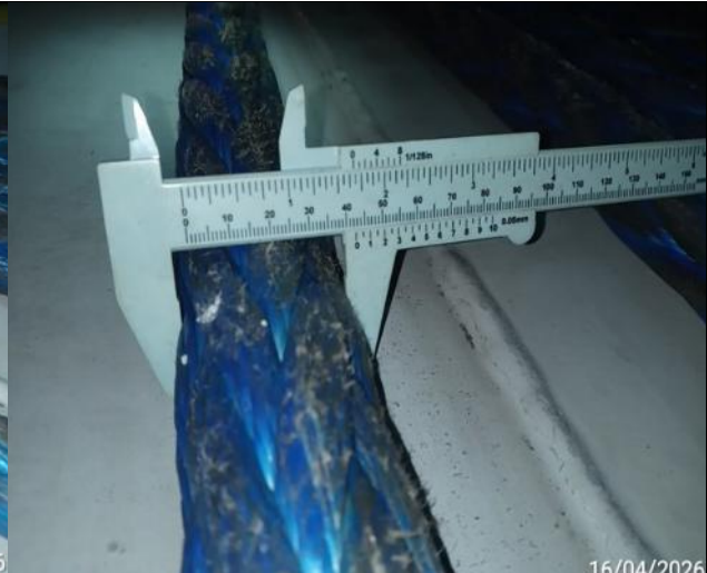
50. Diameter of the rope.