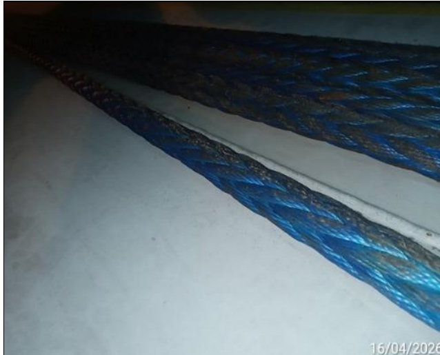
49. General view of the rope.