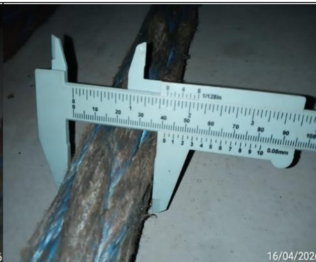
22. Diameter of the rope.