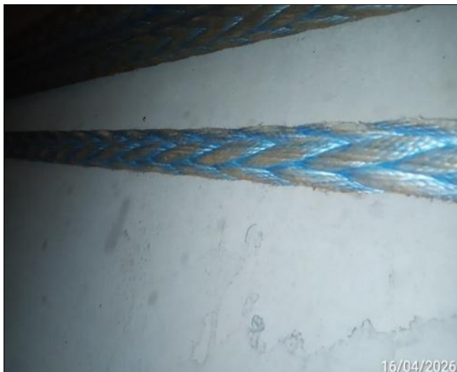
13. General view of the rope.