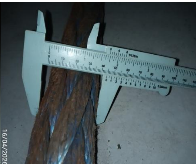
30. Diameter of the rope.