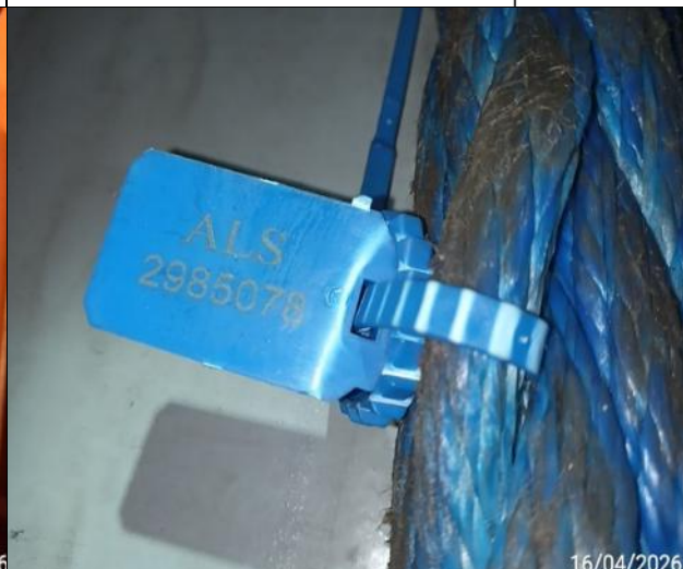
64. Seal N° 2985078.