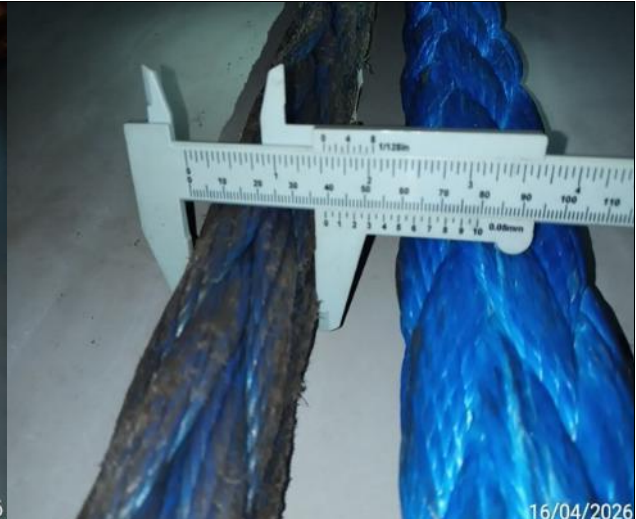
42. Diameter of the rope.