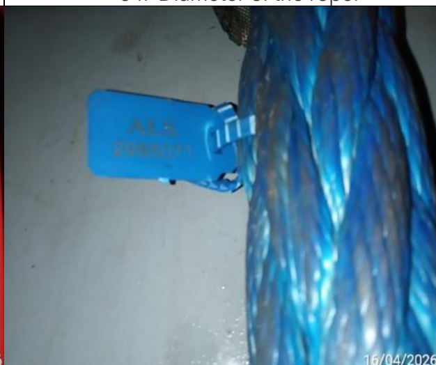
36. Seal N° 2985071.