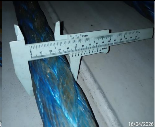
58. Diameter of the rope.