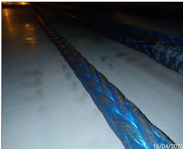
33. General view of the rope.