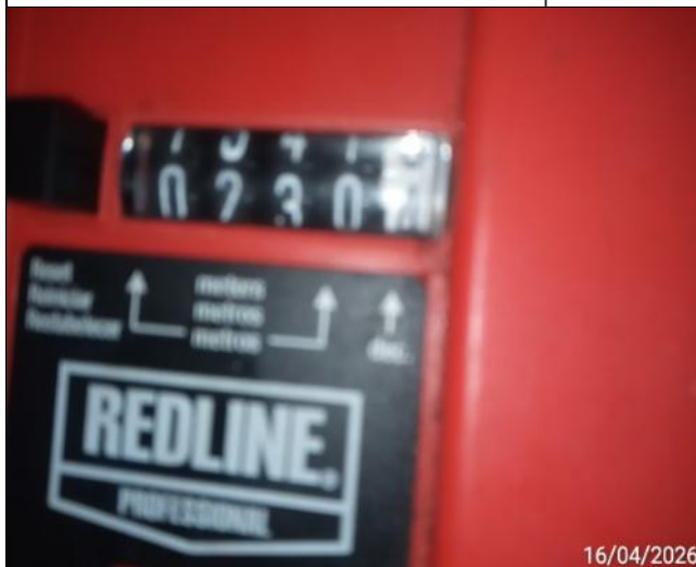
55. Measurement of the rope, 230.4 meters.