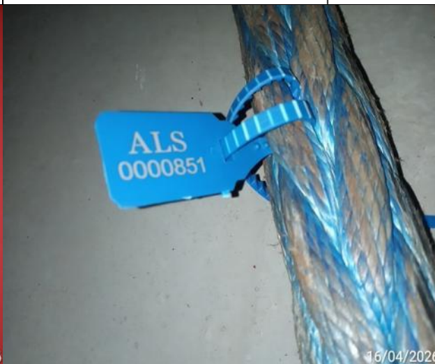
16. Seal N° 0000851.