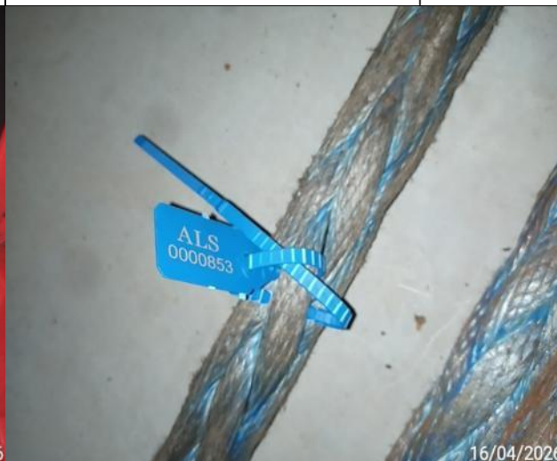
24. Seal N° 0000853.