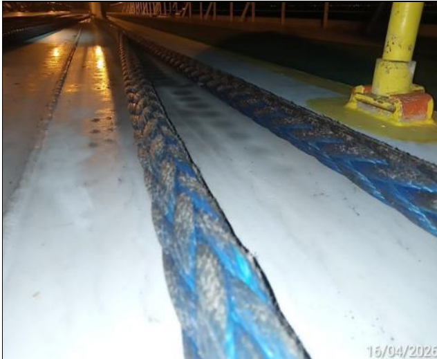
65. General view of the rope.