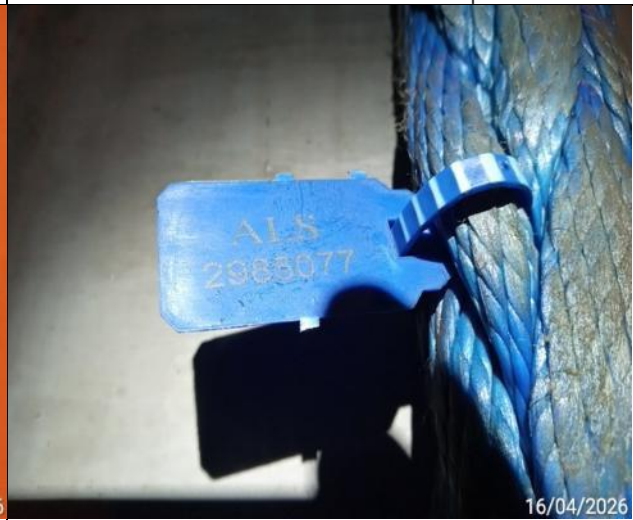
60. Seal N° 2985077.