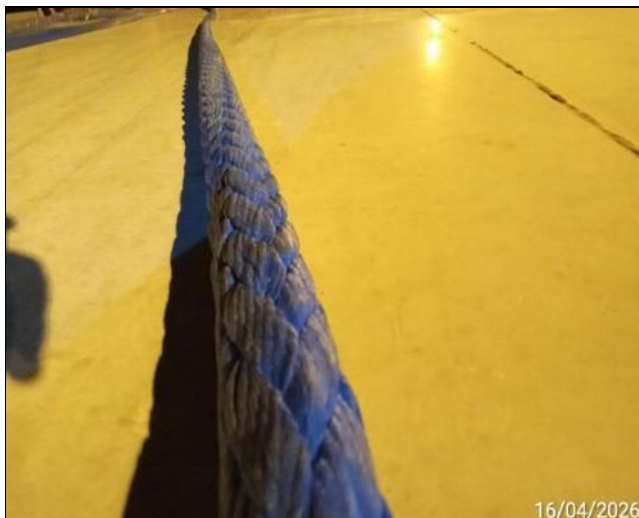
5. General view of the rope.