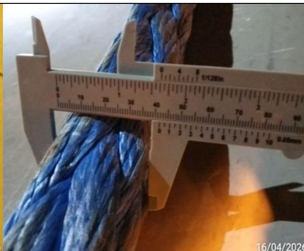
6. Diameter of the rope.