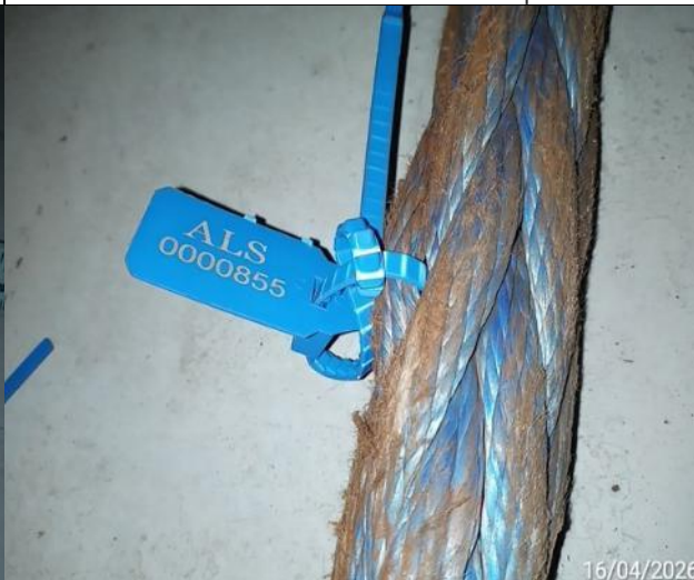
32. Seal N° 0000855.