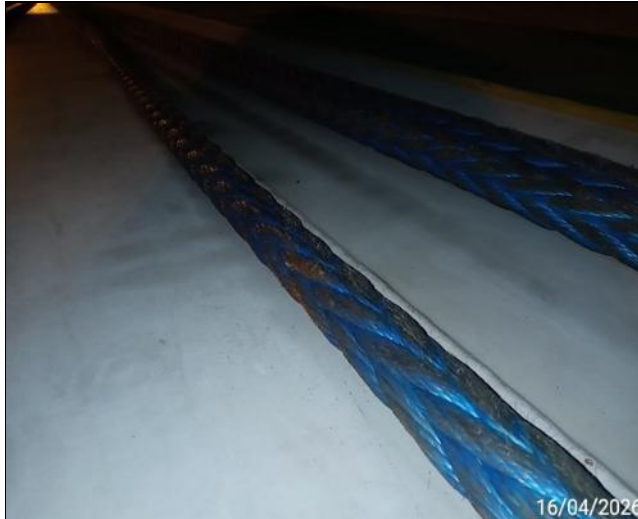
57. General view of the rope.