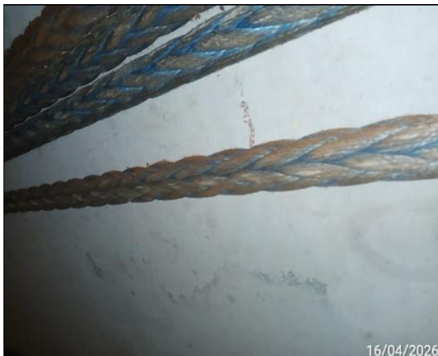
17. General view of the rope.