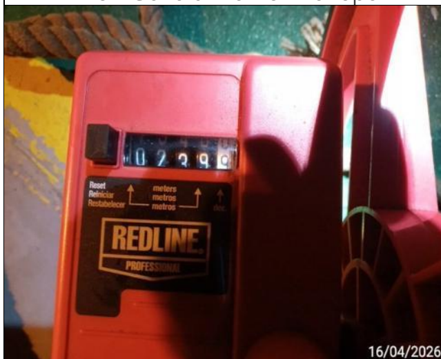
7. Measurement of the rope, 239.9 meters.