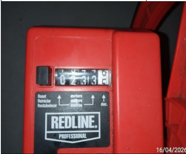
43. Measurement of the rope, 233.5 meters.