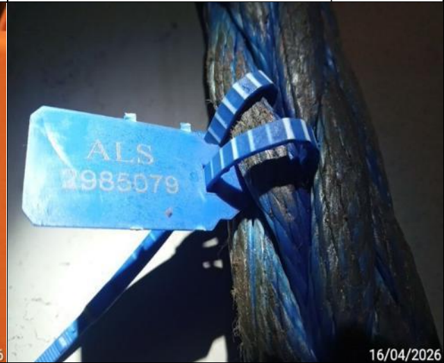
68. Seal N° 2985079.