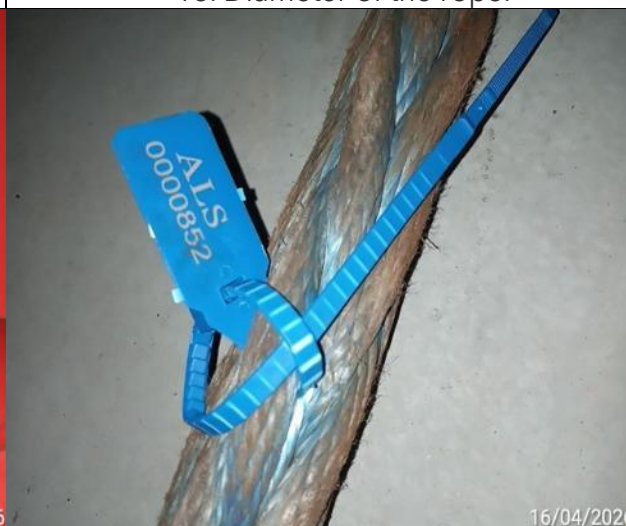
20. Seal N° 0000852.