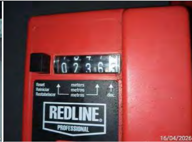
6. View of the mooring lines measurement.