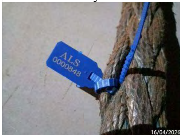
7. View of mooring line approved with ALS SEAL Nr. 0000848.