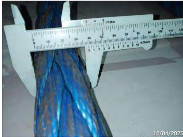
5. View of diameter measurement of the mooring lines.