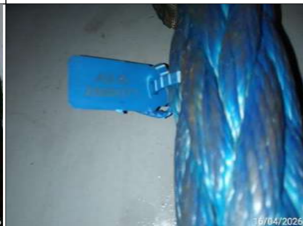
8. View of mooring line approved with ALS SEAL Nr. 2985071.