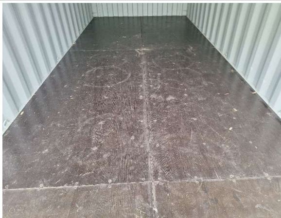
7. Container floor in good conditions.