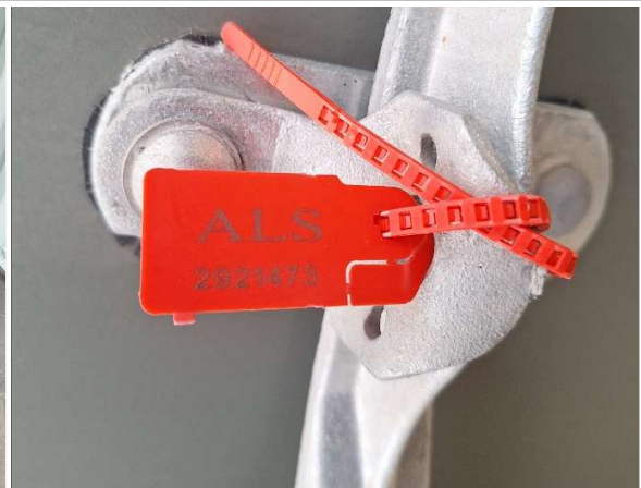
8. Container sealed with plastic seal Nr.2921473