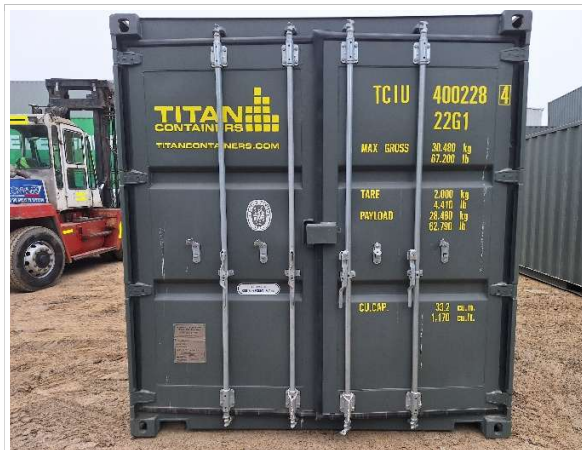
1. General view of unit 20'