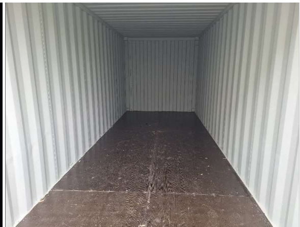
6. Inside without damage.