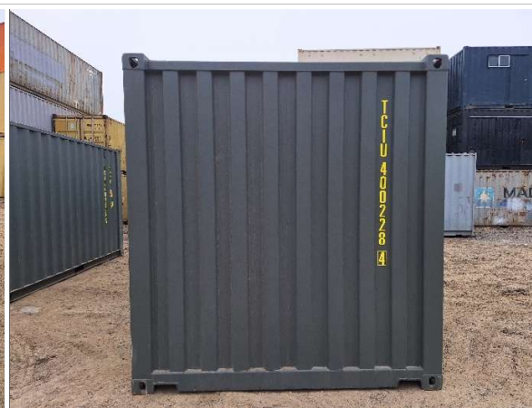
4. Front panel, front header, front sill, pillar and corner fitting in good condition.