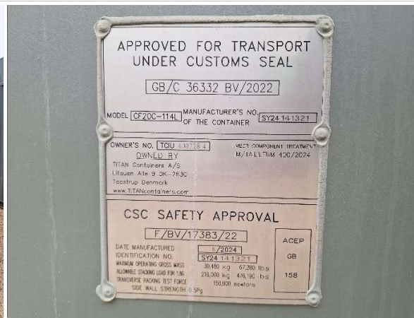
2. CSC plate