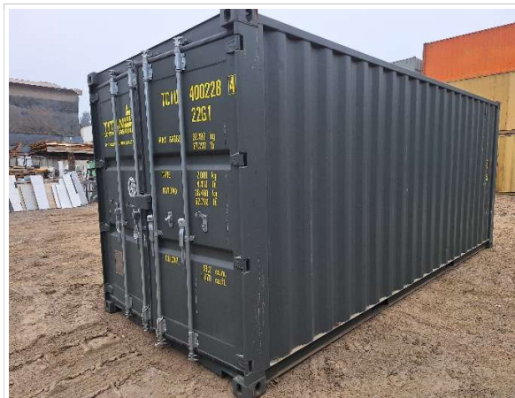
3. Side panel in good condition.