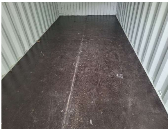
7. Container floor in good conditions.