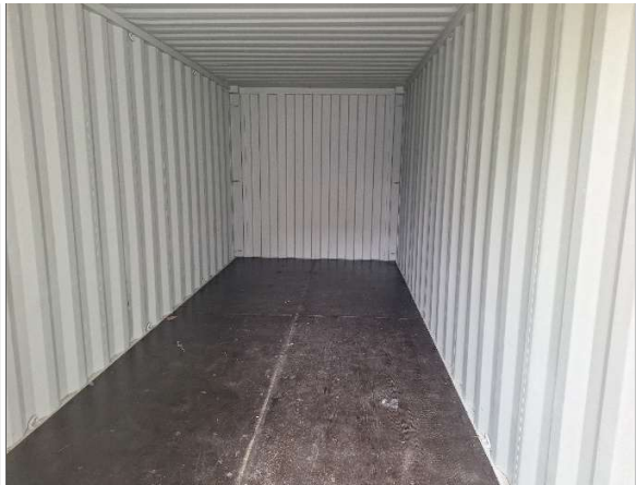
6. Inside without damage.