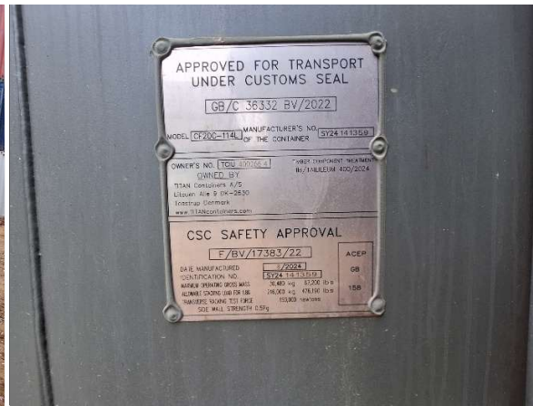
2. CSC plate