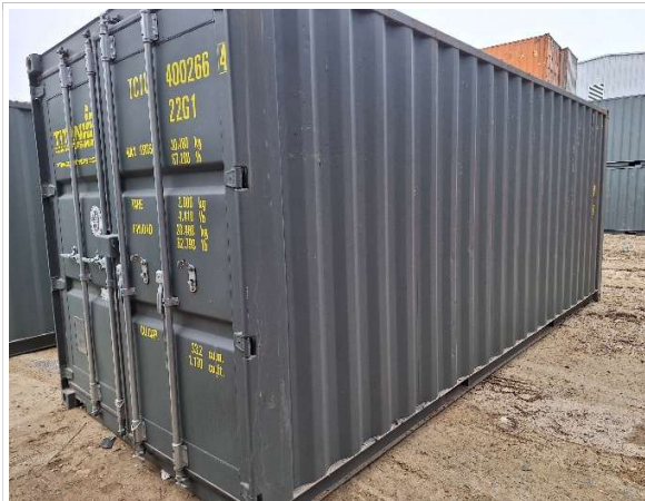
3. Side panel in good condition.