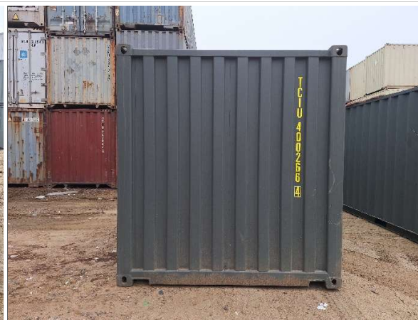
4. Front panel, front header, front sill, pillar and corner fitting in good condition.