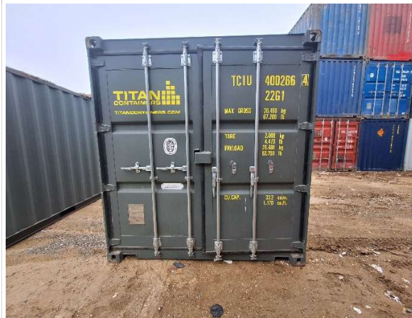
1. General view of unit 20'